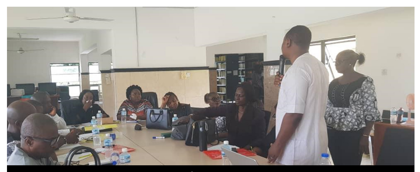
Capacity building workshop for women's rights advocates/CSOs on tools for effective monitoring, tracking releases, utilization, and implementation of gender-responsive budgeting in Cross River State.