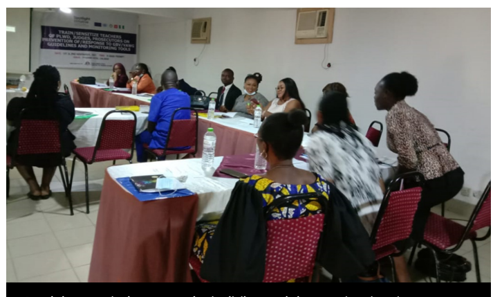
Participants during capacity building training on the development of guidelines and reporting tools