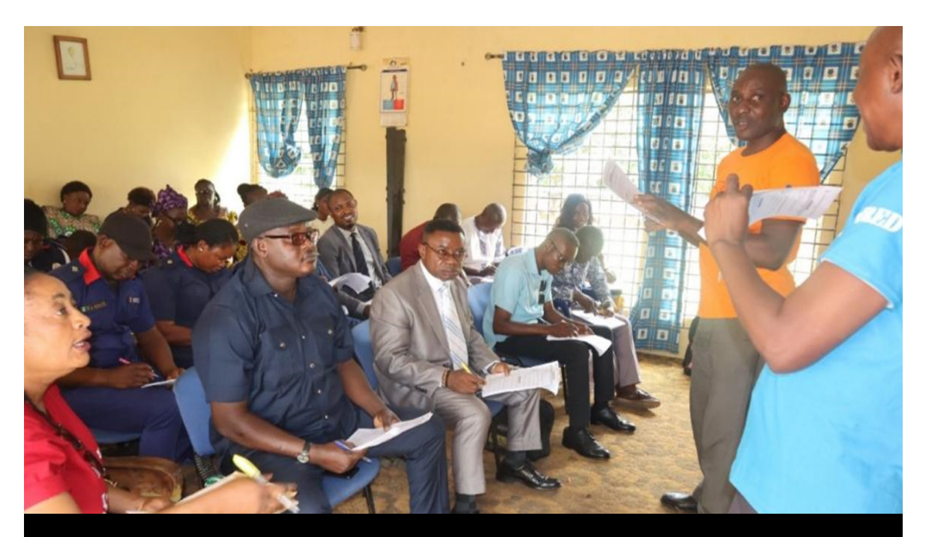
Cross Session of Trainees at the Catholic Maternity Hospital, Ogoja.