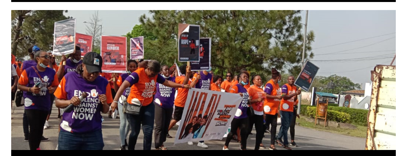
Road walk public sensitization activity