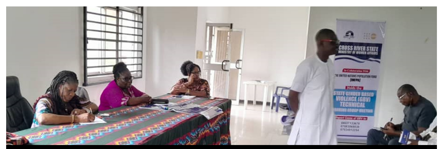
Capacity Building Workshop For MDAs and CSOs on the Practical Steps to Implement VAPP LAW, 2021