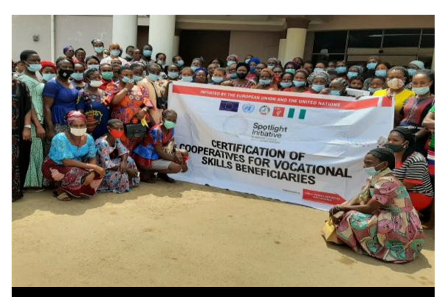
Capacity building trainings for beneficiaries and certification of cooperatives