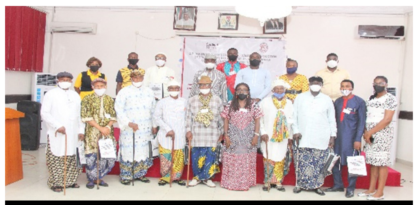
Capacity building training of stakeholders on relevant skillset on the abolition of 'Money Woman' practice and child marriage.