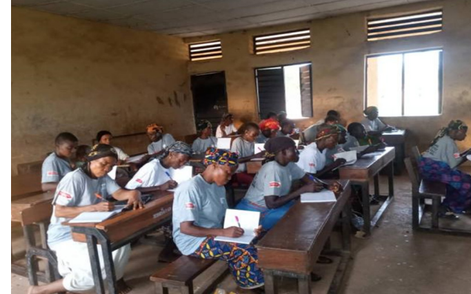
SCE beneficiaries during graduation and in SCE class