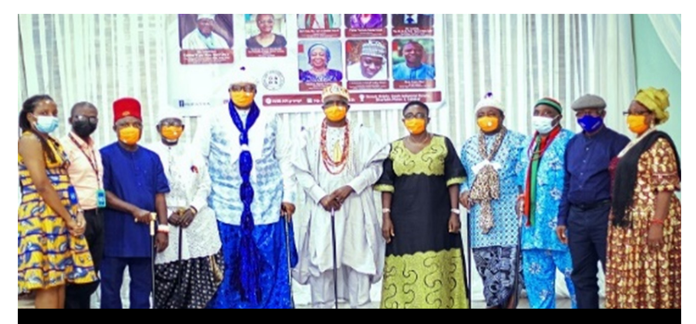
Session with men's network in communities