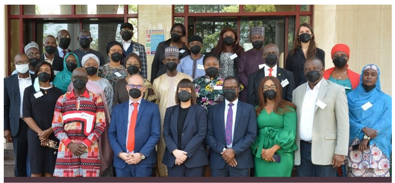
Officers of the National Agency for the Prohibition of Trafficking In Persons (NAPTIP) and the Nigerian Immigration Service (NIS) during the training on data gather ina and analysis.

In the past years, multiple armed groups, including Boko Haram and its splinter faction ISWAP, have used children as strategic pawns for their terror tactics in Nigeria. Boko Haram has abducted, recruited, and exploited thousands of children since the group began attacks around the Lake Chad Basin in 2009. From 2017 to 2019, the UN verified 5,741 grave violations against children in north-east Nigeria: 1,385 children had been recruited and used by Boko Haram. These numbers are likely to be far higher owing to access constraints in monitoring.