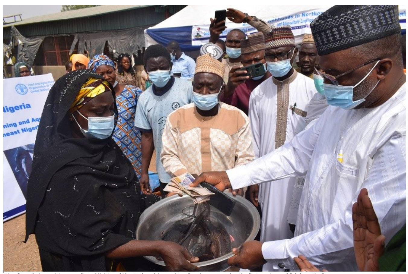
Hon Commissioner, Adamawa State Ministry of Livestock and Aquaculture Development makes the first purchase of fish from the farmers.

eneficiaries of an initiative by the Food and Agriculture Organization of the United Nations (FAO) in Yola, Adamawa state have reported to have added more sources of income and therefore improve the welfare and nutritional status of their households.