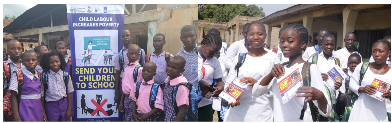
Left: St. John's Anglican Caring Heart Mega Primary School, Fagbo, Ondo State. Right: Day Secondary School, Kpmakpma, Nigeri State

The ILO ACCEL Africa Project in Nigeria has supported 1,000 identified pupils in Ondo and Niger States with back -to-school kits, spearheading an exodus from cocoa farms and gold mines to classrooms while influencing how communities relate with child labour.