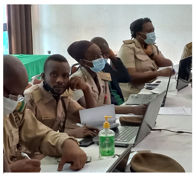
Officers of the National Agency for the Prohibition of Trafficking In Persons (NAPTIP) and the Nigerian Immigration Service (NIS) during the training on data gathering and analysis.

o successfully combat trafficking in persons and smuggling of migrants, the role of data gathering, and analysis is critical. Mastering this skill will enable relevant agencies to better understand trends and patterns of trafficking, as well as to evaluate more accurately the effectiveness and impact of government policies and legislation.