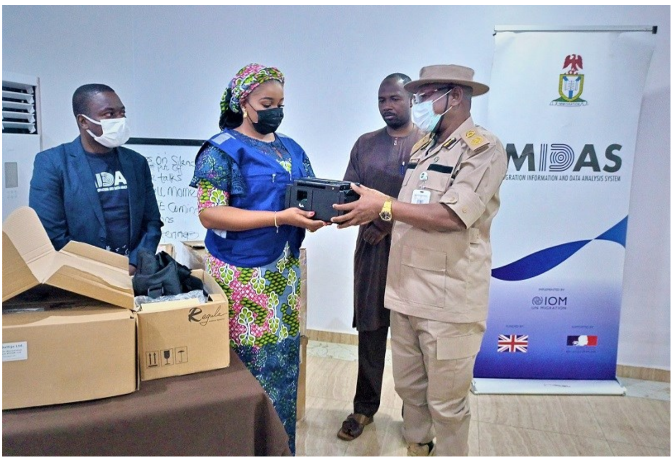
Handover of the Mobile device to the CIS Kano State Command

very year, many young Nigerian migrants embark on treacherous journeys as they leave their country searching for a better future abroad. Migrants travelling via irregular routes face risks such as trafficking in persons (TiP), extortion, physical abuse, torture, forced labour, rape and even death. Nigeria's border with Niger and the Republic of Benin have been major gateways for traffickers, smugglers and migrants taking on irregular routes in search of greener pastures.