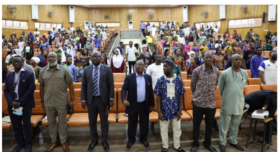
Akosile, highlighted the importance of Dignitaries at the observance of the World Radio Day in Lagos.

He advised the students of mass communication to think radio and come up with creative programme ideas that would target their