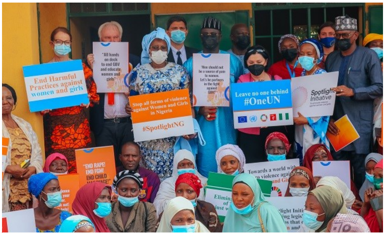
A group photograph of the EU-UN and Government Delegation, with Beneficiaries of the Spotlight Initiative Second Chance Education Programme at Mass Education, Yola.

High-Level Monitoring Visit to Adamawa by the Honorable Minister for Women Affairs, Federal Minister of State for Finance, Budget and National Planning, the European Union Ambassador and Head of EU Delegation in Nigeria, the UN Resident Coordinator, Heads of the Spotlight Initiative UN Agencies in Nigeria