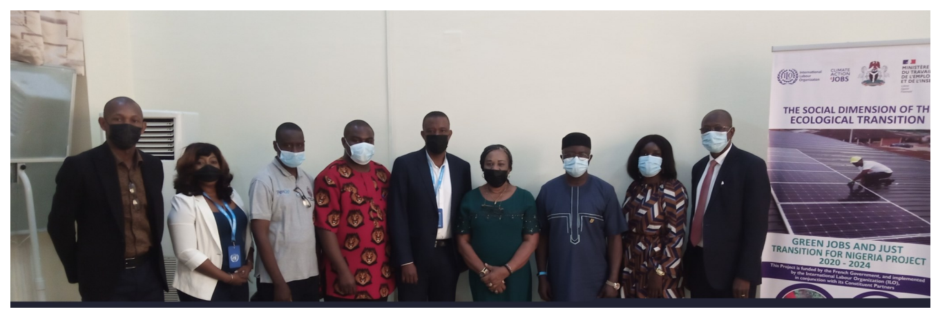
A group photograph of members of the Steering Committee on 'Just Transition and Green Jobs for Nigeria' Project'.

The Steering Committee of the ILO Just Transition and Green Jobs for Nigeria Project met on 27th January 2022 to map out strategies for effective implementation of the project in Nigeria. This followed the appointment of a National Project Coordinator (NPC), whose main function is to manage the implementation of the project.