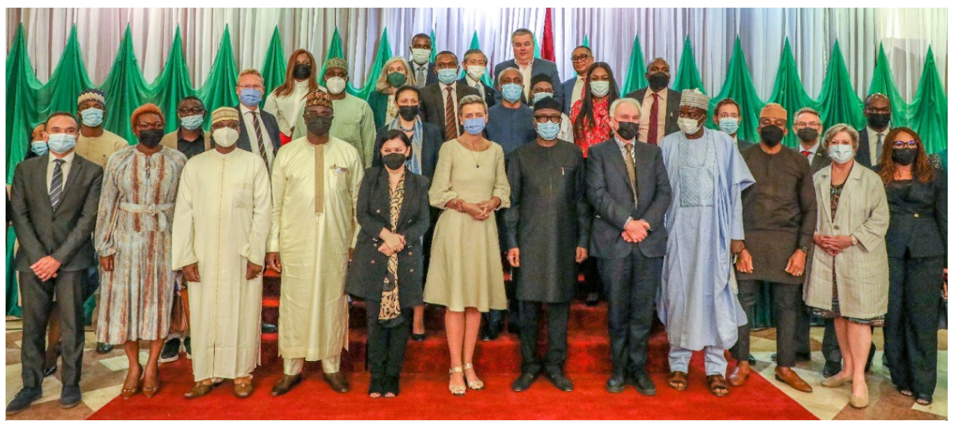
Ambassadors and high-level representatives from Nigeria, the United States, United Kingdom, Japan, Norway and United Nations as well as EuroCham Nigeria and private sector leaders, were present at the launch event.

...and international aid, to achieve the Sustainable Development Goals and address some of the country's biggest challenges, like youth unemployment. The Jubilee Fellows Fund provides an opportunity for a wide range of stakeholders, including private sector, start-ups, foundations, international financial institutions, philanthropists and multilateral and bilateral donors to contribute funding towards the implementation of the NJFP, helping to provide a solution to the high rate of unemployment of young people across the country.