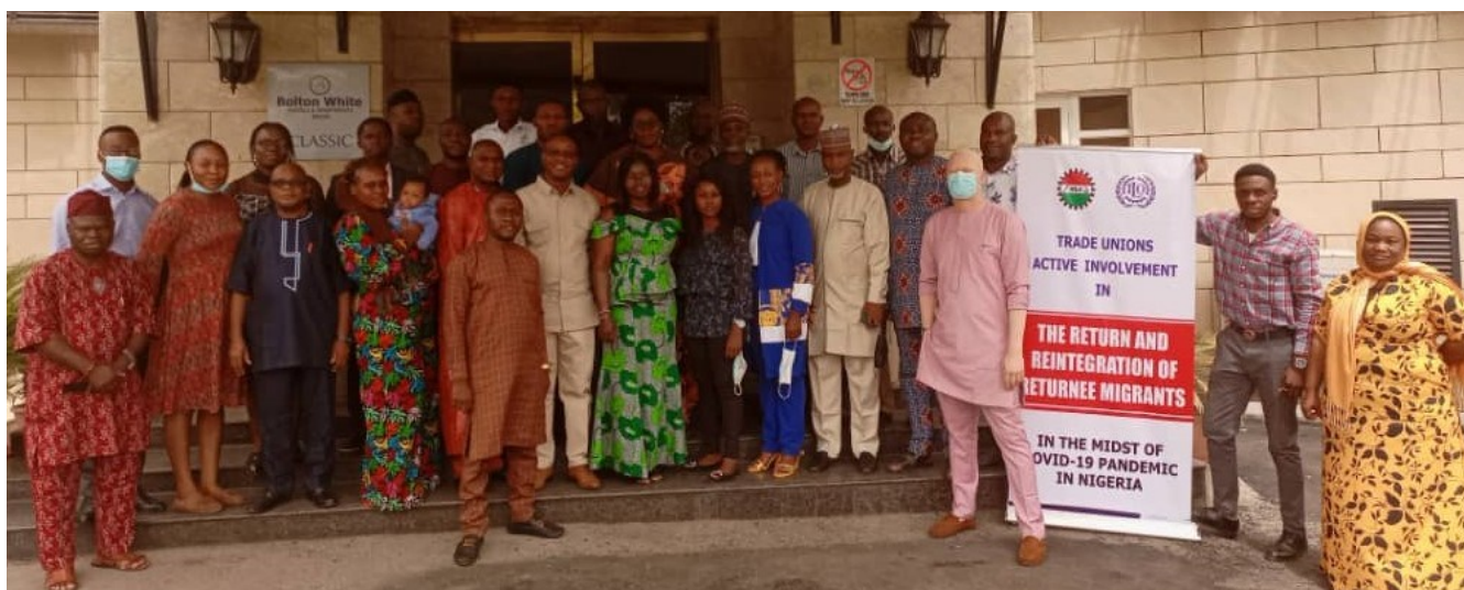
Group Photograph of Participants at the two – day review and validation workshop on Information Guide for Reintegration of Migrant Workers.

Following the need to ensure the sustainable return and reintegration of migrant workers into Nigerian society, the ILO provided technical and financial support to enable workers' organizations in Nigeria to develop an Information Guide to complement the national Standard Operating Procedures and practices.