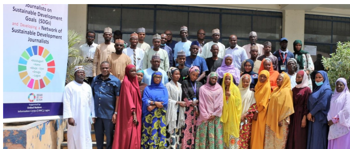
A group photograph of participants at the training in Kano, Kano State,

thriving; while desertification and land degradation pose a huge challenge." She explained, 'all these are issues connected to and expected to be addressed by the SDGs.