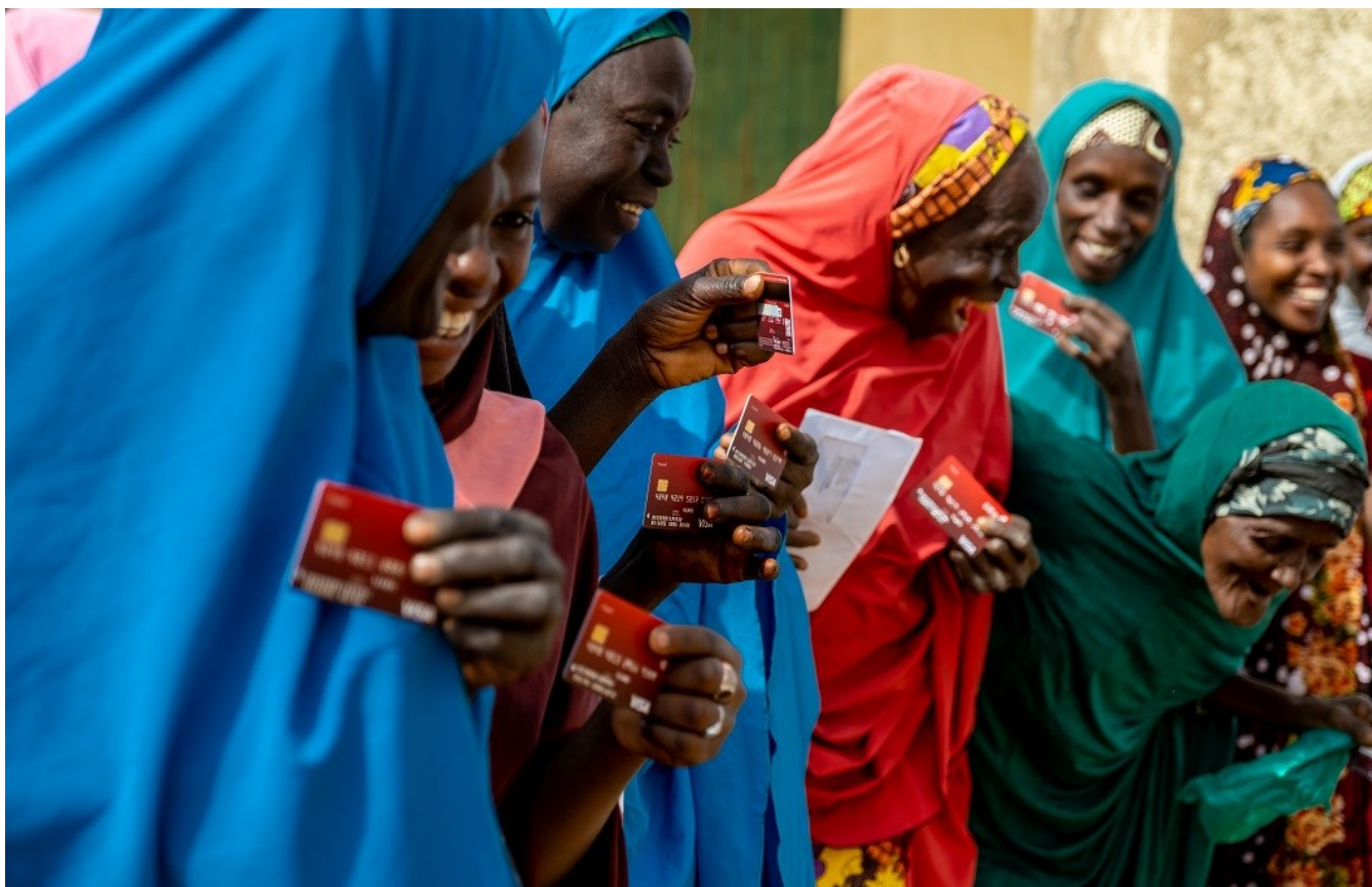
Excited women beneficiaries of WFP's interventions.

The United Nations World Food Programme (WFP) received the sum of US$1 million in 2021 from the Government of Nigeria as part of an ECOWAS humanitarian assistance to the Nigerian Government for victims of violent conflicts in North West and North East Nigeria.