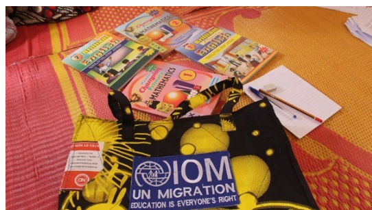
IOM distributes learner kits, including books, pencils, notebook and other essentials, for the skills enhancement trainings.

The WPP started in 2016, by carrying out a pilot study in Adamawa state and with support from USAID it was extended to more LGAs in northeast Nigeria in 2018.