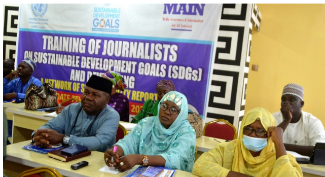
A cross-section of participants at the training in Maiduguri, Borno State.

...for the achievement of the Global Goals and for our national development."