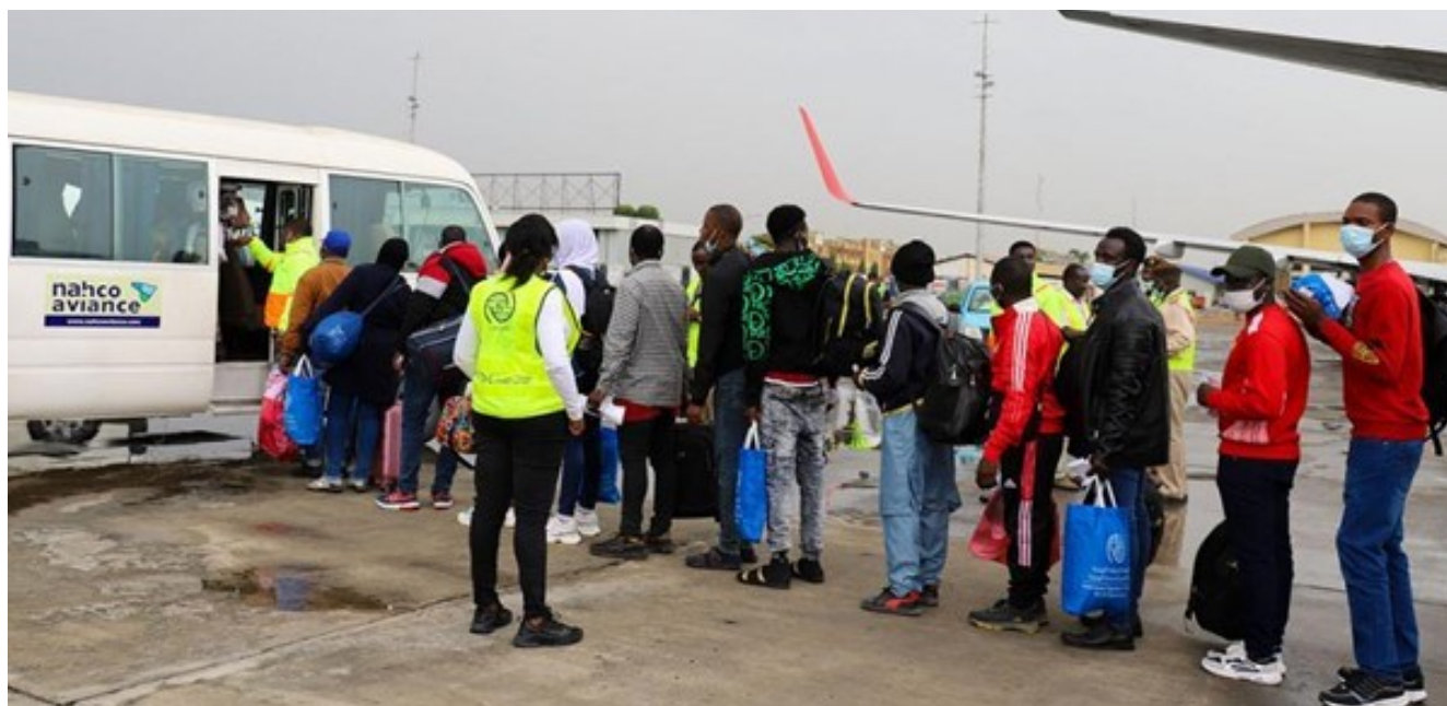
Nigerian migrants arrive safely at the Murtala Muhammed International Airport in Lagos

The International Organization for Migration (IOM) yesterday assisted the safe return home of 162 Nigerian migrants from Libya, the fourth such charter flight for this year. So far 19,452 Nigerians have been assisted to voluntarily return home between April 2017 and February 2022, with more than 500 assisted this year alone.