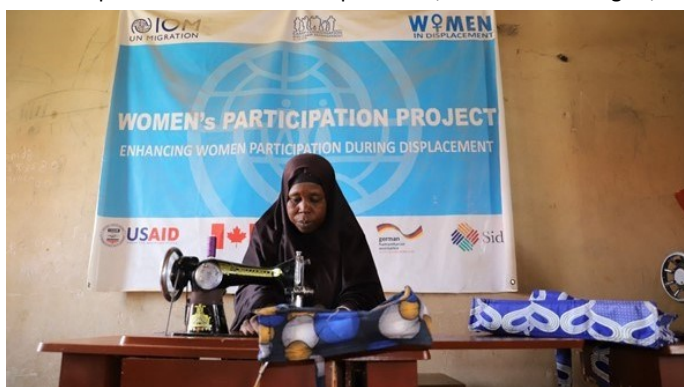
New skills courtesy of IOM's Women's Participation Project are empowering women and girls in north-east Nigeria.

They experience displacement differently from men and boys and face specific challenges such as exclusion from decision making processes and participation in livelihood activities. Those with disabilities are further excluded and alienated which has a direct impact on their well-being and psychosocial health. Their concerns and voices are unheard.