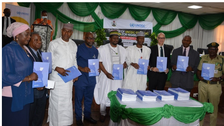
EFCC Chairman, Abdulrasheed Bawa, UNODC Country Representative, Oliver Stolpe flanked by stakeholders at the launch of UNODC's Strategic Vision for Nigeria 2030.

UNODC Country Representative to Nigeria, Oliver Stolpe said through the Strategic Vision for Nigeria, UNODC aim to achieve the following: "make the criminal justice system more effective; safeguard institutions and the economy