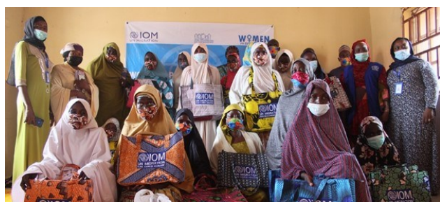
Women at Gubio Camp in north-east Nigeria have learned through skill acquisition training how to tailor bags and sell them to generate income.

cluding those with disabilities, were trained in the production of facemasks. In just a few months, they produced 21,000 facemasks which were distributed in Gubio camp, Borno State, to help prevent the spread of COVID-19.