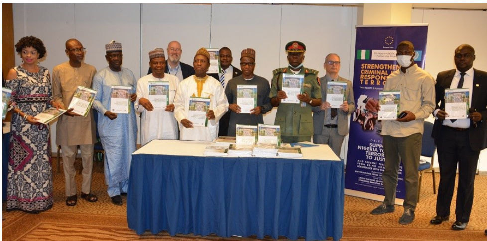
Rear Admiral YEM Musa, Coordinator of the Counter Terrorism Centre (CTC) in the Office of the National Security Adviser (centre) poses with stakeholders at the unveiling of the training Module.

strategies can play in contributing to the outcome of criminal proceedings, and consequently to the effectiveness of the Nigerian criminal justice system at large.