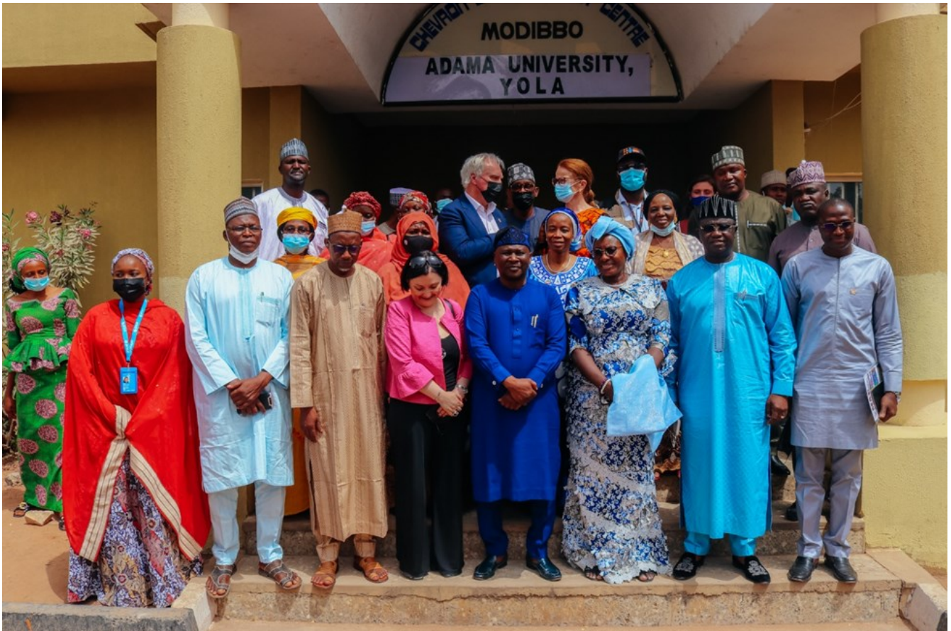
A group photograph of the High-Level Monitoring delegation to Adamawa by the Honorable Minister for Women Affairs, Federal Minister of State for Finance, Budget and National Planning, the European Union Ambassador and Head of EU Delegation in Nigeria, the UN Resident Coordinator, Heads of the Spotlight Initiative UN Agencies in Nigeria

Located in the highlands of mountains and breath-taking sceneries in the country, Adamawa state played host to the European Union delegates, the United Nations Agencies and the Civil Society Reference Group led by the UN Resident Coordinator on 21st February 2022.