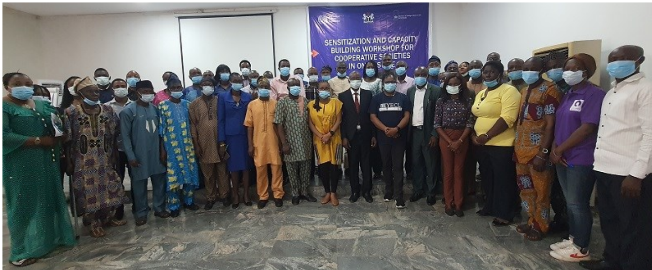
A group photograph of participants

The ILO ACCEL Africa Project in Nigeria is extending partnerships for the elimination of child labour and forced labour in Nigeria by strengthening support systems for farmers especially in the cocoa value chain, where child labour is prevalent owing to poverty.