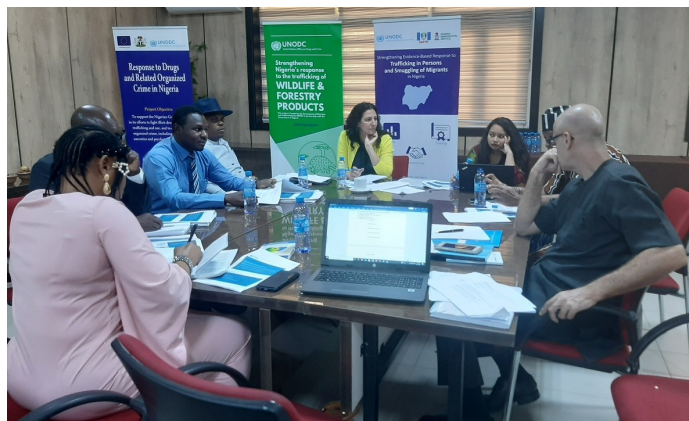
Cross section of participants brainstorming during the NOCTA workshop held in Niger State

Over the past decades, Nigerian transnational organized crime has evolved structurally, grown more sophisticated and