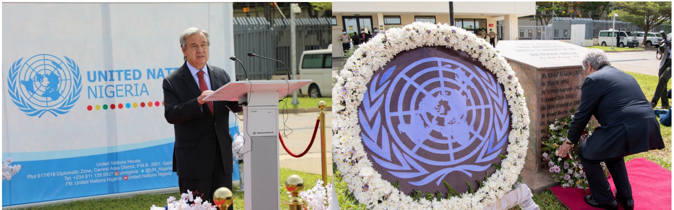
United Nations Secretary-General Antonio Guterres speaks and lays a wreath in honour of victims of the 2011 bomb blast at UN House Abuja.

United Nations Secretary-General Antonio Guterres, on Wednesday 4 March 2022, laid a wreath in honour of victims of the 2011 bomb blast at UN House Abuja.