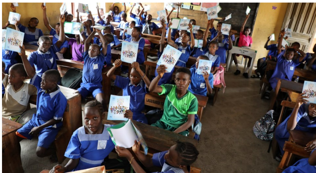
Across-section of pupils displaying their 'Climate Action Super Heroes' exercise books distributed by UNIC at an educational briefing session