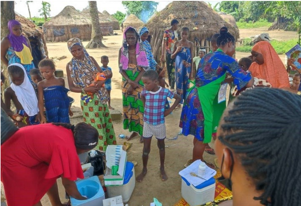
Vaccination exercise at a remote nomadic settlement in Rivers State

ble children living within the borders are vaccinated will prevent the importation of the virus into the country.