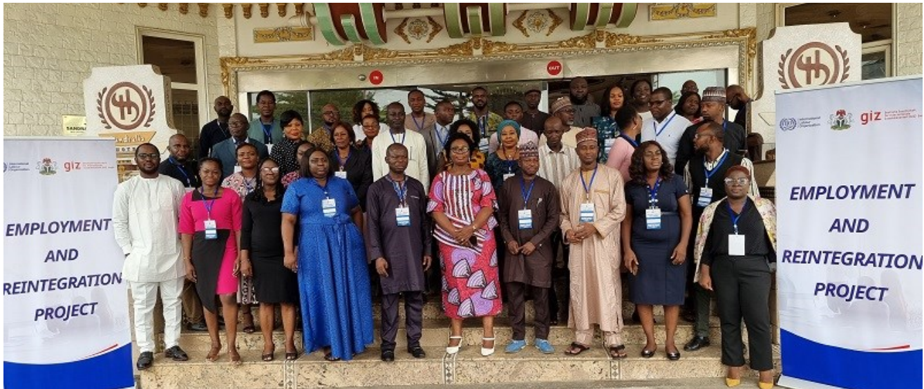
A group photograph of participants at the three-day Train the Trainers workshop for officials of the Ministry drawn from various States of the Federation.

In its continued efforts aimed at improving the employability of Nigerian youths, the ILO Abuja Office through its Employment and Reintegration Project and in collaboration with GIZ, supported the Federal Ministry of Labour and Employment by building the capacity of its officials during a three-day Train the Trainers workshop.