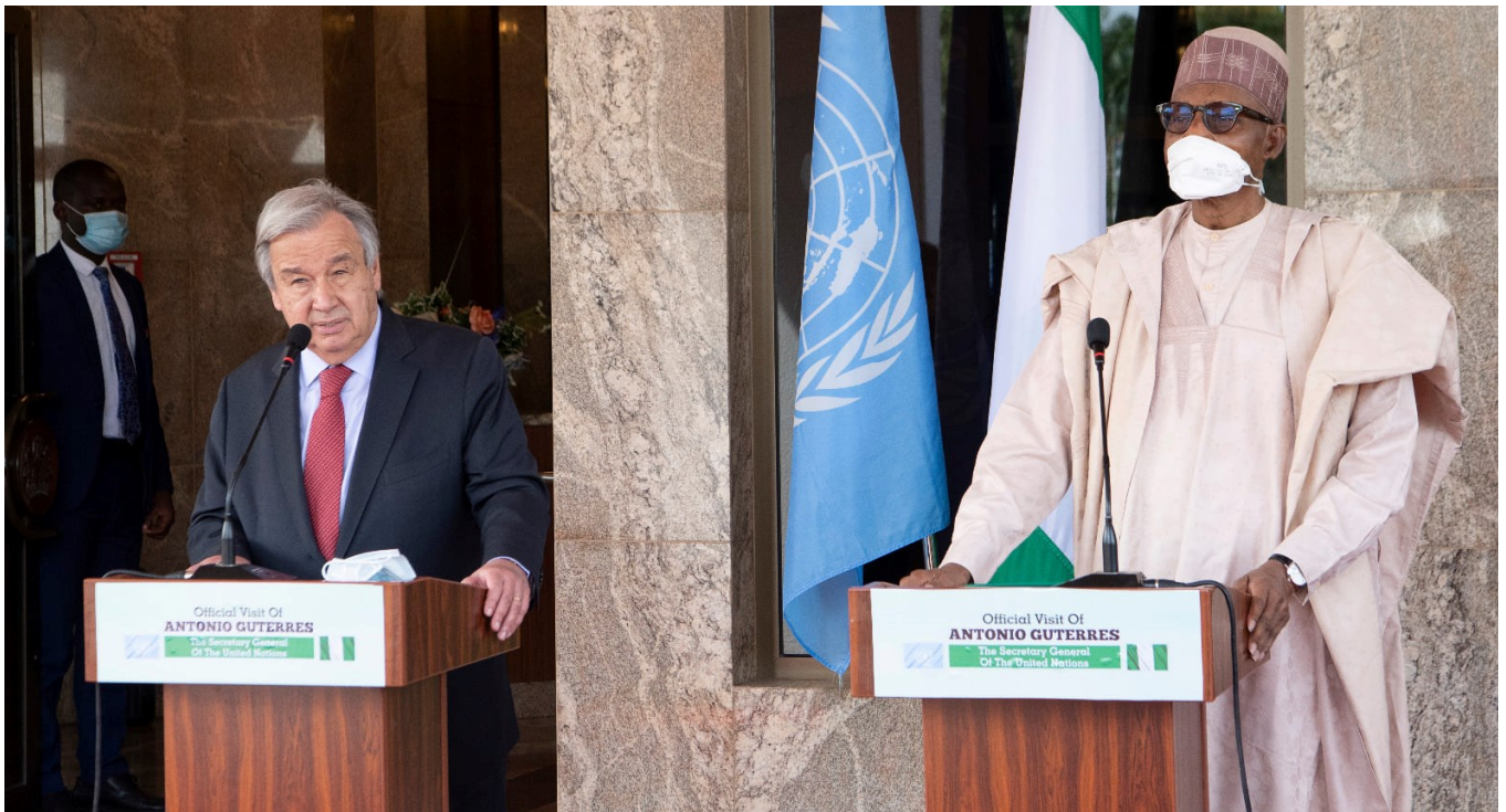
United Nations Secretary-General Antonio Guterres (Left) and President Muhammadu Buhari (Right), at a joint Press Stakeout held on Wednesday 4 May 2022., the State House Abuja.

United Nations Secretary-General Antonio Guterres has acknowledged that "Nigeria is a country where Africa's promise and potential come to vivid life. I saw this first-hand in my meetings today with women and young people, whose vision and commitment were deeply inspiring."