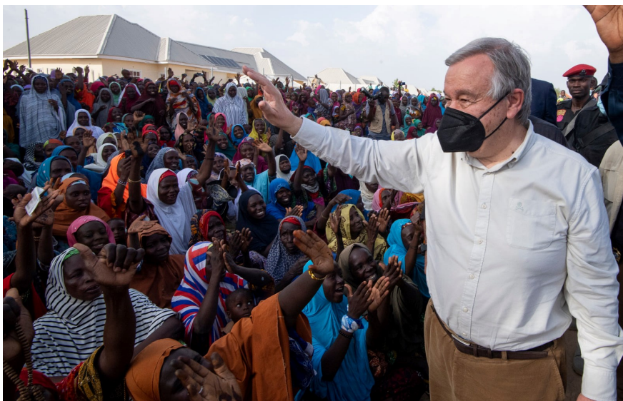
United Nations Secretary-General Antonio Guterres (Left) acknowledges greetings by Internally Displaced Persons (IDPs) at a camp in Maiduguri, Borno State capital.

The governor used the opportunity to express gratitude to the UN secretary-general, members of the international communities, humanitarian actors and all stakeholders for their support to the people of the state.