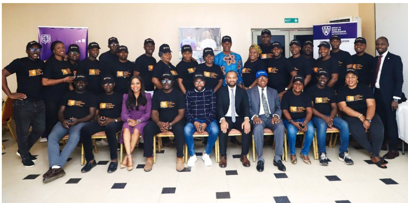
A group photograph of participants and resource persons at the training on reporting migration stories held in Lagos.

The relevance of media in all aspects of human endeavour cannot be overemphasised, especially in the area of better migration management. Media engagement is imperative given the pressing need to promote safe and regular migration as well as discourage irregular migration.