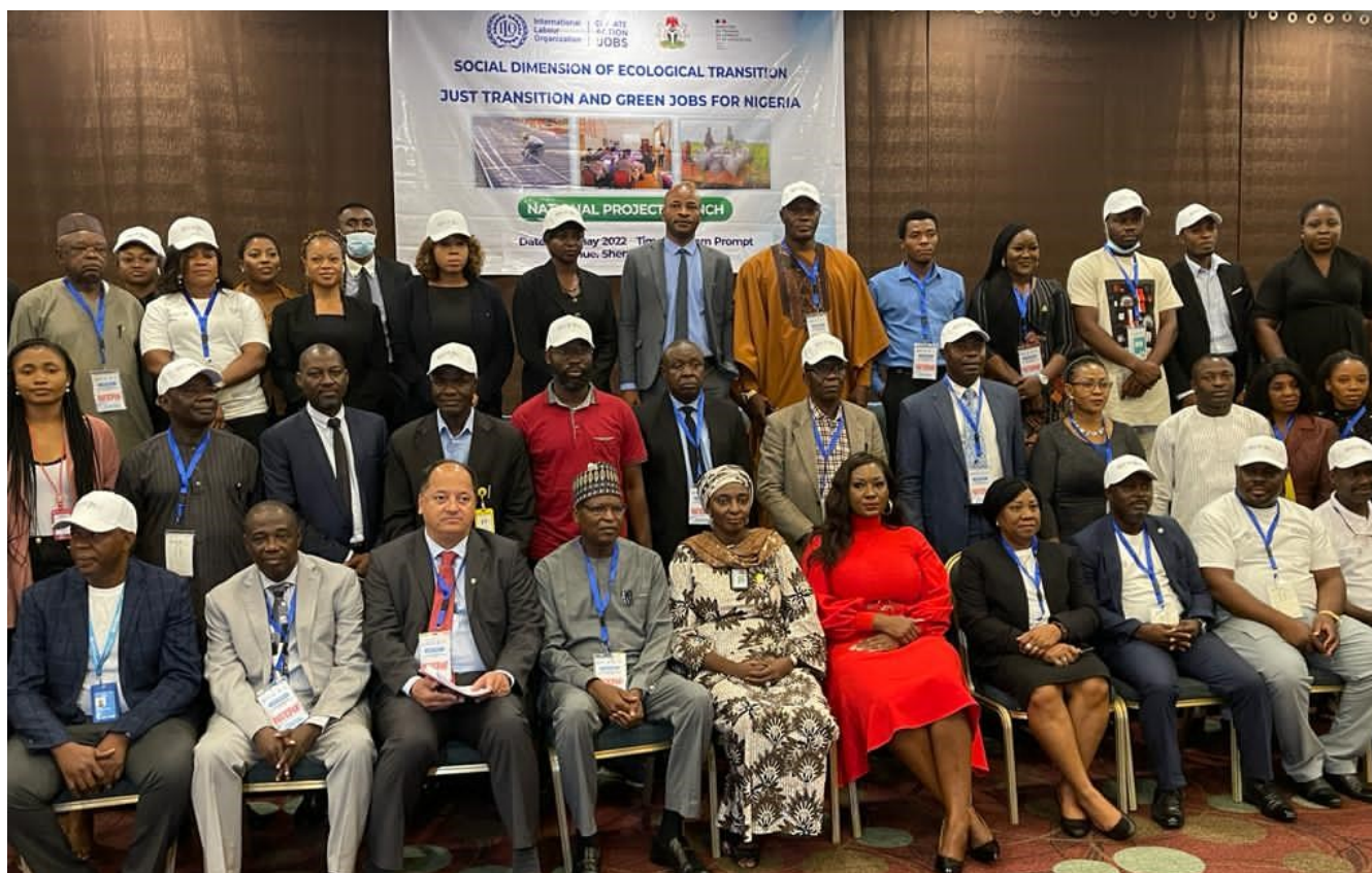
A group photograph of participants at the launch

The government of Nigeria, representatives of employers' and workers' organizations and development partners have launched a new initiative to place jobs and social justice at the centre of the ecological transition. The project is being funded by the French government while the International Labour Organisation (ILO) is supporting its implementation.