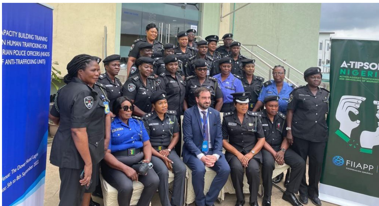
Participants at the workshop in Lagos Nigeria.

I nternational Organization for Migration (IOM), in collaboration with the Fundación Internacional y para Iberoamérica de Administración y Políticas Públicas (FIIAPP) supported the National Agency for the prohibition of Trafficking in persons (NAPTIP) to train 36 heads of Anti-Human Trafficking and Gender Desks on the need to strengthen existing capacity, improve coordination and collaboration between the Nigeria Police Force (NPF) and the National Agency for the Prohibition of Trafficking in Persons.