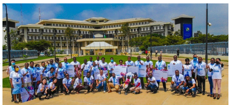
A group photograph of participants in the peace walk.

The activities started on 12 September and ended on 21 September, the International Peace Day. The UN agencies