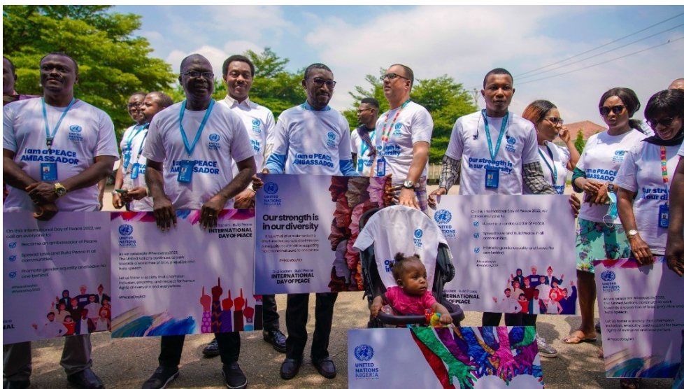
A cross-section of participants in the peace walk.

have agreed to join a common approach to celebrate the International Peace Day in 2022.