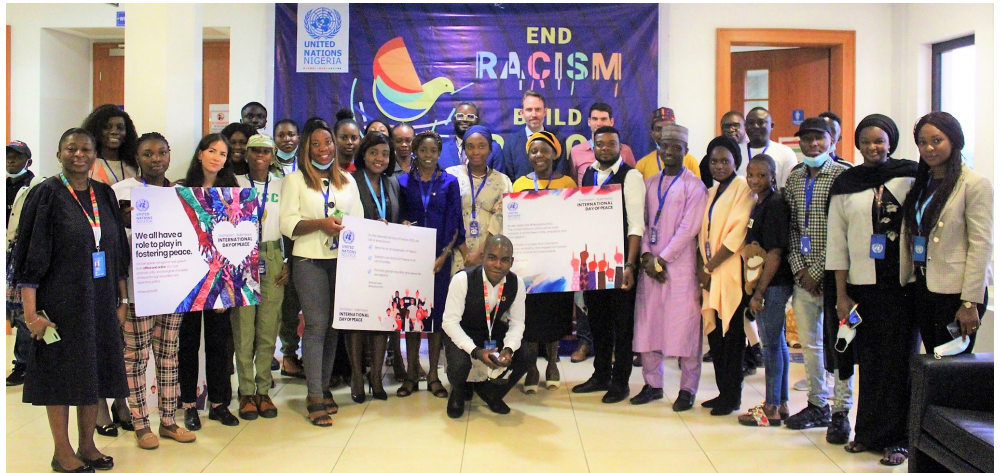
A group photograph as some staff members and partners.

The commemoration featured several UN agencies including WHO, UNDP, UNODC, UNFPA, OHCHR, UNHCR UNICEF, UNWomen and ILO. The Celebration kicked off with the Peace Walk on Diplomatic Drive with participants from across the UN House and its environs. For the rest of the days, several activities were conducted including panel discussions to commemorate the 2022 International Day of Peace, a publication exhibition from 6