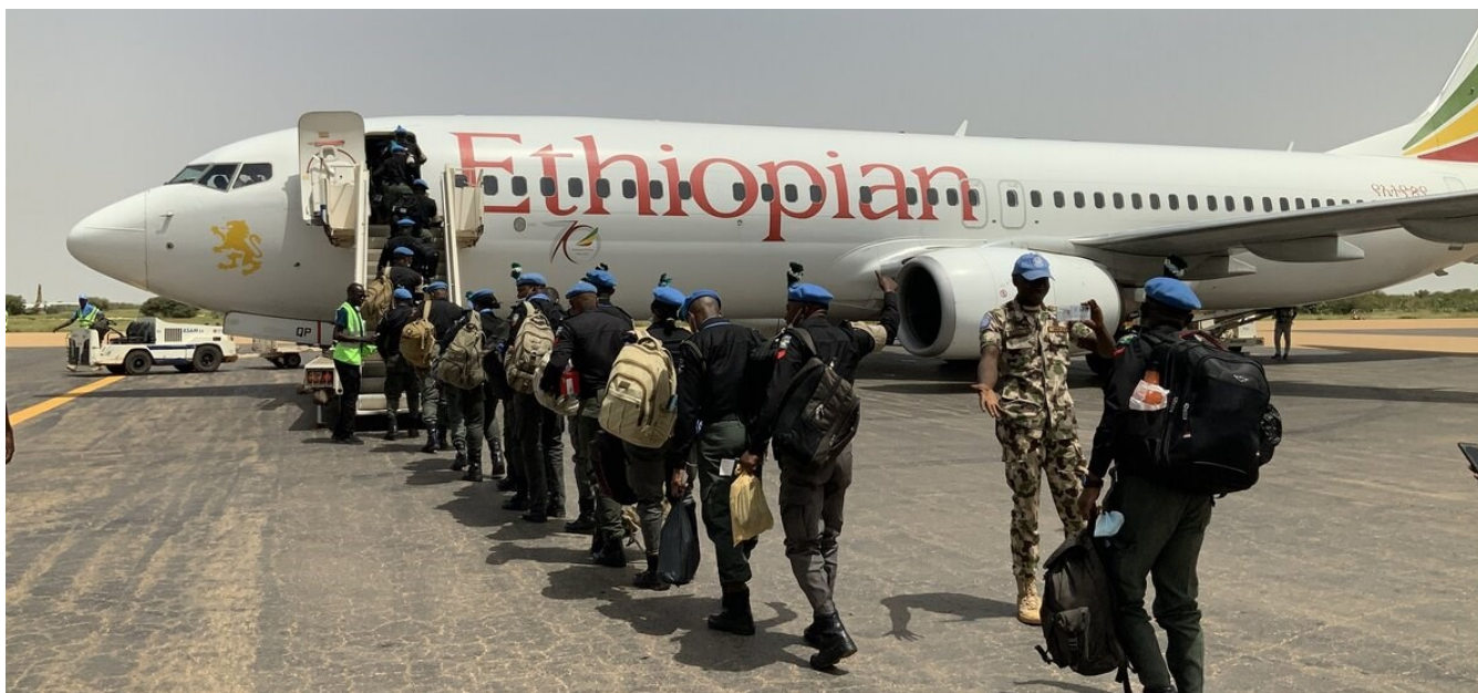
On the tarmac of Timbuktu airport, a detachment of the Nigeria Formed Police Unit deployed to the United Nations Police (UNPOL/MINUSMA) in Timbuktu.

The formed police unit in Timbuktu alone conducted more than 200 patrols with the Malian security forces day and night, in addition to 135 long-range patrols. "We are proud of the work we have done here since our arrival in January 2021.