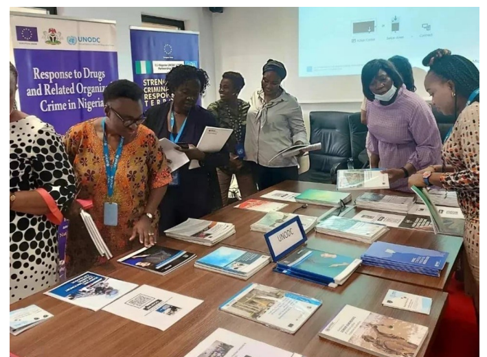
At the exhibition held at the UN House organised to mark the International Day of Peace

Agencies had an opportunity to learn about work being carried out by their counterparts and identify potential areas of synergy, in line with the spirit of One UN.