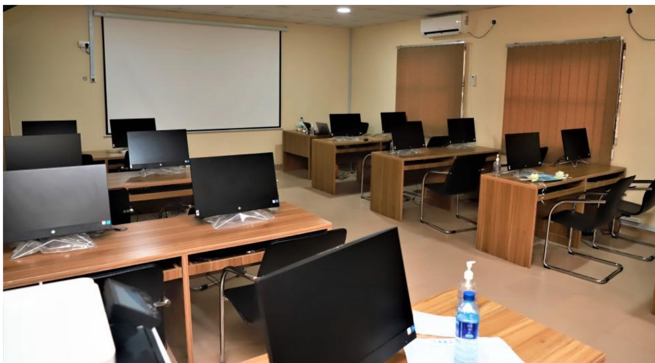
The Personnel Training Resource Centre at the Nigerian Immigration Service, Lagos Command.

The International Organization for Migration (IOM) in collaboration with the Nigeria Immigration Service and the Government of Netherlands has launched a new Personnel Training Resource Centre at the Lagos Command of the Nigeria Immigration Service (NIS).