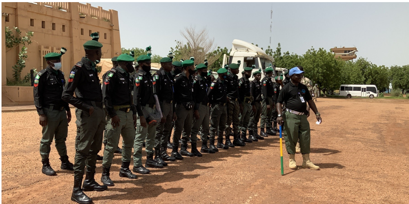
A detachment of the Nigeria Formed Police Unit deployed to the United Nations Police (UNPOL/MINUSMA) in Timbuktu.

After spending 20 months on Malian soil, elements of the formed police unit of the Federal Republic of Nigeria deployed to the United Nations Police (UNPOL/MINUSMA) in Timbuktu, are returning home. A total of 70 of them boarded an Ethiopian Airlines Boeing on September 8.