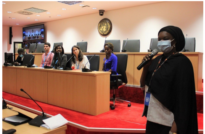
A cross-section of a panel discussion with UN Volunteers and youth, organised by UNFPA at the UN House in Abuja.

UNFPA, in collaboration with other United Nations agencies, organized a panel discussion with UN Volunteers and youth from outside of the UN to discuss on how peacebuilding, security, and human rights relates to their organizations' mandate area. The UNFPA Panel Discussion provided a platform that encouraged an exchange of views and experience sharing on the nexus between peace, security, human rights and the role of the youth particularly regarding civil society and youth action in Nigeria. The Panel Discussion provided an opportunity for greater understanding amongst youth of the nexus between peacebuilding, development and human rights; and enhanced awareness on mechanisms and unique opportunities that promote peace and achieving peace through the promulgation of human rights. It also contributed to cultivating youth responsibility to take up action that facilitates the achievement of peace and human rights.