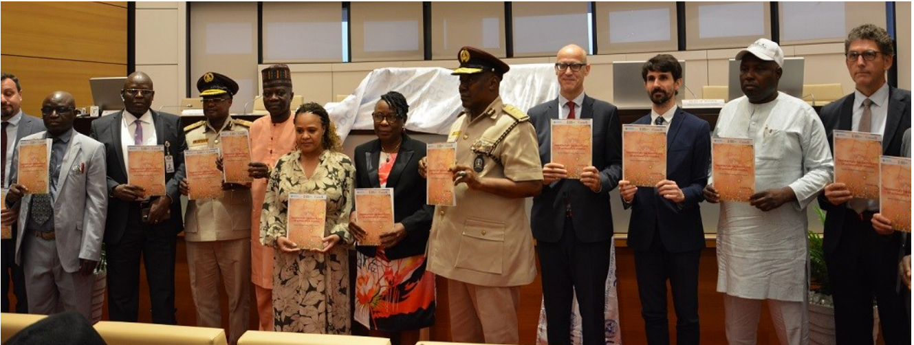
Presentation of the Observatory on Smuggling of Migrants in Nigeria by stakeholders during the launch

Research shows that 75% of Nigerian migrants planned to use smugglers or travel facilitators for overland journeys