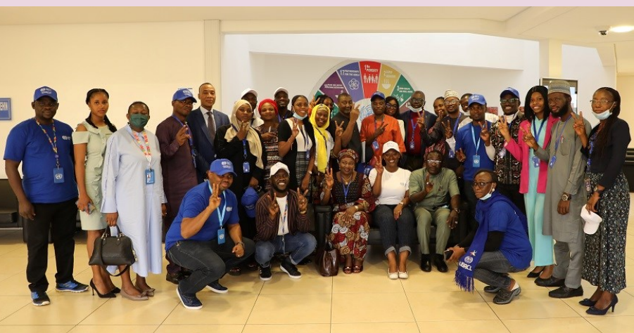
Liberia and Sierra Leone joined the Wife of the President, Mrs Aisha Buhari, represented by the Wife of the Governor of Kwara

which the government of Nigeria is working to ensure young people are involved in the development of Nigeria, so young people are engaged for peace building.