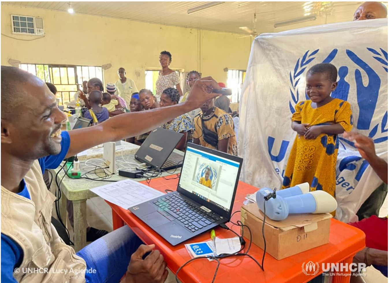
Comprehensive verification and registration of Cameroonian refugees by UNHCR, Nigerian government, and partners in Boki Local Government Area of Cross River State.

UNHCR, the UN Refugee Agency, commenced a comprehensive registration and verification of Cameroonian refugees in Nigeria, together with its partners, National Commission for Refugees, Migrants, and Internally Displaced Persons (NCFRMI), State Emergency Management Agency (SEMA), Nigeria Immigration Service (NIS), Caritas, and the Nigerian Red Cross Society. UNHCR also conducted a training for 70 people, which included government officials and its partners on protection principles and specific needs identification in preparation for the activity.