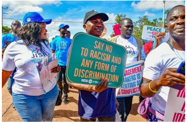
Peace Walk by Plateau Peacebuilding Agency with Members of the HeForShe Network & Partners