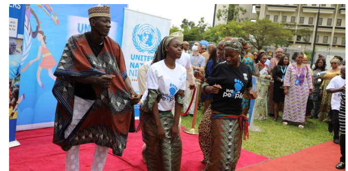
A cultural display by some staff members during the UN Day observance.

"We will not relent in our efforts to ensure that no one is left behind as we work together with the government towards the achievement of the Agenda 2030 for sustainable development." He said.