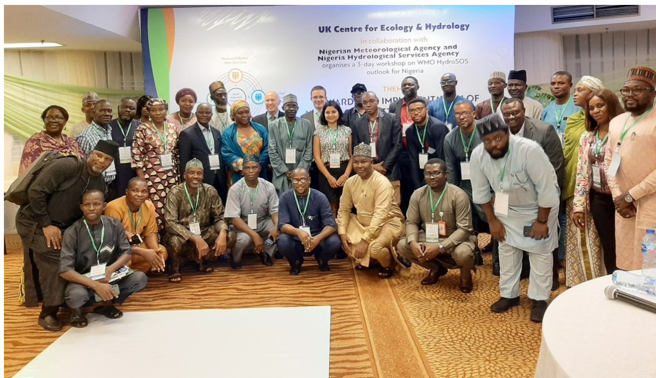
A group photograph of participants

The Nigerian Meteorological Agency (NiMet) and the Nigeria Hydrological Services Agency (NIHSA) have collaborated and technically launched the World Meteorological Organisation's (WMO) Hydrological Status and Outlook System (HydroSOS) in Nigeria. The implementation process is supported by WMO and the United Kingdom Center for Ecology and Hydrology (UKCEH).