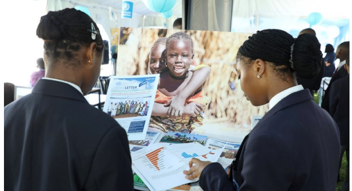
Two students of Premiere Academy, Lugbe Abuja read the UN Nigeria Newsletter during the exhibitions to mark the UN Day.