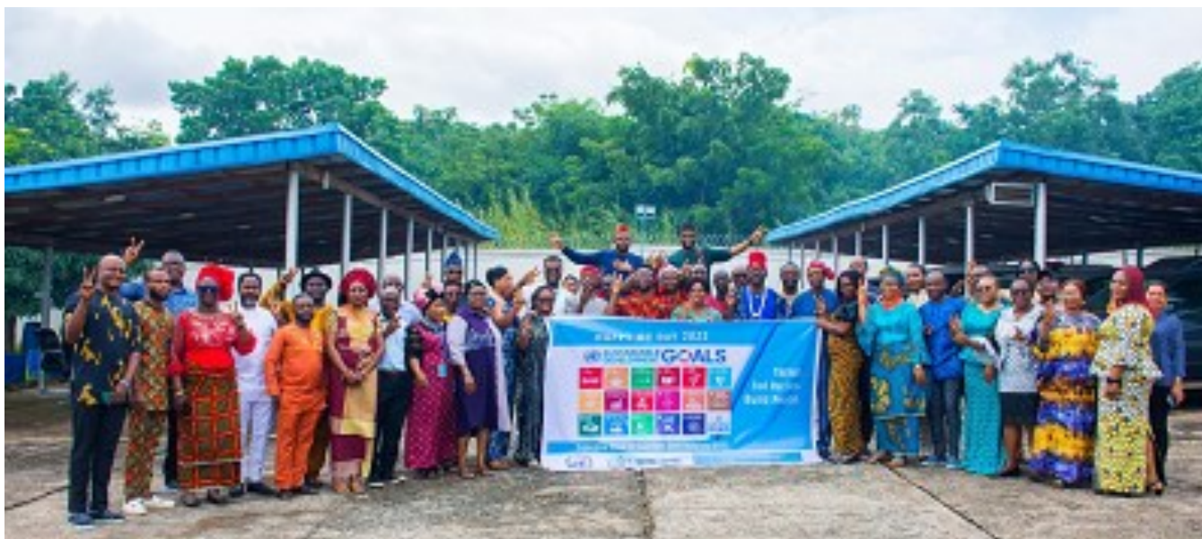
A cross-section of UN staff members in Enugu participating in the UN Day event.