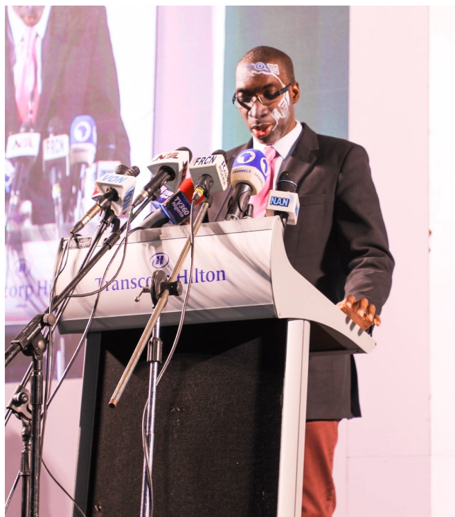
UNESCO Paris, Programme specialist in communication and information, Alton Grizzle, addresses the audience at the closing ceremony of the global conference in Abuja.

“Young people must be involved in the design, leadership, implementation, and assessment of media and information literacy policies and strategies at international, regional, national, and local levels.” They declared.