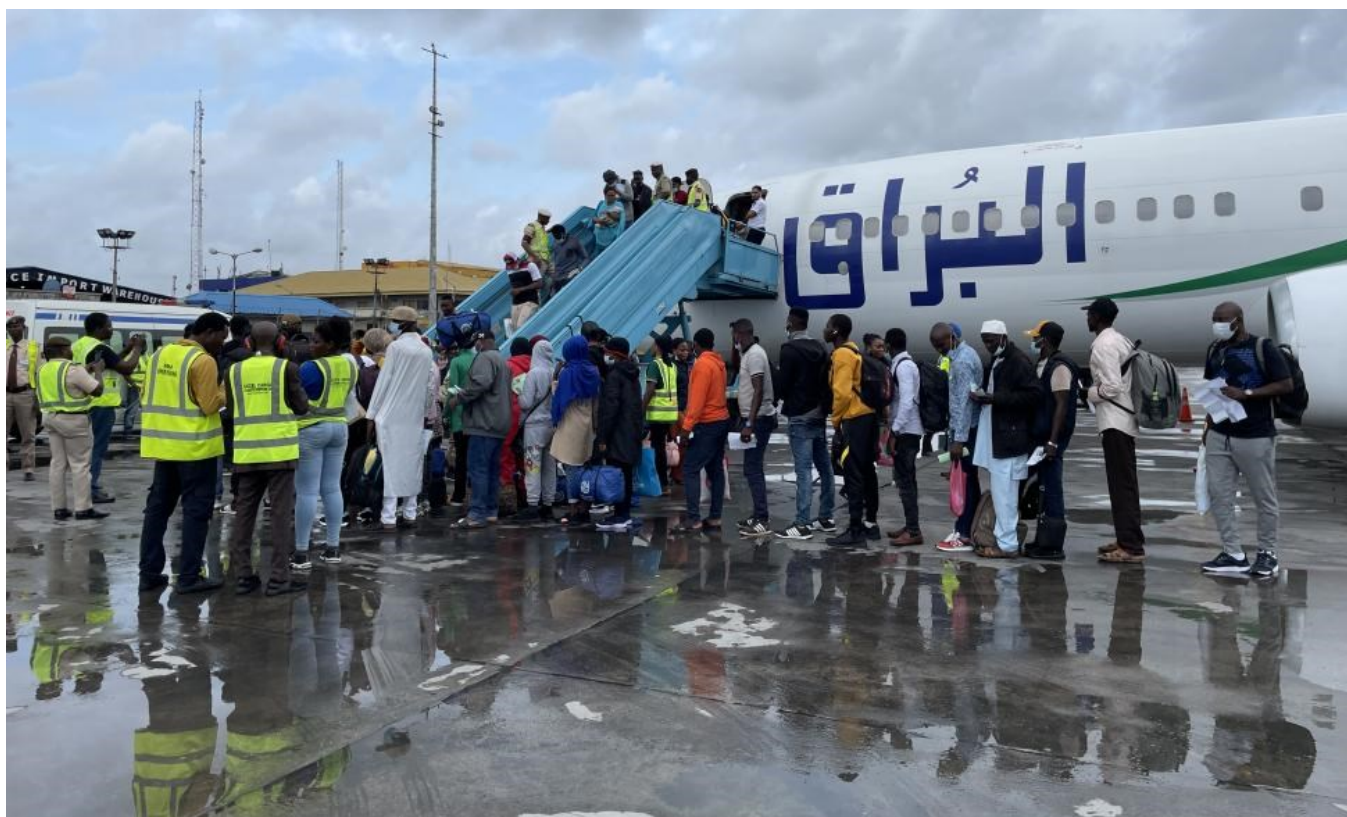
Returnees from Libya at the Murtala Muhammed International Airport - Lagos

The International Organization for Migration (IOM) has assisted the safe return of over 3,000 Nigerian migrants from Libya since January 2022. 126 Nigerians arrived today afternoon in Lagos in the 13th charter flight from Libya for this year.