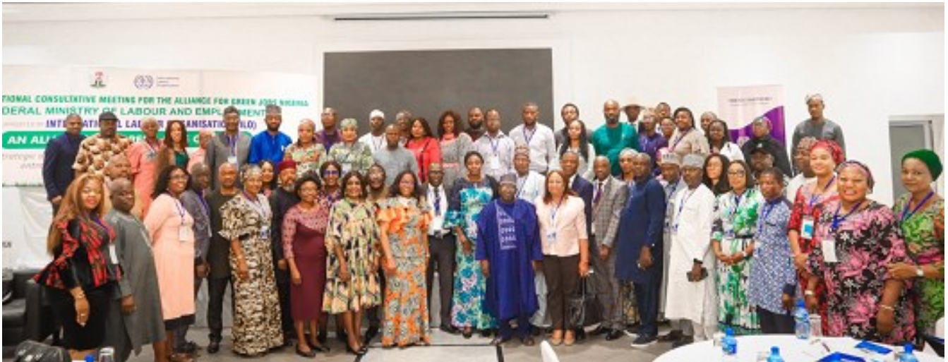
A group photograph of participants and dignitaries at the one-day national consultative meeting for the Alliance for Green Jobs Nigeria

Stakeholders in Nigeria's Labour sector have identified the creation of green jobs as a means of balancing the unemployment challenge as well as countering the effects of the ongoing climate change which has also to some extent negatively affected Nigeria.