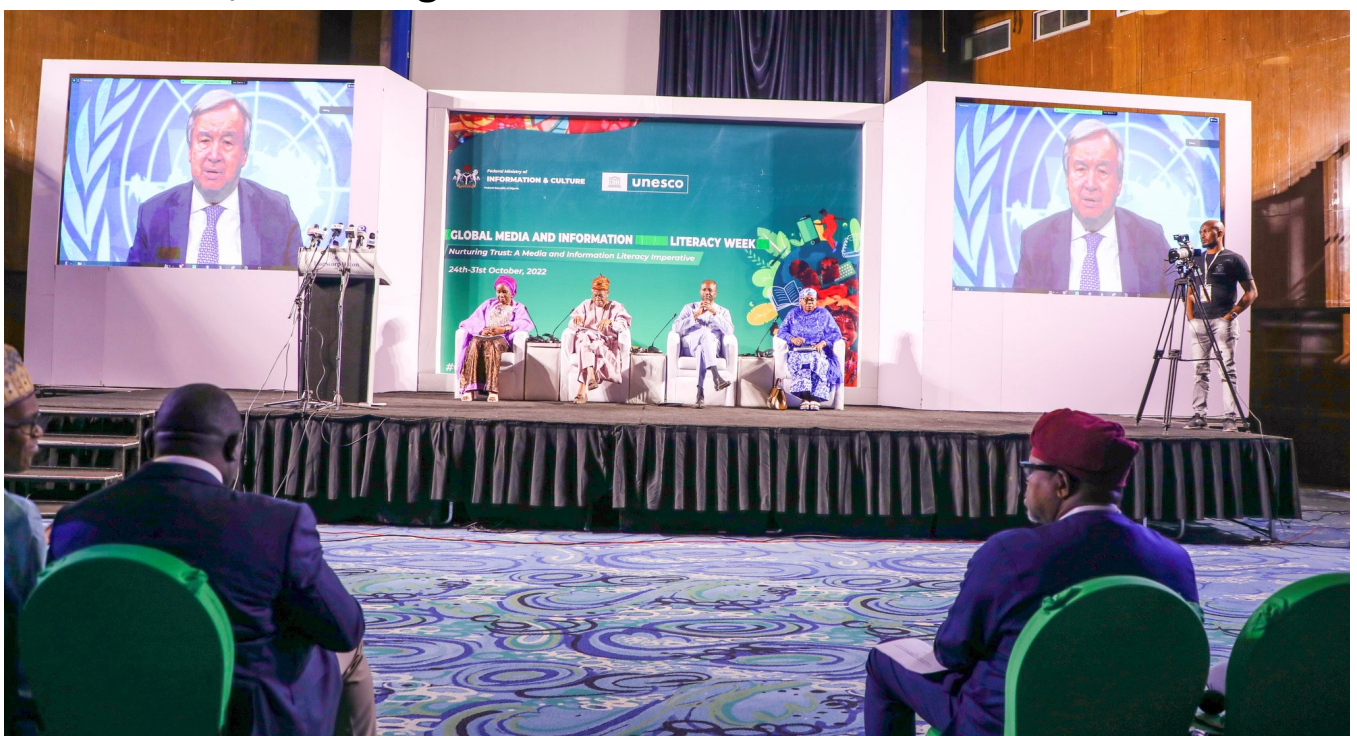
UN Secretary-General Antonio Guterres, Addressing the audience at the closing ceremony of the Global Media and Information Literacy (MIL) week titled, "Nurturing Trust: A Media and Information Literacy Imperative", and hosted by Nigeria.

United Nations Secretary-General Antonio Guterres has called on member states of the United Nations to develop media and information literacy policies that put science, knowledge and facts first.