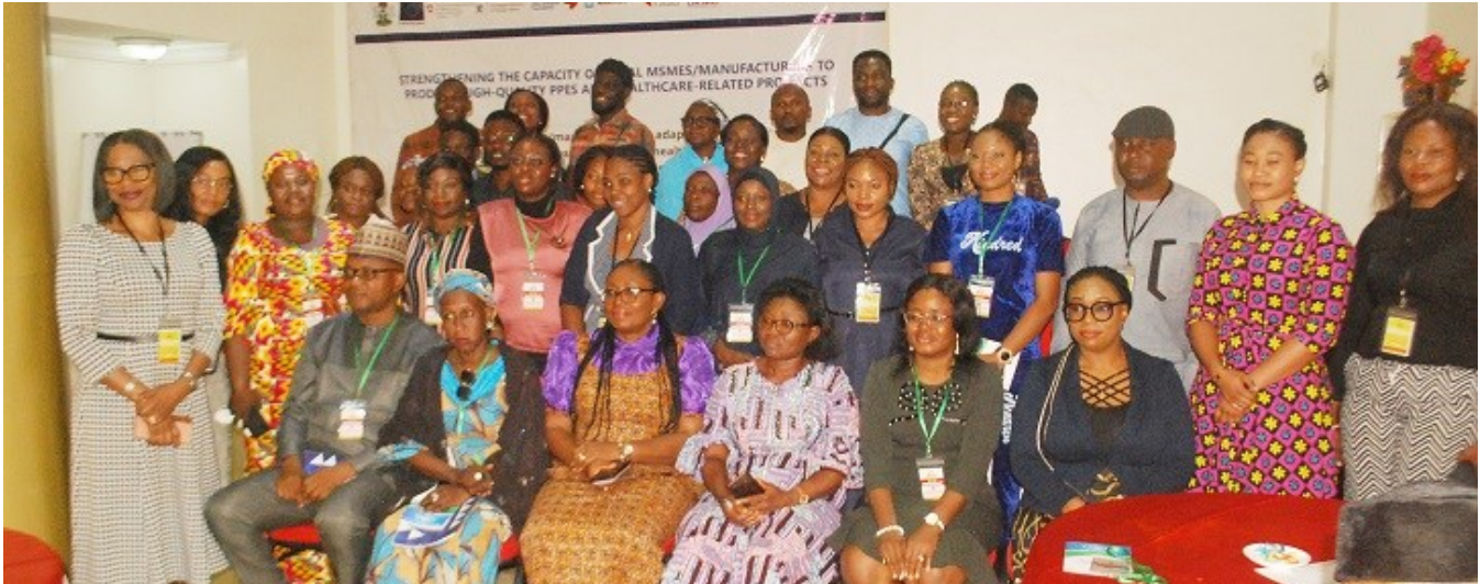
A group photograph of participants.

To support Micro Small and Medium Enterprises producing personal productive equipment in Nigeria to uphold the culture of Occupational Safety and Health in their enterprises, the International Labour Organization has supported the Federal Ministry of Labour to develop, validate and launch an Action Checklist and Training Tool kit for trainers.