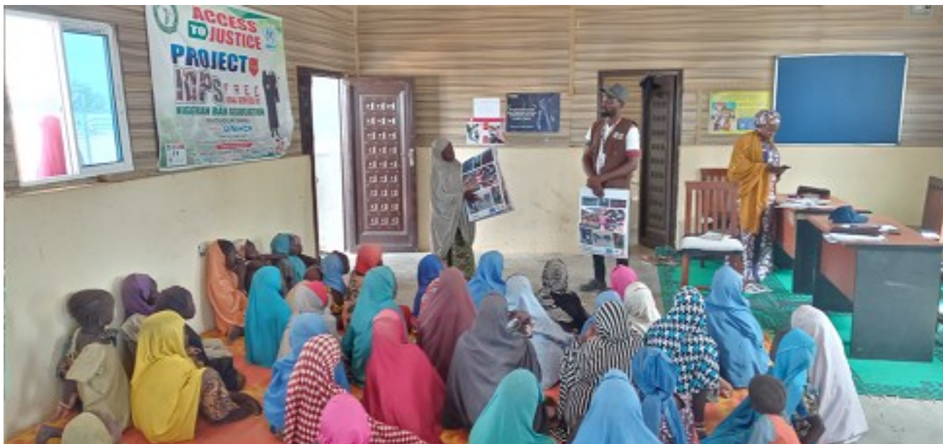
Raising awareness on the risks of improvised explosive devices (IED) and explosive remnants of war (ERW) in North-East Nigeria among young children.

UNHCR, the UN Refugee Agency, and partners are collaborating with the UN Mine Action Service (UNMAS) to improve awareness of the risks of Improvised Explosive Devices (IED) and Explosive Remnants of War (ERW) in North-East Nigeria. UNMAS is the global lead for the Mine Action Area of Responsibility (AoR) within the UNHCR-led Protection Cluster. The decision for collaboration between both organisations was taken following calls for more substantial efforts to mitigate the risks that displacement-affected communities face due to the presence of IEDs and ERW in Africa's conflict-ridden Sahel and Lake Chad Basin regions.