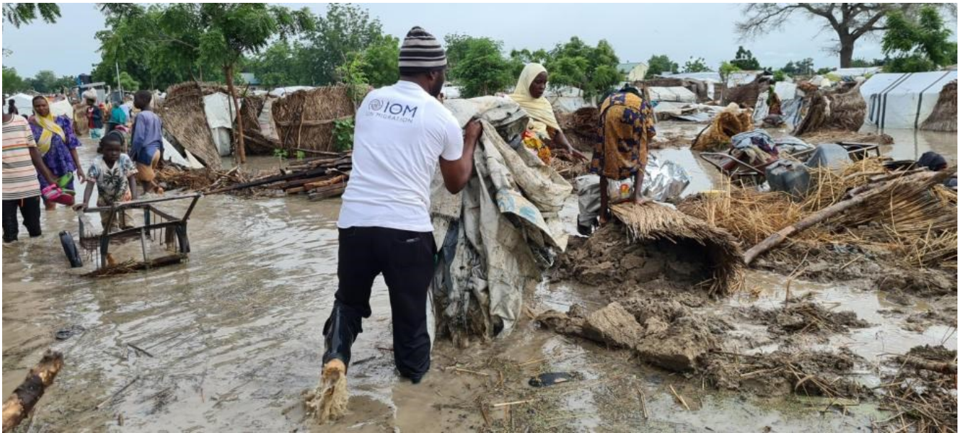
Flood site in the North-East

The International Organization for Migration (IOM) in Nigeria is providing emergency shelter and other assistance to some of the tens of thousands of people affected by ongoing deadly flooding in the northeast of the country. Over 15,000 internally displaced persons (IDPs) are in immediate need of accommodation.