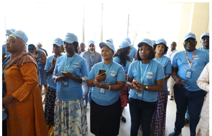
A cross section of staff members who participated in the event.

World Antimicrobial Awareness Week (WAAW) is a global campaign that is celebrated annually to improve awareness and understanding of AMR and encourage best practices among the public, One Health stakeholders and policymakers, who all play a critical role in reducing the further emergence and spread of AMR.