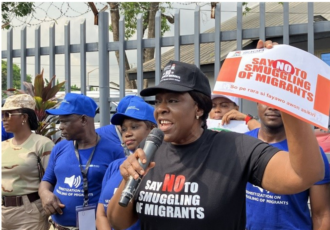
Sensitisation activity in Lagos State - Photo: IOM

IOM, the UN Agency for Migration, in partnership with the Nigerian Immigration Service (NIS) launched today (07/11) a nationwide sensitisation and enlightenment campaign on the issue of smuggling of migrants within and outside the borders of Nigeria.