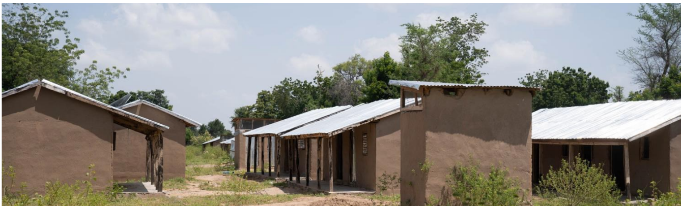
Ongoing construction of homes for 450 households, built in collaboration with displaced people and community members.