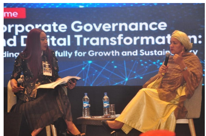
UN Deputy Secretary-General Amina J. Mohammed at the Institute of Directors 2022 Annual Director’s Conference in Lagos

At the Institute of Directors 2022 Annual Director’s Conference in Lagos, Deputy Secretary-General delivered a keynote speech and emphasised that technology and digitalization were the frontiers