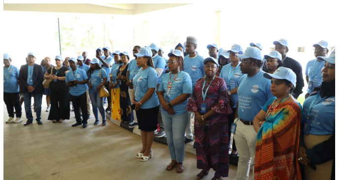
A cross section of staff members who participated in the event.