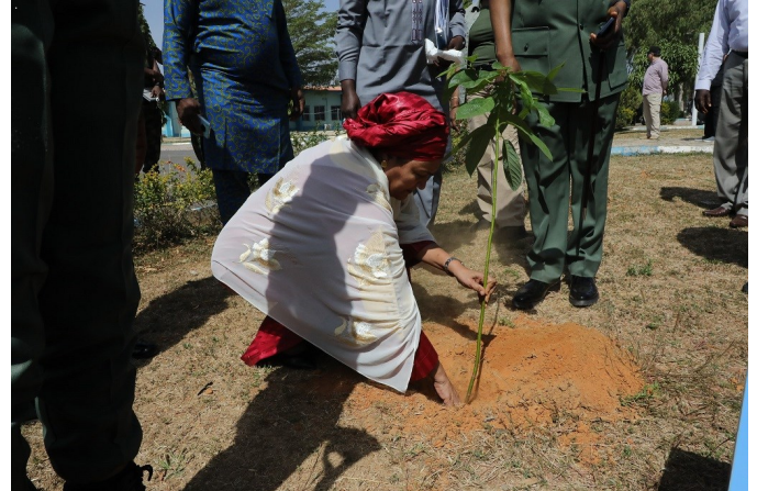
UN Deputy Secretary-General Amina J. Mohammed; plants a tree at the Martin Luther Agwai Leadership and Peacekeeping Centre, Jaji Kaduna State, North-West Nigeria.