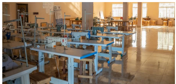
The skills-acquisition centre in Malkohi provides adult education and skills training in tailoring and farming.