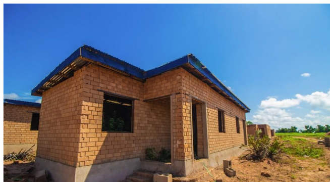
A home constructed as part of UNHCR's durable solutions project in Labondo.