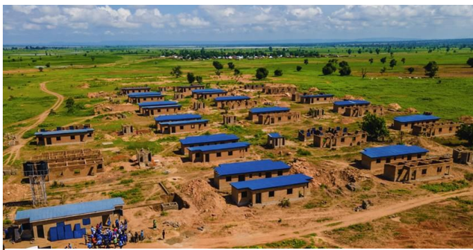
Ongoing construction of homes for 450 households, built in collaboration with displaced people and community members.