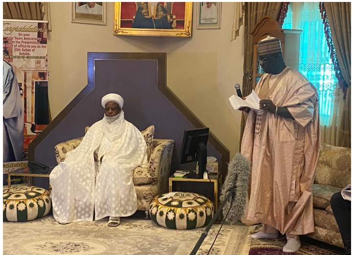
Minister of State, Budget and National Planning, Prince Clement Agbaga, addresses the Sultan of Sokoto, His Majesty, Sultan Muhammadu Sa'ad Abubakar IV.

The delegates also interacted with the surveillance group that is helping to monitor communities and ensure violence