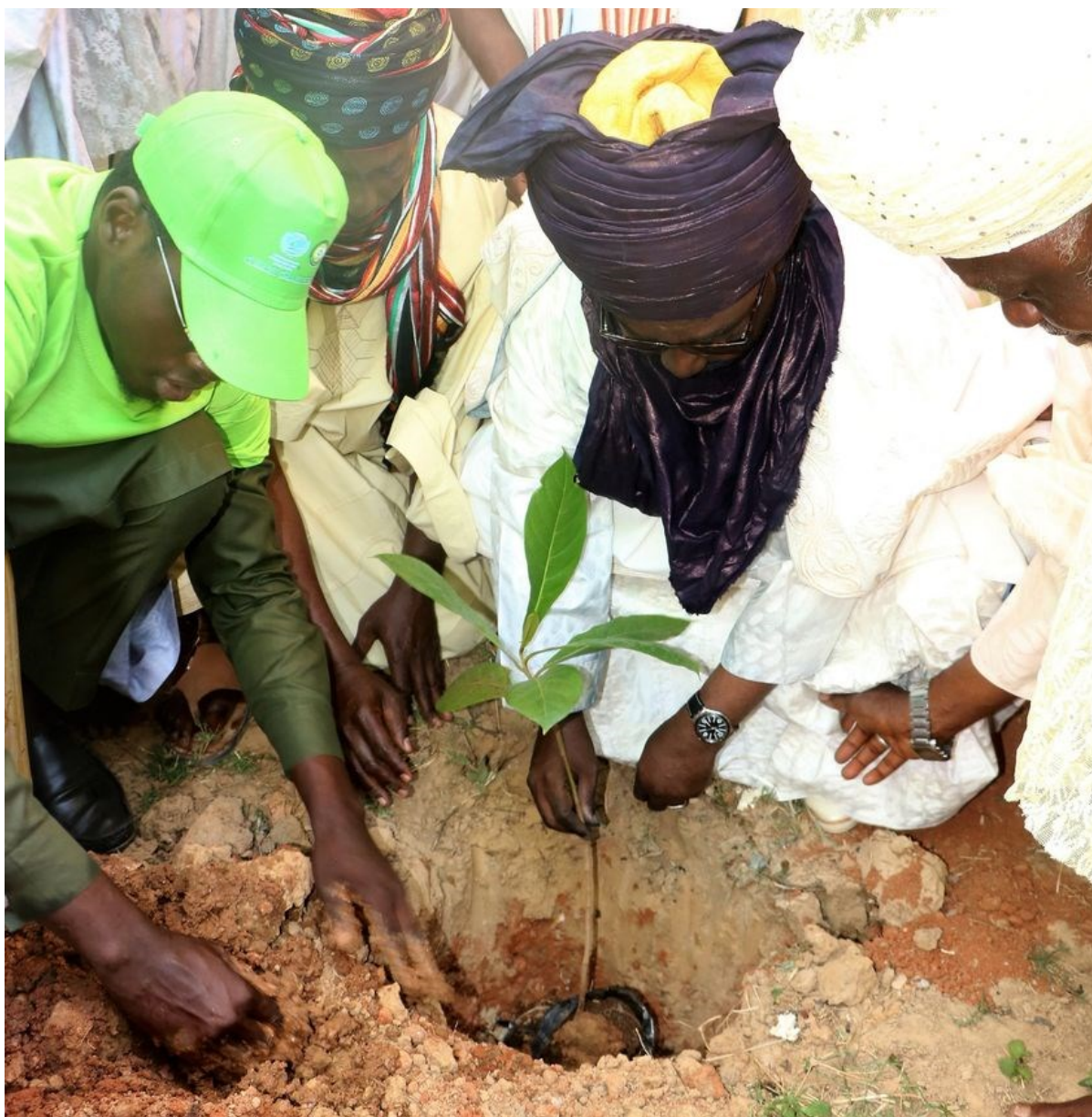
Emir of Zazzau, Zaria Kaduna State, HRH Alhaji Ahmad Nuhu Bamalli, planting an economic tree (Shea) in the palace environment.

sensitizing his people about the danger of climate change and the need to protect the environment. “The emirate will continue to partner with UNIC and AWAYE Foundation to further expand the tree planting campaign to all District areas.” He disclosed.