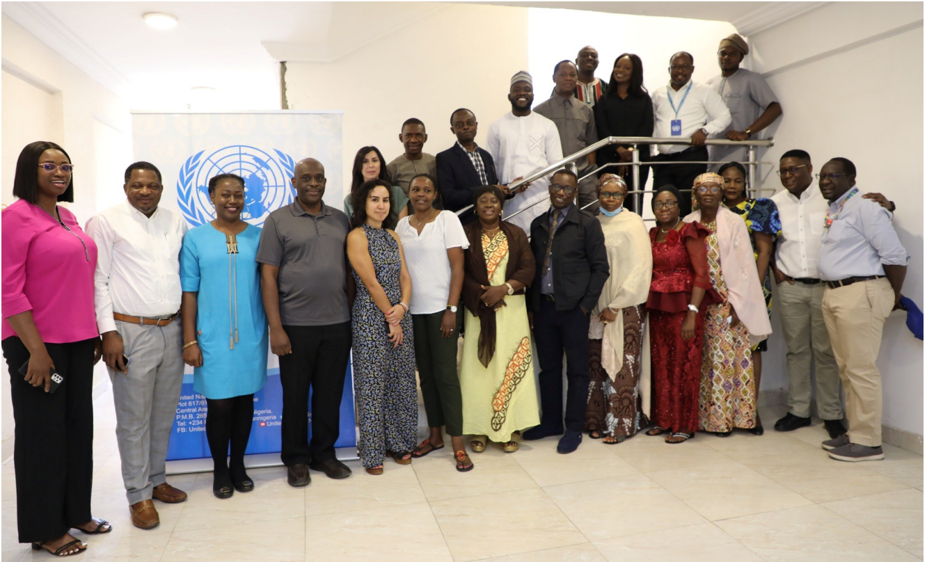
A group photograph of participants at the United Nations Communication Group (UNCG) retreat in Kano.

The United Nations Communication Group (UNCG) in Nigeria has restated its commitment to 'Deliver As One', in support of the UN Sustainable Development Cooperation Framework (UNSDCF) 2023-2027, aimed at achieving developmental objectives of ensuring inclusiveness, sustainability and accountability in Nigeria.