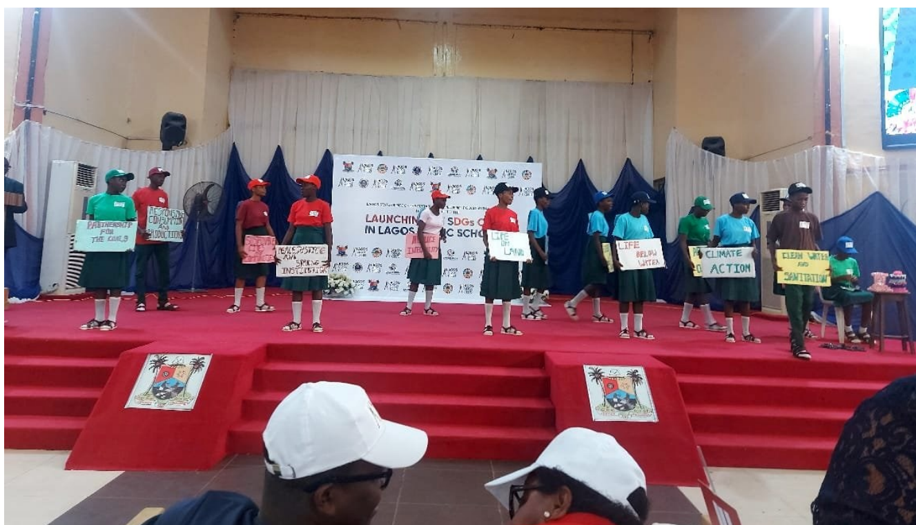
Student-participants make a presentation on SDGs

To create awareness, engage and take action to actualize the #SDGs and make our young citizens change agents, the UN Information Centre Nigeria in collaboration with the LASG Office of SDG & Investment and the Lagos State Ministry of Education has launched the #SDGs Club in Lagos State Public Schools.