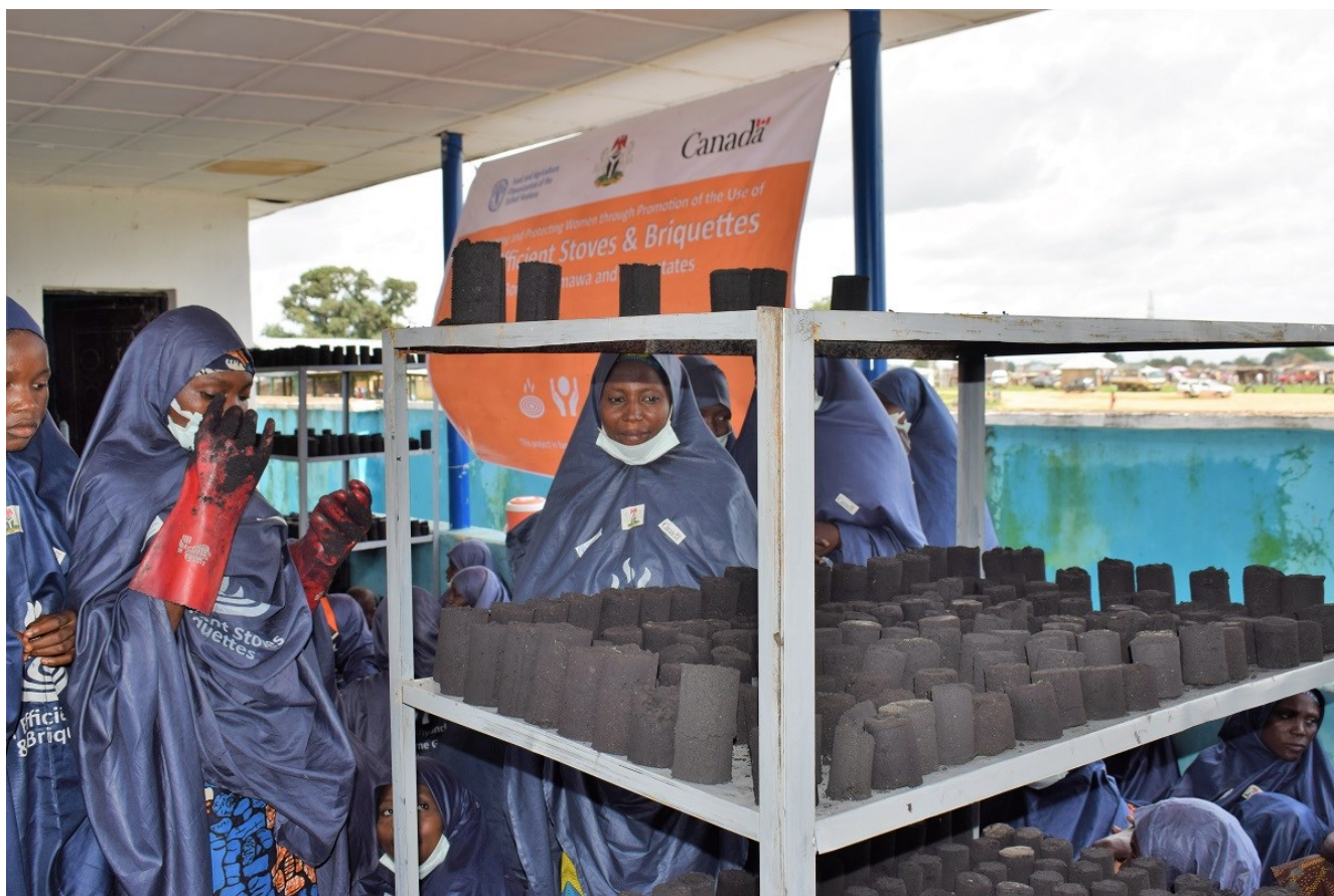
Women at a established briquettes and Fuel Efficient Stoves (FES) production center, supported by FAO and the Government of Canada.

A big pot engulfed in red-blue flames, is seated majestically atop three big stones placed in an angular position, the fire is coming from stumps of burning firewood joined together at one end, while the other end stick-out from the spaces in-between the stones. This use to be the common sight in almost every household in rural communities in Nigeria, where food is cooked for the entire family.