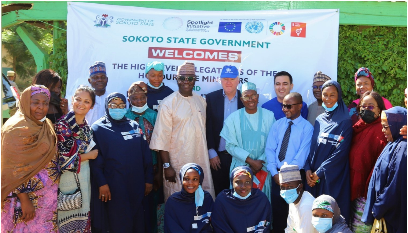
The delegation with staff of Nana Khadina Centre, during a visit to the Centre, Sokoto State.

Minister of State, Budget and National Planning, Prince Clement Agbaga, led a delegation of the government of Nigeria, the European Union and the United Nations to Sokoto State to assess the extent of work done by the EU-UN Spotlight Initiative-supported partners. The global Initiative, which is co-implemented in Nigeria by the UN Women, UN-FPA and UNESCO, is the world's largest targeted effort to end all forms of violence against women and girls; with a particular focus on domestic and family violence, sexual and gender-based violence and harmful practices, femicide, trafficking in human beings and sexual and economic (labour) exploitation.