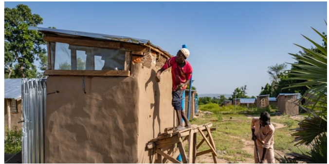
Community members help to construct a latrine.

additional structures. Recognizing that the communities hosting the displaced families face their own challenges, the project considers the host communities' needs.