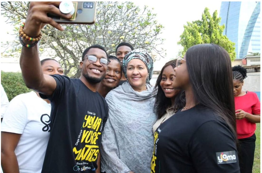
UN Deputy Secretary-General Amina J. Mohammed (Middle) takes a selfie with some young people in Lagos

"The young people of Nigeria never cease to inspire me as they rise and act for their communities each day," acknowledged Ms. Mohammed who engaged in Lagos with young people who shared their inspiring work and innovations in climate action, civic engagement and entrepreneurship. Most of all they demonstrated that UN was supporting the government and providing an enabling environment for youth to strive.