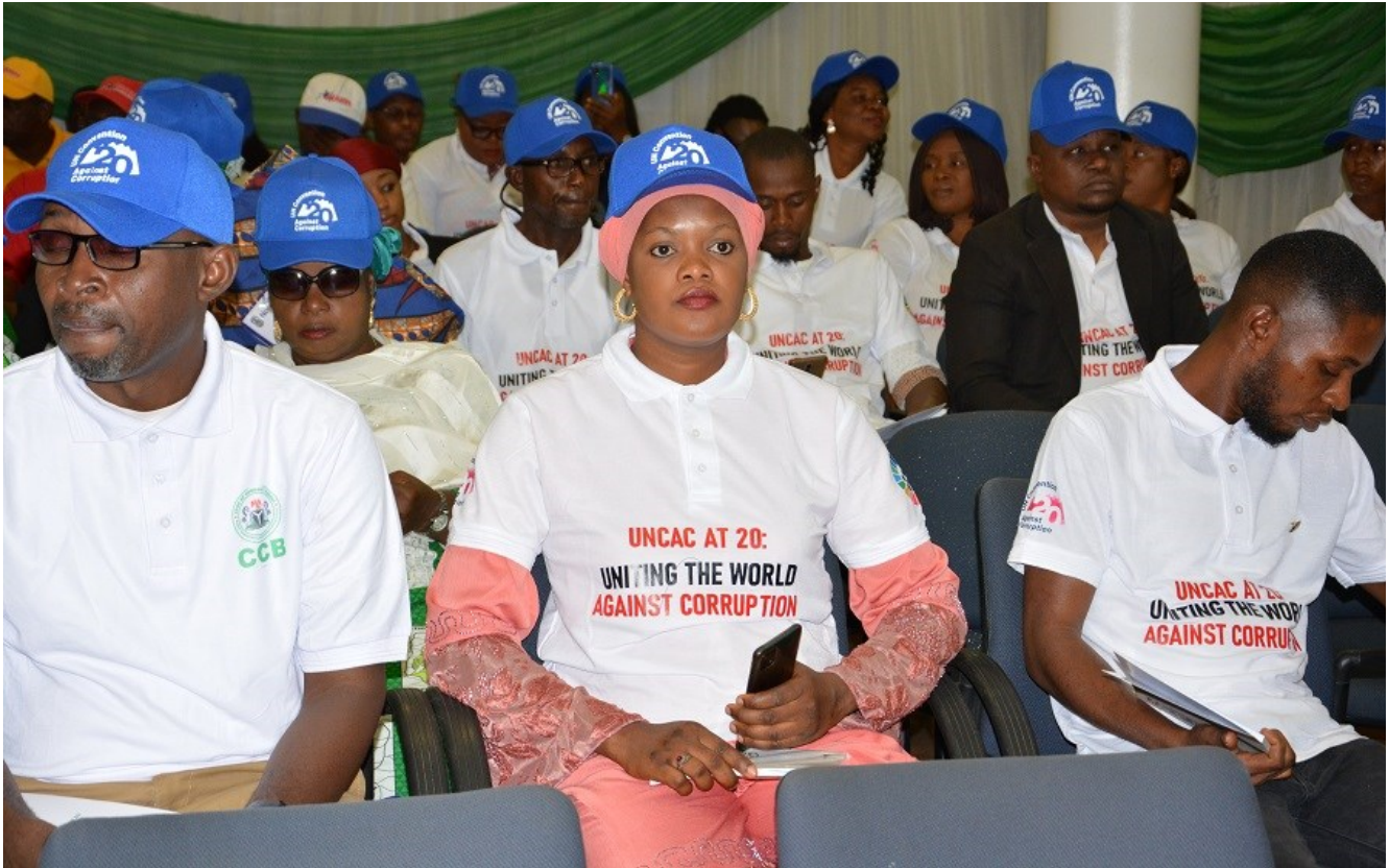
Participants during the commemoration of International Anti-Corruption Day in Nigeria

On the 9 December 2022, Nigeria commemorated International Anti-Corruption Day (IACD), a day that seeks to highlight the crucial link between anti-corruption and peace, security, and development. Under the auspices of the Inter-Agency Task Team, the coordinating forum of 21 agencies with anti-corruption and accountability mandates, over 200 representatives of anti-corruption agencies, the judiciary, CSOs, media organizations and youth came together to mark the occasion.