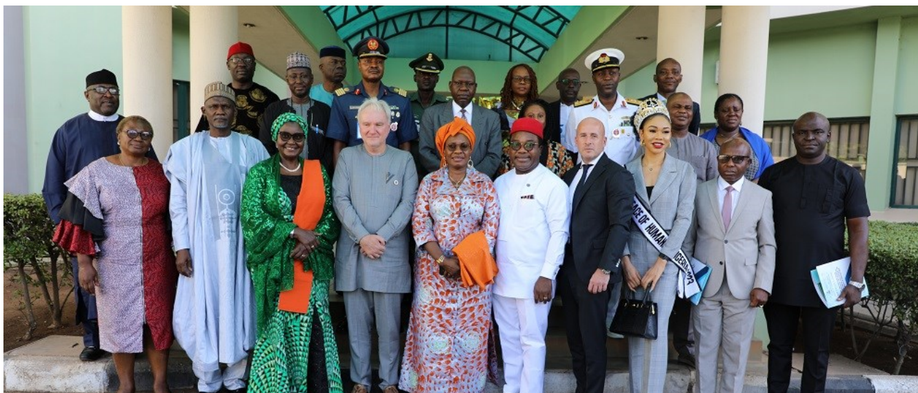
A cross-section of dignitaries at the 2nd UN-Government and Partners dialogue on human rights priorities

Minister of Women Affairs, Dame Pauline Tallen, emphasised that women issues were Human Rights issues, and therefore called on all Nigerians to sustain their advocacy against gender-based violence beyond the December 10 end date of the 16 Days of Activism Against Gender-Based Violence. "Let your voice be heard everyday of the 365 days." She charged.