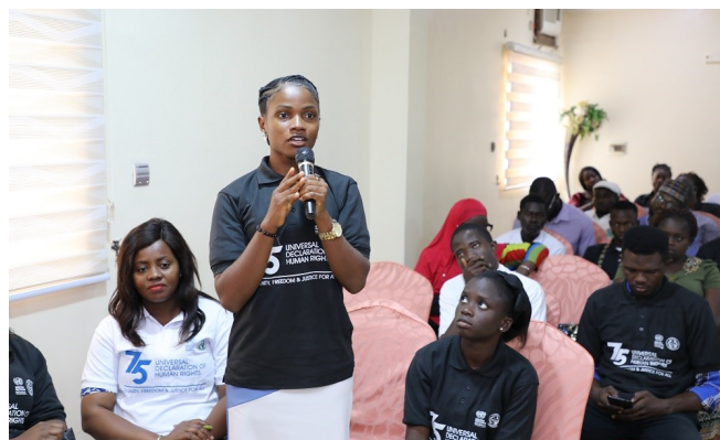
A young participant makes an intervention during the youth dialogue on human rights

The young people spoke about sensitising youth about human rights to enable them to know and stand up for their rights; they decried the violation of their right to protest using 'national security' as excuses. Issues on freedom of speech and right to infor-