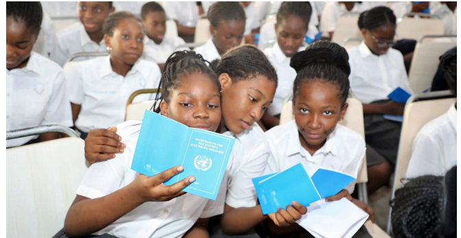
A group of students of Premiere Academy Lugbe reads copies of the Universal Declaration of Human Rights