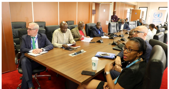
A cross-section of UN Country Team representatives at the meeting

The Ambassadors welcomed the briefing & emphasized the importance of supporting Nigeria to deal with urgent humanitarian needs, security & development.