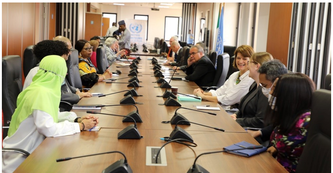
A cross-section of member states representatives at the meeting