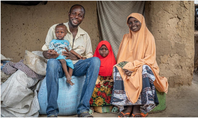
The Audu family at Bombori, Nguru LGA, Yobe State.