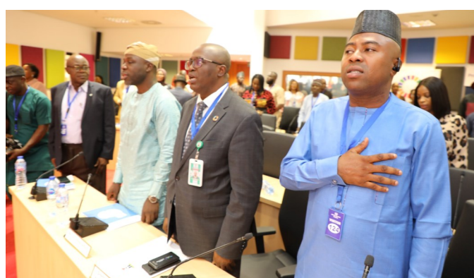
A cross-section of members of the Steering Committee at their inauguration and signing of the UNSDCF 2023-2027 in Abuja

development and humanitarian challenges, leveraging UN leadership, comparative advantages and capacity assessment."