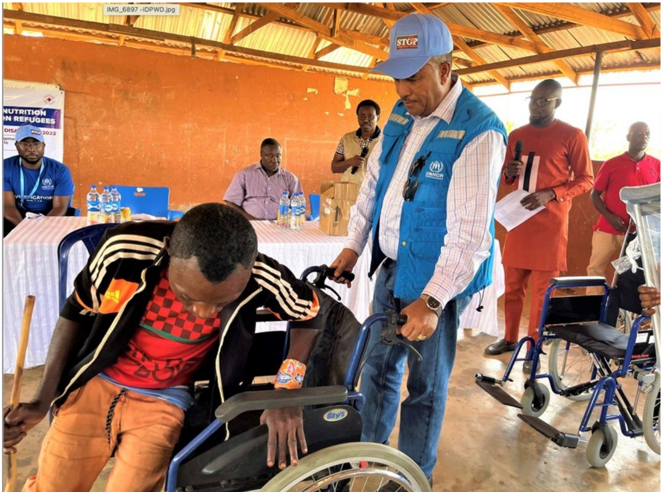
A Cameroonian refugee receives a wheelchair during the commemoration of the International day of Persons with Disabilities in the Adagom refugee settlement, Cross River State.

On the International Day of Persons with Disabilities – marked every 3 December – UNHCR, the UN Refugee Agency, refugees, security personnel, locals, and partners came together to celebrate the resilience of refugees with disabilities and to mobilize support for their dignity, rights, and well-being in Nigeria.