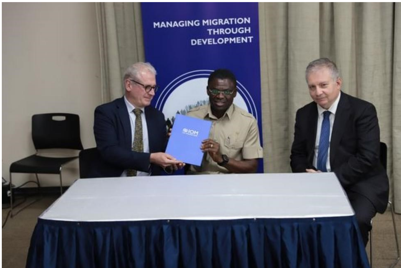
Deputy Governor of Edo State, IOM Nigeria Chief of Mission and the Ambassador of Italy to Nigeria at the Project Launch event in Benin City - Edo State.

The International Organization for Migration (IOM) in collaboration with the Edo State Government launched a new project to improve migration management through development on December 5, 2022. The 24-month project entitled “Managing Migration Through Development (MMDP) 2.0 with a focus on Edo State.” is funded by the Italian Ministry of Foreign Affairs and International Cooperation.