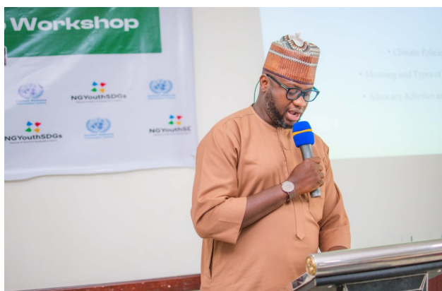
A resource person addresses participants at the workshop