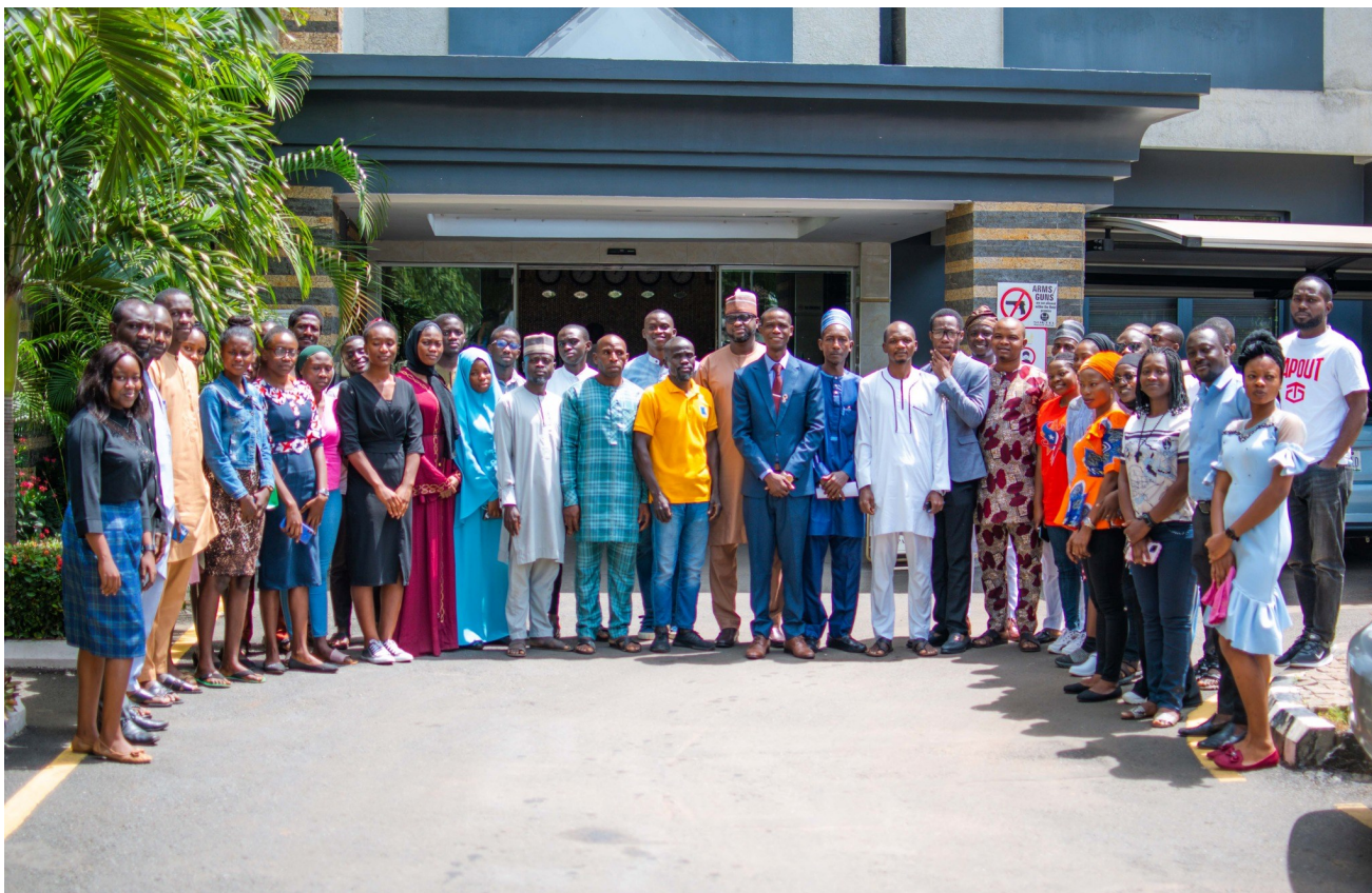
A group photograph of the resource persons and participants at the workshop in Ilorin.

The United Nations Information Centre (UNIC) in collaboration with #NGYouthSDGs held a #COP27 Youth Leadership Workshop in Kwara State to meaningfully engage youth on how to advocate for environmental issues and lead the transformational change to meet the challenges of climate change, pollution and biodiversity loss so as to upscale effective change.