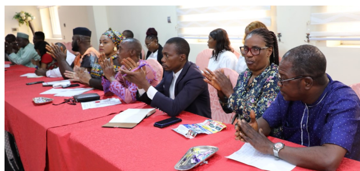
A cross-section of participants at the media roundtable on Human Rights,

At the same event, the UN and the NHRC launched a call center short code 6472 for the public to file complaints on human rights violations to the NHRC.