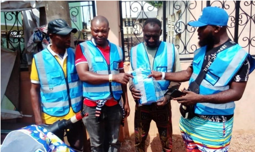
Some members of Owa-Alero community, Ika North-East, Delta State

The International Organization for Migration (IOM), in collaboration with members of the Owa-Alero community, Ika North-East, Delta launched, on 8th December 2022, a communication campaign on the risks of irregular migration and trafficking in persons, while ensuring the protection and assistance for people on the move.