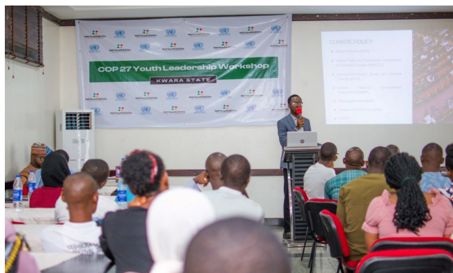
A cross-section of participants and a speaker

One of the objectives of implementing the #COP27 Youth Leadership Workshop is to provide training and capacity building to youths from Nigeria's six geopolitical zones in order for them to develop the skills and means to engage in dialogue and express their ideas on climate issues; contribute to Nigeria's NDCs and a release of a youth manifesto on Climate Change.