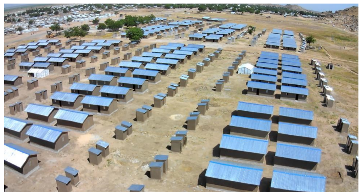
A cross-section of the modern mud brick shelters built in Gofta Community in Pulka, Gwoza Local Government Area of Borno State

Aside from shelters, the resettled population also received livelihood support and non-food items to help them kickstart a new life, in addition to the over 3,000 direct and indirect jobs created as the mud brick shelters were constructed by the local community, who are mostly from the displaced communities.