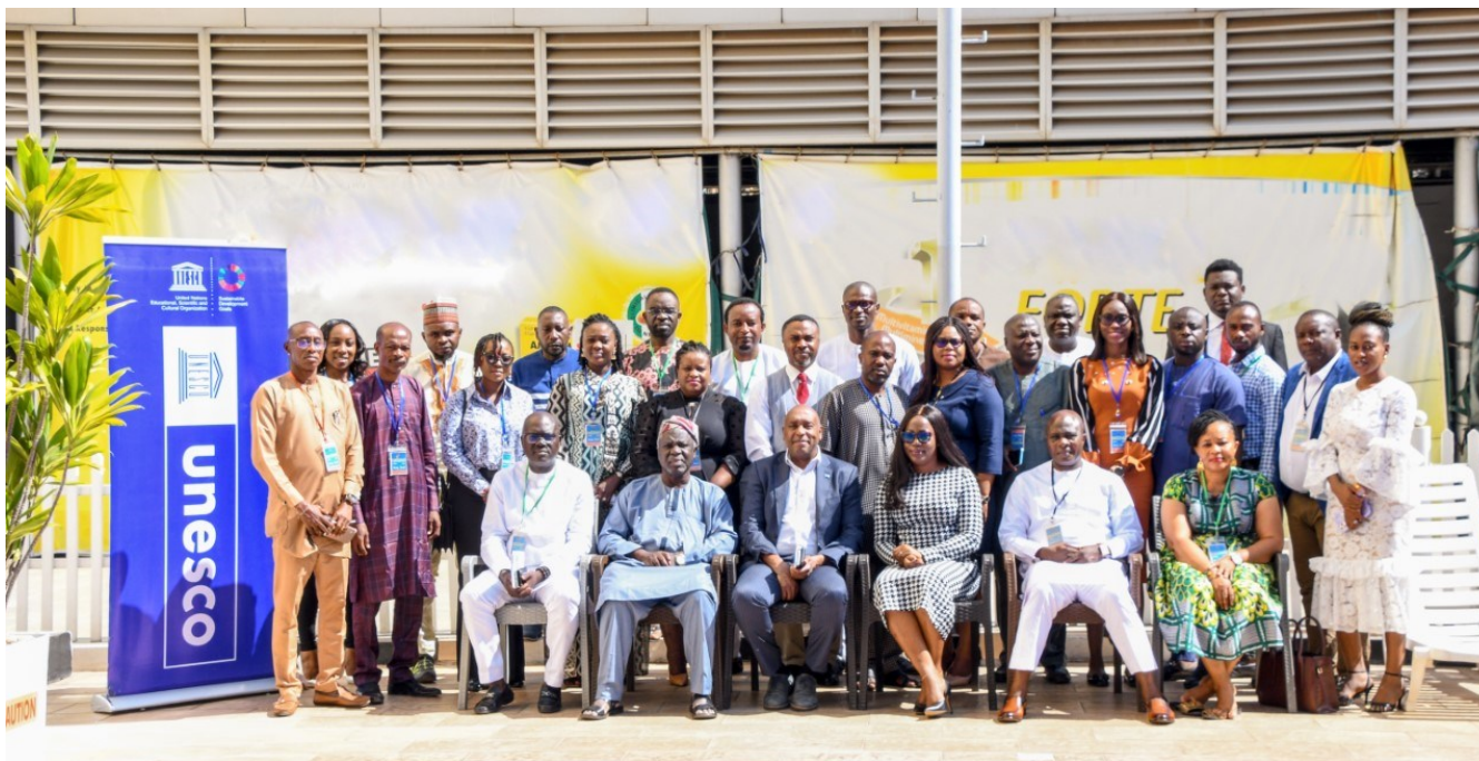
A cross-section of facilitators and participants at the workshop

As the 2023 Nigeria general election approaches, protecting freedom of expression and access to information is critical. UNESCO has a global mandate to promote the free flow of ideas by word and image. Freedom of expression, access to information and the right of political participation are deeply interlaced with democratic institutions, as when information is accurate, extensive and available, elections remain free and fair, and democracy thrives.