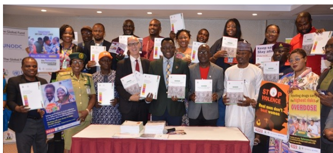
Stakeholders pose with UNODC Country Representative during the launch of the national training manuals Addressing the Specific Needs of Women Who Inject Drugs

In another event, UNODC partnered with the National Agency for the Control of AIDS in launching two national training manuals and information, education and communication (IEC) materials on