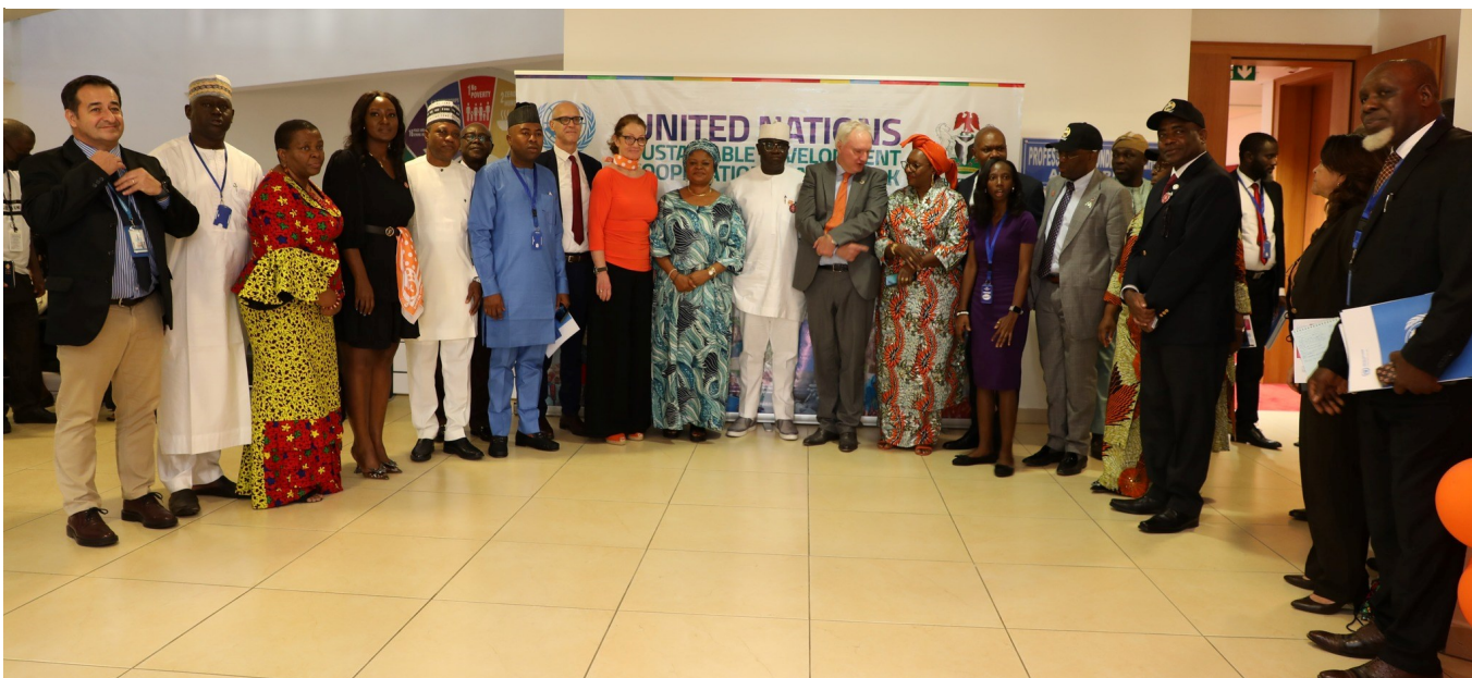
A group photograph of dignitaries and participants at the signing ceremony