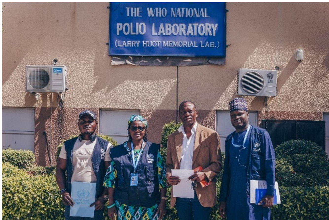
WHO officials and partners

B orno, one of the 36 States in Nigeria, has been experiencing incessant power outages since 2020, leaving some locations in the state in total darkness, due to the disruption of the power grid caused by insecurity. This has hampered operations at the polio laboratory situated at the University of Maiduguri Teaching Hospital (UMTH).