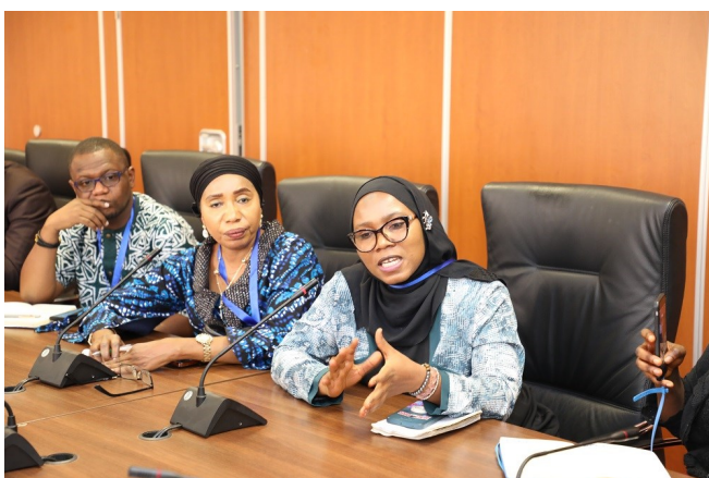
A cross-section of Civil Society representatives at the meeting