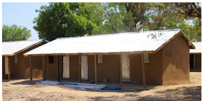
A unit of the IDPs housing projects