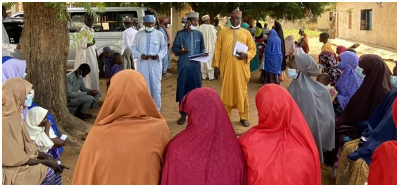
Women received a VISA card to pay for their healthcare and essential needs.

Technology for cash-based transfers is changing women's lives in Sokoto State, Nigeria.