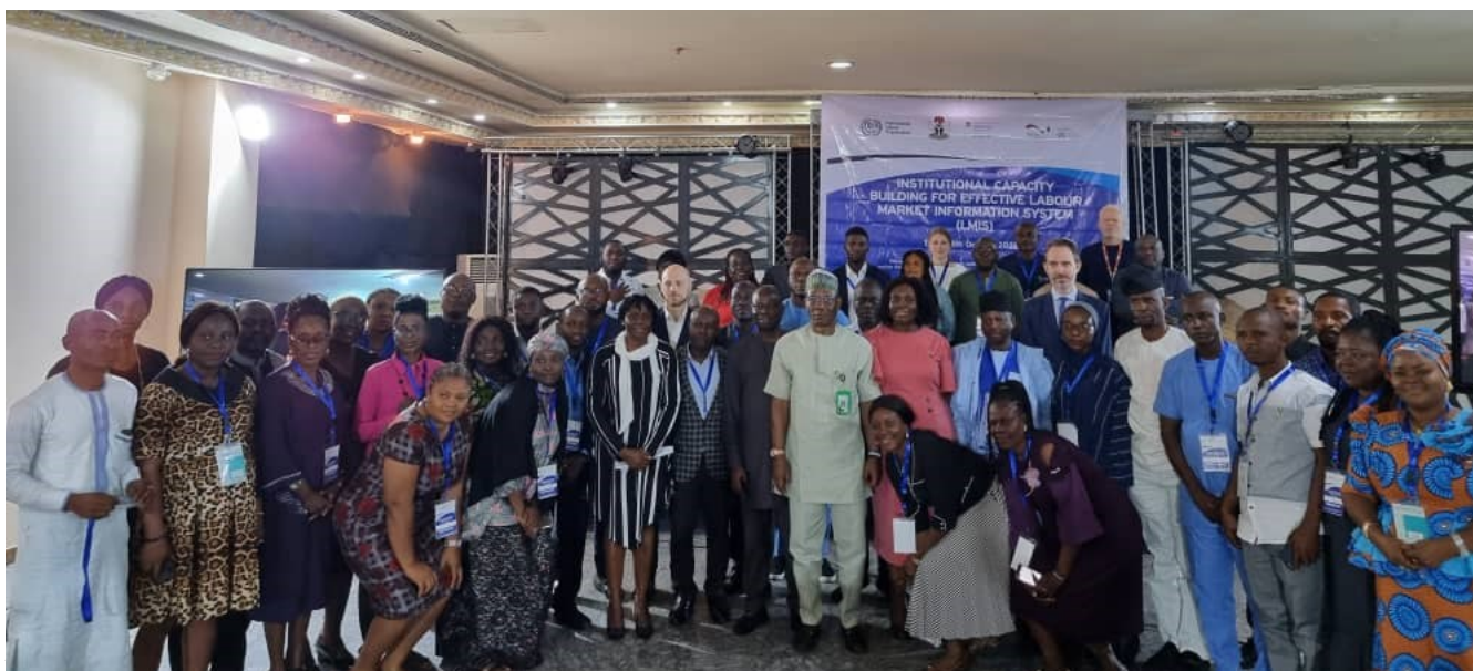
A group photograph of resource persons and participants

The Federal Ministry of Labour and Employment (FMLE) in collaboration with the International Labour Organization (ILO) convened a national stakeholders' capacity-building workshop on Labour Market Information System (LMIS) in Nigeria from 11th to 14th October 2022. The workshop aimed at providing relevant national stakeholders involved in the generation, analyses, storage and dissemination of labour market information (LMI) with sound understanding of the main functions, components, and applications of LMIS.