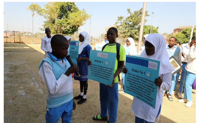
A student of Army Day Secondary School Asokoro, reads the placards displaying message of Article 1 of the Universal Declaration of Human Rights (UDHR).

In observance of the #HolocaustRemembranceDay, UN Information Centre (UNIC) Abuja, in collaboration with Seraphim Outreach, has organized an educational outreach with over 1000 students of both Army Day Secondary School Asokoro, and Command Secondary School, Lungi Barracks Maitama.