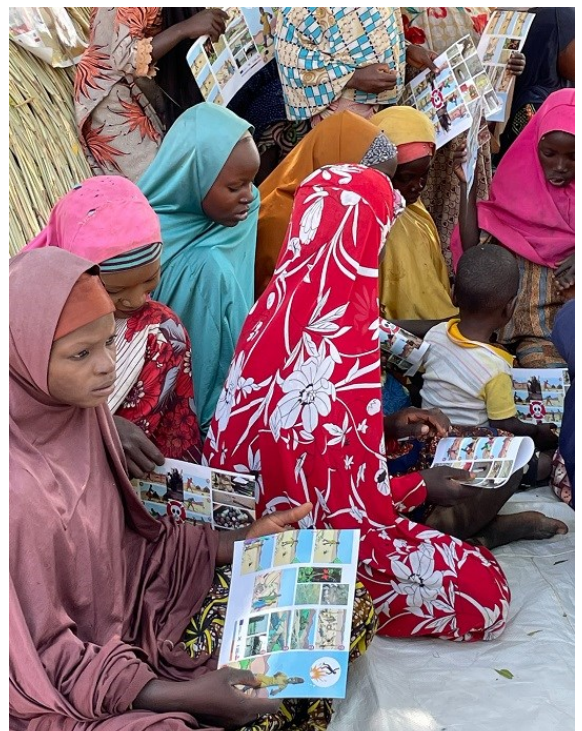
A cross-section of community members during one of the explosive ordnance risk education activities.