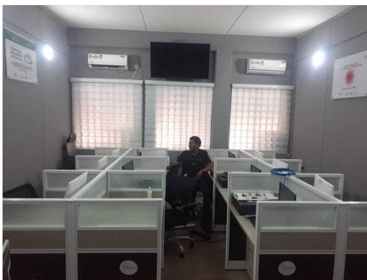
Abuja Migrant Resource Centre

The Permanent- Secretary, Federal Ministry of Labour, and Employment, while inspecting the refurbished offices, appreciated the Employment and Reintegration Programme for the refurbished offices and urged the staff of the MRCs