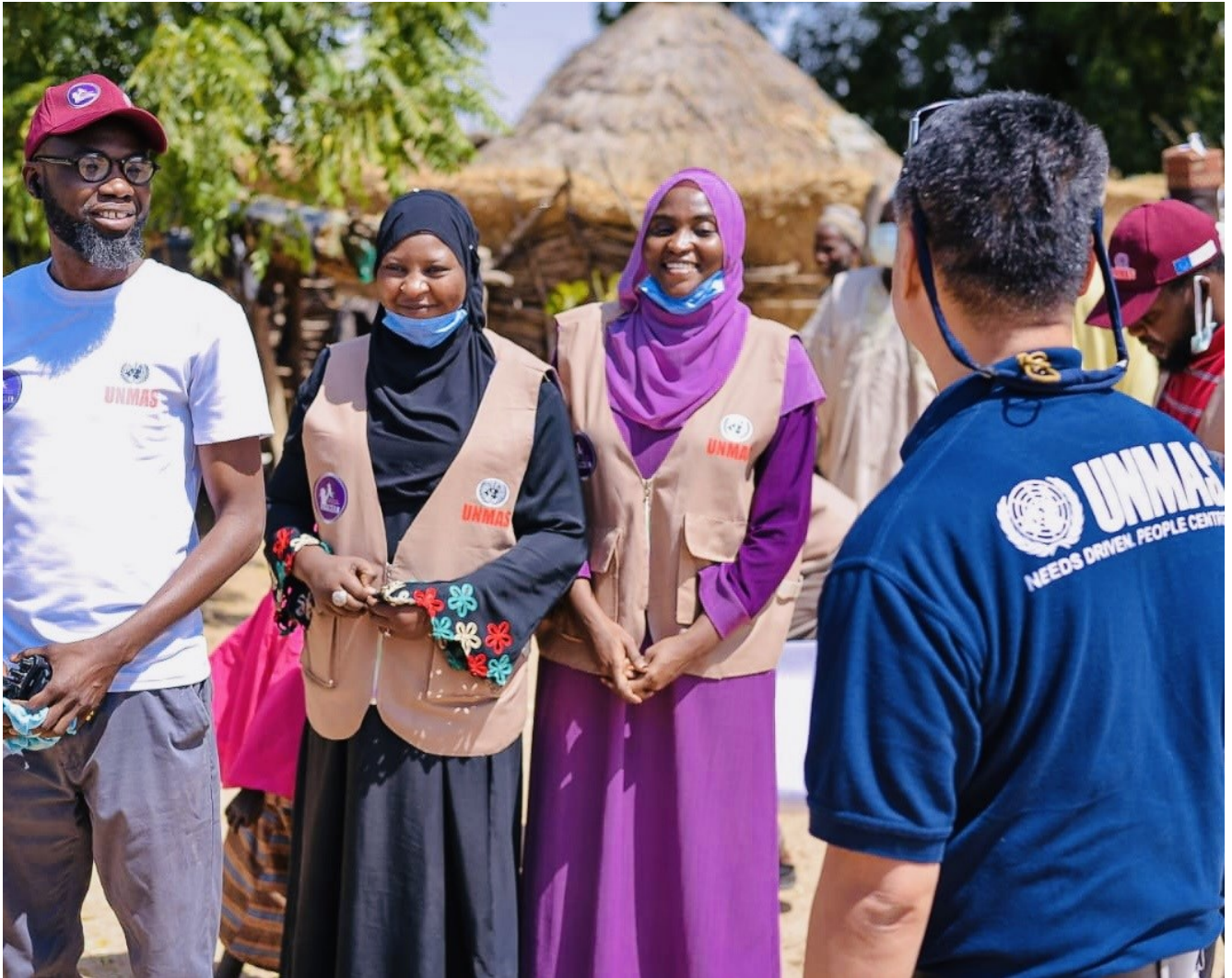
Field monitoring team for explosive ordnance risk education activities in Dumbulwa Community, Damaturu, Yobe State.

Following an explosive ordnance (EO) incident at Dumbulwa community in Damaturu, Yobe state, in November 2022, the United Nations Mine Action Services (UNMAS) in collaboration with Child Protection and Women Empowerment Initiative (CPWEI), and with funding from ECHO, has carried out a field monitoring visit for explosive ordnance risk education activities.