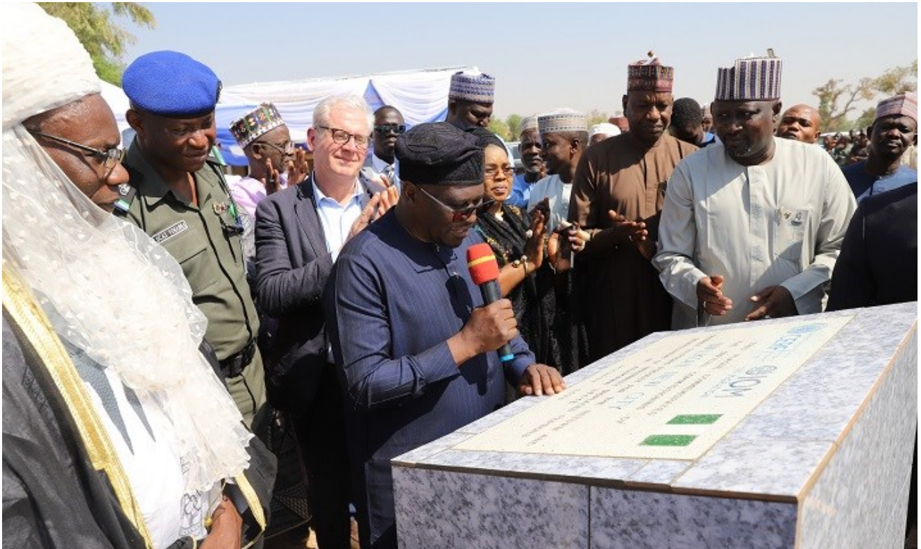
Governor of Adamawa State, Ahmadu Umaru Fintiri, commissions the housing units.

Not less than 2.2 million people are faced with displacement following the escalation of violence in northeast Nigeria since 2014. The International Organization for Migration is helping to provide durable shelter solutions to conflict-affected populations and has assisted in the resettlement of 187 displaced families through the construction of 218 housing units in Malkohi New City, Adamawa State.