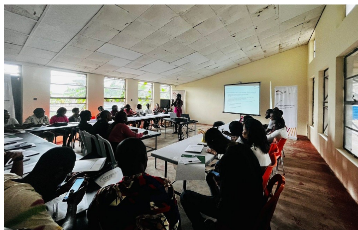
Edo Skills Training Centre