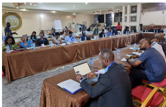
A cross-section of participants

The ILO continues to provide support to the Government of Nigeria in improving the availability and accessibility of data and statistics in the area of labour migration, including through the validation of the national report on labour migration data, in collaboration with the National Bureau of Statistics (NBS).