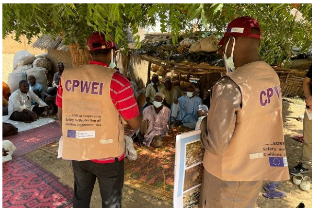
Facilitators during one of the explosive ordnance risk education activities

MAS (with funding from ECHO) support to victim assistance activities in Maiduguri, and they will follow-up on possible referrals.