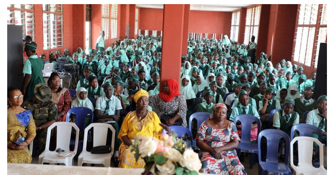
A cross-section of participants at the Holocaust Remembrance event at Command Secondary School, Lungi Barracks Maitama, Abuja.

The students were advised to stand and speak up wherever they see racism and discrimination and the need to protect everyone's