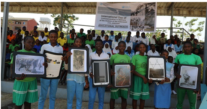
Students of Army Day Secondary School Asokoro, display the posters titled, 'Keeping the Memory Alive'.