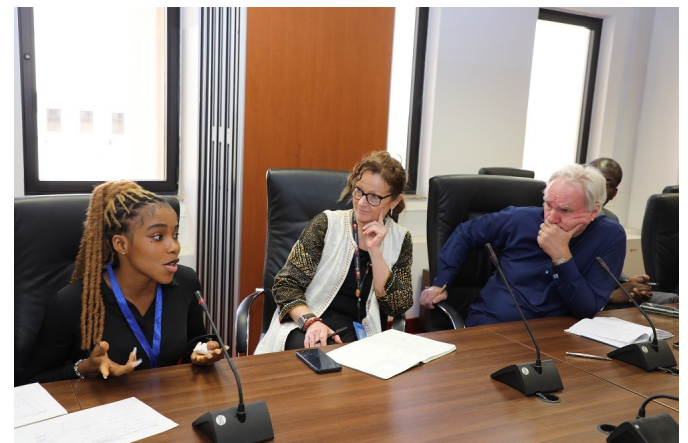
A cross-section of Civil Society representatives at the meeting