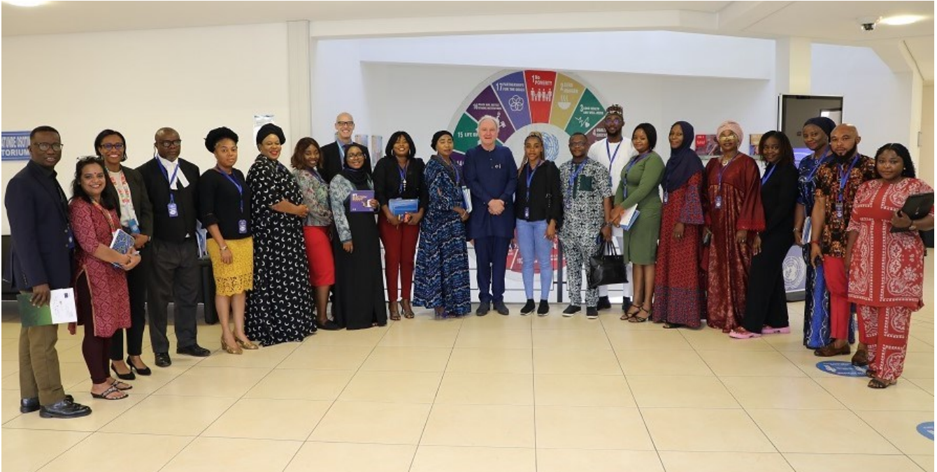
A group photograph of participants and the UN Country Team.

As part of its commitment to supporting peaceful, credible, free and fair general elections in Nigeria, the United Nations convened a meeting to listen to and discuss civil society perspectives on the ongoing general election process.