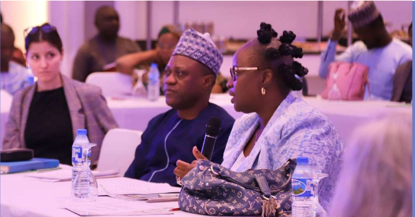
Beatrice Eyong, UN Women Representative to Nigeria and ECOWAS (r), Prince Adeyemi Adeniran, Secretary General of the National Bureau of Statistics (c), Photo: UN Women/Oluoma Ali

On the 6th of July, the National Bureau of Statistics supported by UN Women Nigeria and Women Count, marked a significant milestone with the launch of the Time-Use Survey in Nigeria. This initiative aims to collect essential data on how individuals allocate their time, providing valuable insights into socio-economic patterns, work-life balance, and gender dynamics in Nigerian society.