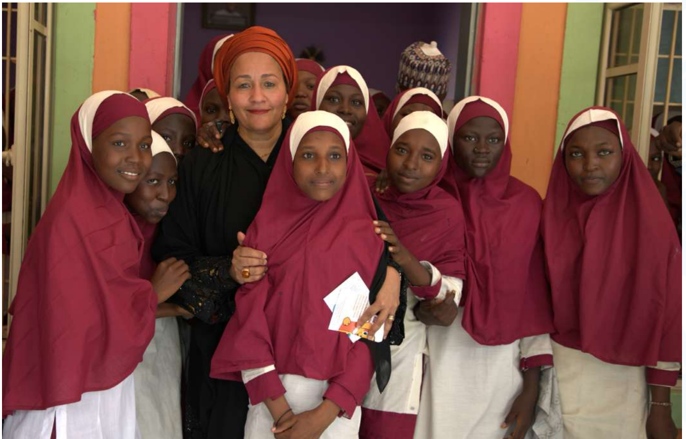
Deputy Secretary General Amina. J. Mohammed and some students of Girls Child Concern (GCC), Girls Academy Maiduguri

Today the Deputy Secretary General Amina. J. Mohammed and Nobel Peace Prize Laureate, #MalalaYousafzai join together to discuss the importance of advancing and transforming girls' education, as United Nations Nigeria celebrated #MalalaDay being her birthday at the UN house Abuja