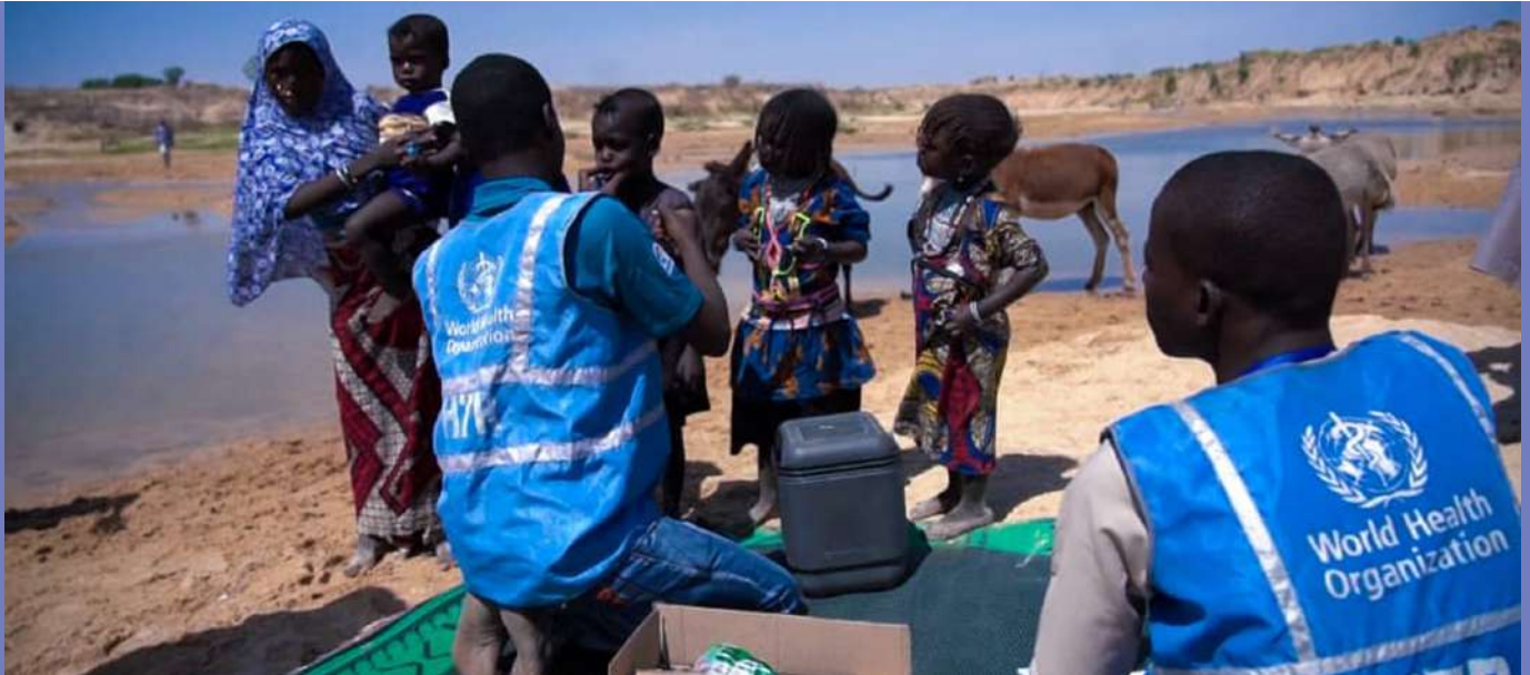
WHO mobile health teams reaching eligible children in the Nomadic settings in Borno State Nigeria.

Reaching zero-dose children requires locating and engaging the communities they belong to. Since such communities often include remote rural, urban poor, or conflict affected areas facing various forms of deprivation, cross sectoral collaboration is needed to identify and reach them.