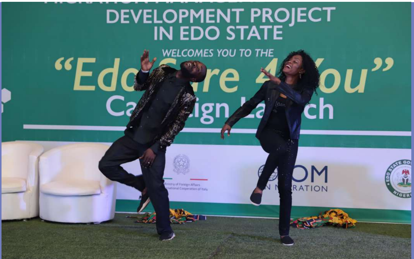
Dance performance at the official launch of the "Edo Sure 4 You" campaign.

The International Organisation for Migration (IOM), in partnership with the Edo State Government, launched a creative campaign in Benin City on 20 July 2023, targeted at providing information on the risks of irregular migration and trafficking in persons in addition to available local opportunities in Edo State.