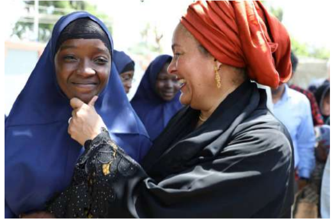
Right photo: Deputy Secretary General Amina. J. Mohammed (Right) and a student of Lafiya Sarari Foundation, Maiduguri

Malala Yousafzai and the Deputy Secretary - General Amina. J. Mohammed visited secondary schools in Borno state and met with young women, activists & educators that Malala Fund supports. They met key leaders in government whose support is vital to driving progress for girls' education across Nigeria.