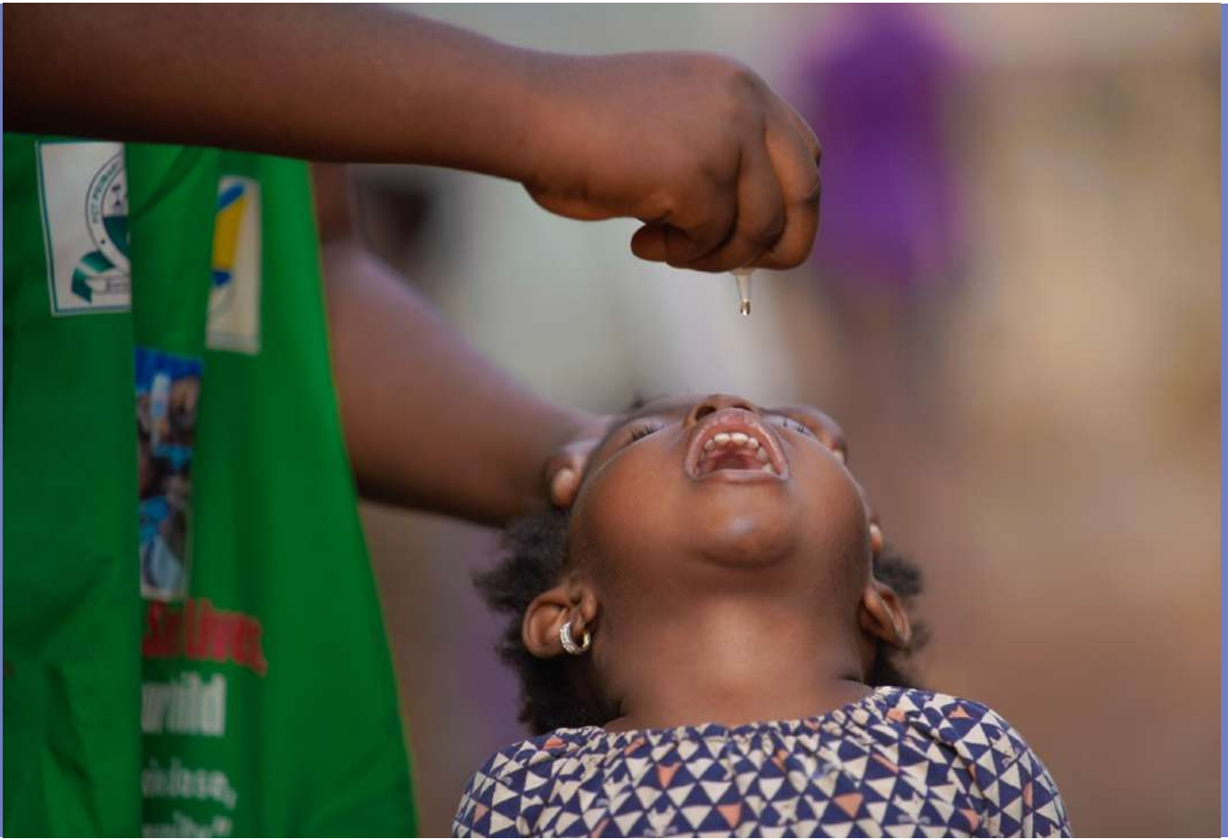
The lifesaving drop of the oral polio vaccine being administered to a child.

S DG3 GAP partners and the Government of Nigeria are committed to sustainable financing and strong primary healthcare as key accelerators of continued progress in reaching every child in Nigeria. The Government of Nigeria has shown strong political commitment and leadership in these areas, leading to active engagement, and coordinated approaches with SDG3 GAP signatories and other partners to drive important reforms. Recent reforms such as the National Health Insurance Authority Bill and the Basic Healthcare Provision Fund are being implemented nationwide to ensure financial protection and sustainable financing for primary healthcare services, including immunization. An accountability framework with state governments is also in place to secure incremental Government funding for immunization and primary healthcare, with the goal of achieving full state government funding by 2028. The presidential health reform committee has also prioritized PHC revitalization to address gaps in immunisation coverage.