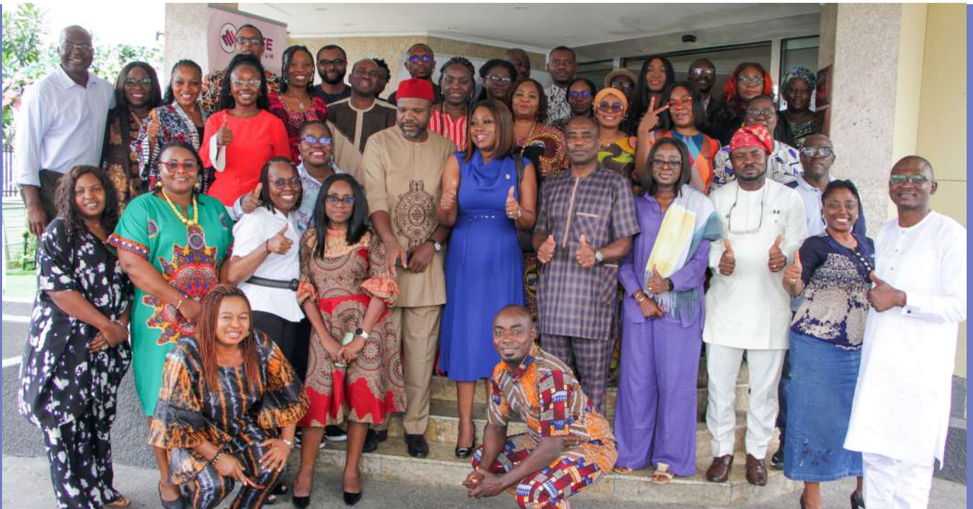
Across section of UNJNT, Donor partners, NACA, FMoH, NEPWHAN, ASWHAN, CSO's and LASACA