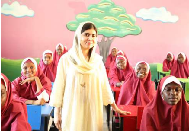
Malala Yousafzai in a group photo with some students of Yelwa Government girls Secondary School, Maiduguri