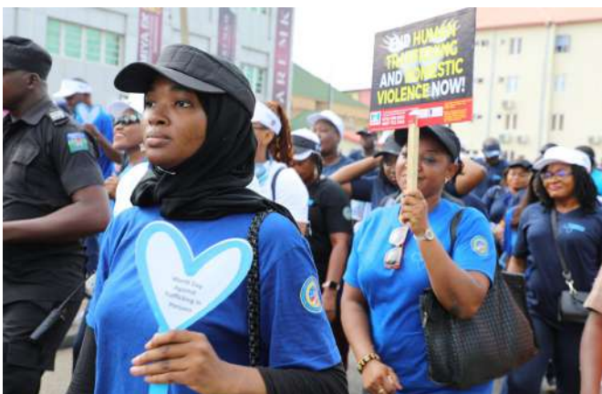
Cross section of participant at the World Day Against Trafficking In Persons sensitization walk in Abuja