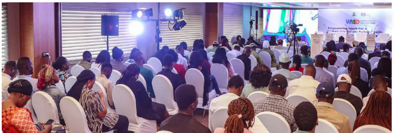
Cross-section of participants

This year's commemoration is themed: "Empowering Youth for a Sustainable Future: Building Skills for Tomorrow" #SkillsForYouth