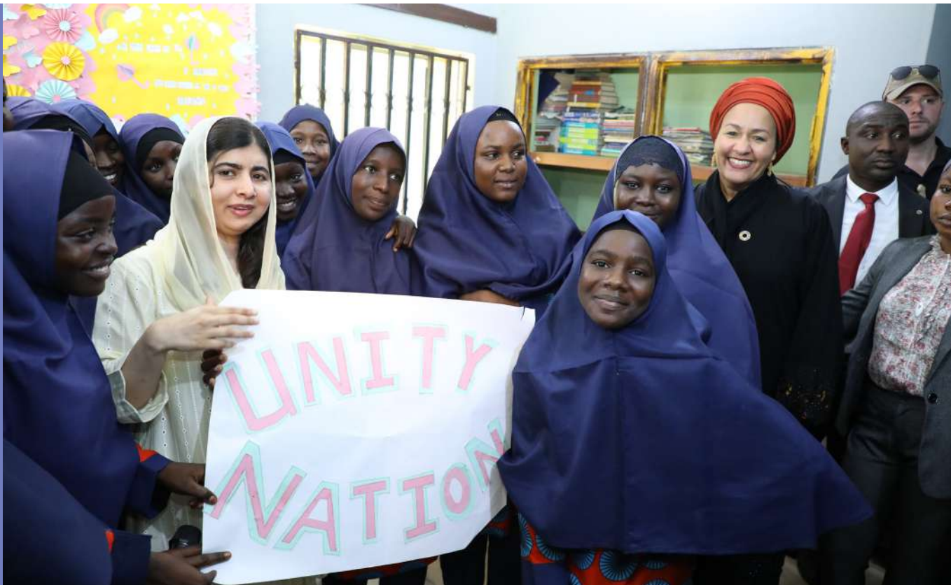
Malala Yousafzai in a group photo with some students of Lafiya Sarari Foundation, Maiduguri