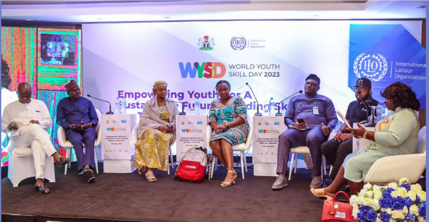
A photograph of dignitaries and speakers at the World Youth Skill Day 2023 organized by ILO

In commemoration of World Youth Skills Day, ILO ABUJA and stakeholders held a high level conversation on Empowering Youth for a Sustainable Future.