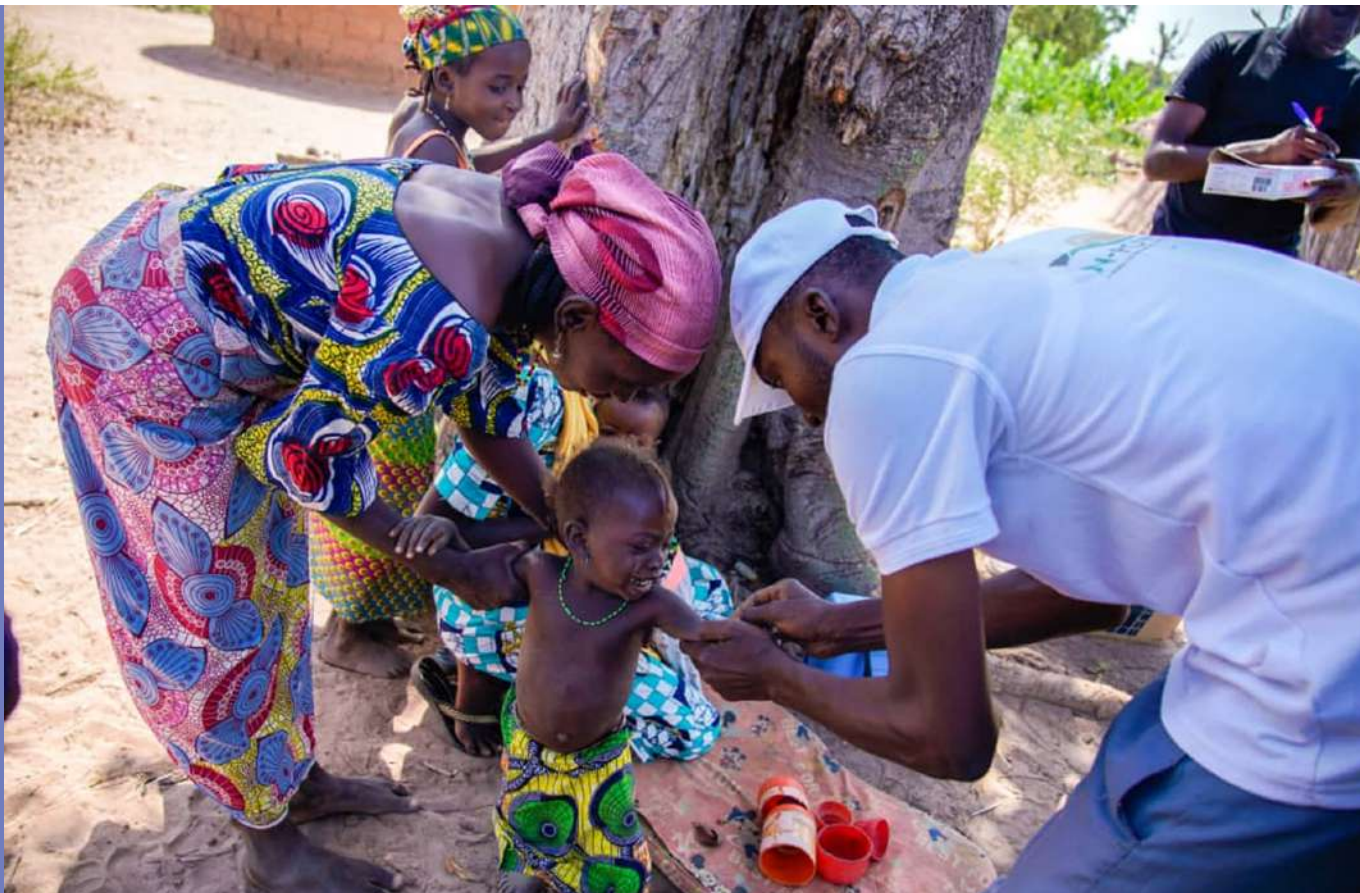
An eligible child receiving a vaccine during an immunization campaign

In their pursuit to reach zero-dose children across Nigeria, SDG3 GAP partners are leveraging their previous investments in polio eradication and COVID-19 response to expand immunization coverage nationwide.