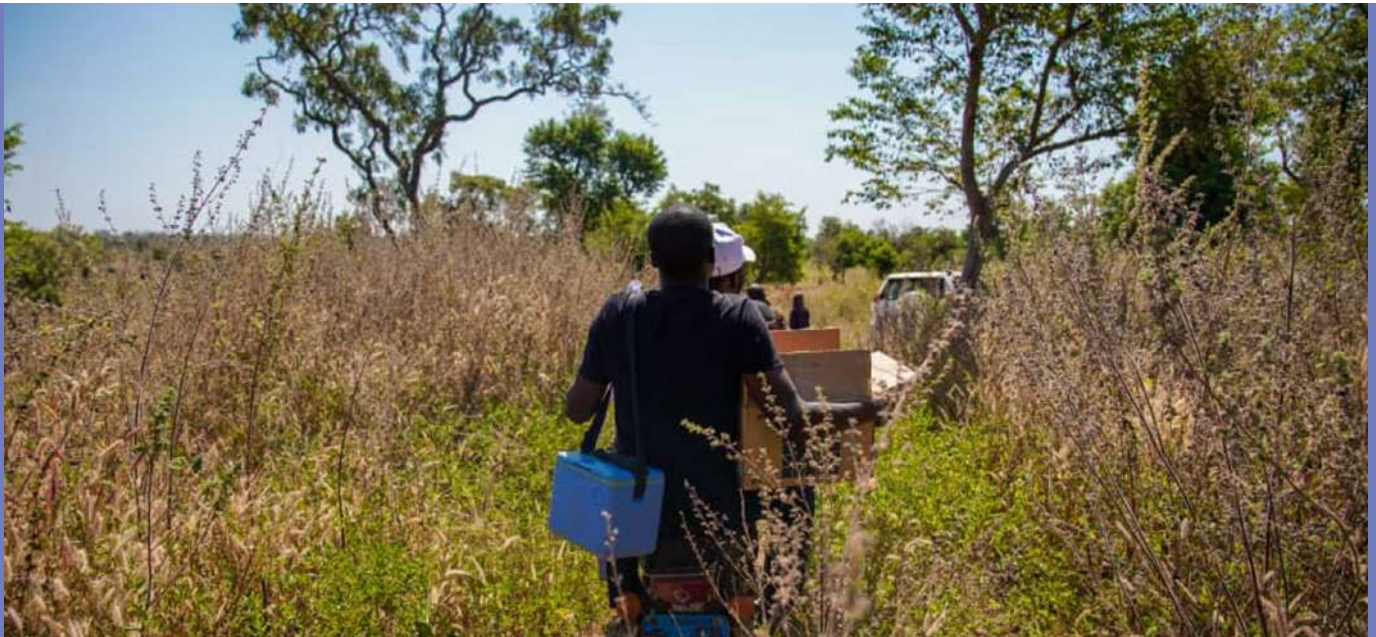
WHO supported vaccination teams going the distance to reach children in hard-to-reach areas with life-saving vaccines in an integrated immunization campaign in Niger State, Nigeria.

Immunization remains a mainstay in safeguarding children's health worldwide but achieving universal vaccination coverage has been a significant global challenge. In lower and middle-income countries, more than 12.4 million children received no vaccines in 2020. These vulnerable children, known as “zero-dose children”, account for a substantial portion of preventable deaths in children. Nigeria faces a particularly alarming situation among these countries, with over 2.2