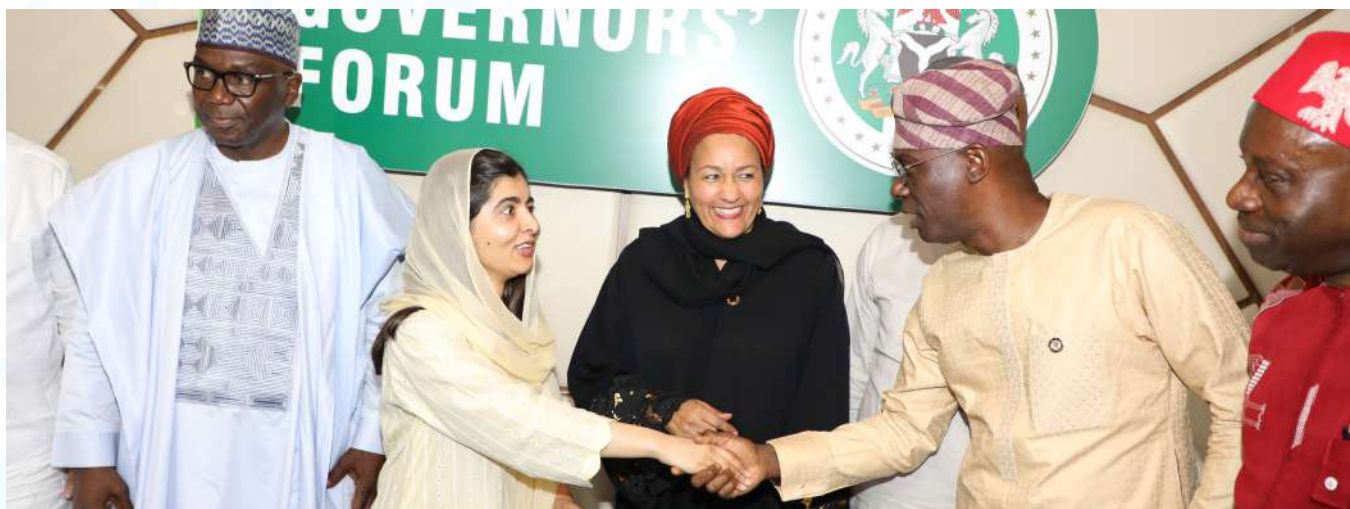
Malala Yousafzai exchanges pleasantries with Lagos State Governor, H.E. Babajide Sanwoolu at the Nigeria Governors' Forum Secretariat in Abuja after addressing the Forum.

The event focused on the transformative power of educating girls and marked a decade since Malala delivered her famed speech at the U.N. General Assembly at 16 years old.