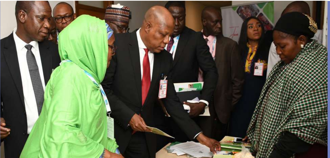
Vice President of Nigeria, Senator Kashim Shettima inspects products of FGN/IFAD Value Chain Development Programme at Nigeria's high-level event at UN Food Systems Summit in Rome, Italy

The Government of Nigeria with support from the International Fund for Agricultural Development (IFAD) held a high-level side event on Monday, 24 July 2023 at the United Nations Food Systems Summit Stocktaking Moment in Rome, Italy.