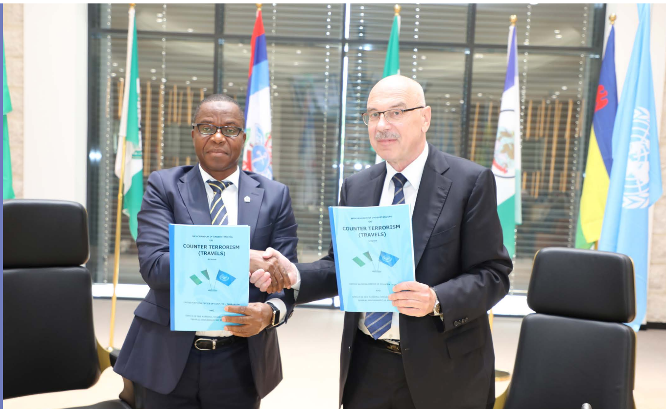
(L-R) National Coordinator, National Counter Terrorism Centre (NCTC), Rear Admiral YEM Musa (rtd); United Nations Under Secretary- General for Counter Terrorism Vladimir Voronkov displays signed MOU

“I can only mention that politically, and from the point of view of capacity building on activities for counter terrorism, Nigeria is one of the leading partners.”