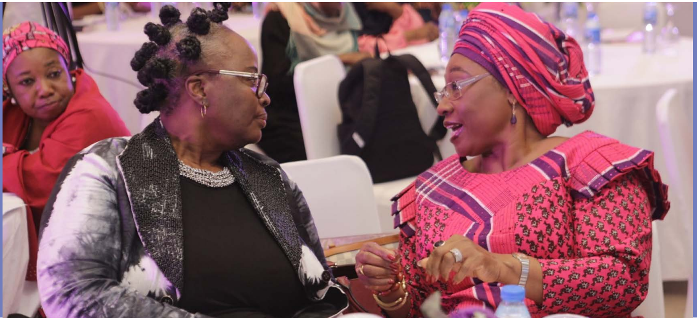
Beatrice Eyong, UN Women Representative to Nigeria and ECOWAS speaks with Erelu Bisi Fayemi, Co-Founder of African Women Development Fund and former First Lady of Ekiti State, during the event.

UN Women, in collaboration with the African Women Leaders Network (AWLN), and with support from the European Union Spotlight Initiative and the Government of Canada, convened a roundtable discussion. The purpose of this gathering was to address the pressing need to intensify collective efforts against gender-based violence while strengthening collaboration to promote women's empowerment and enhance their representation in decision-making processes.