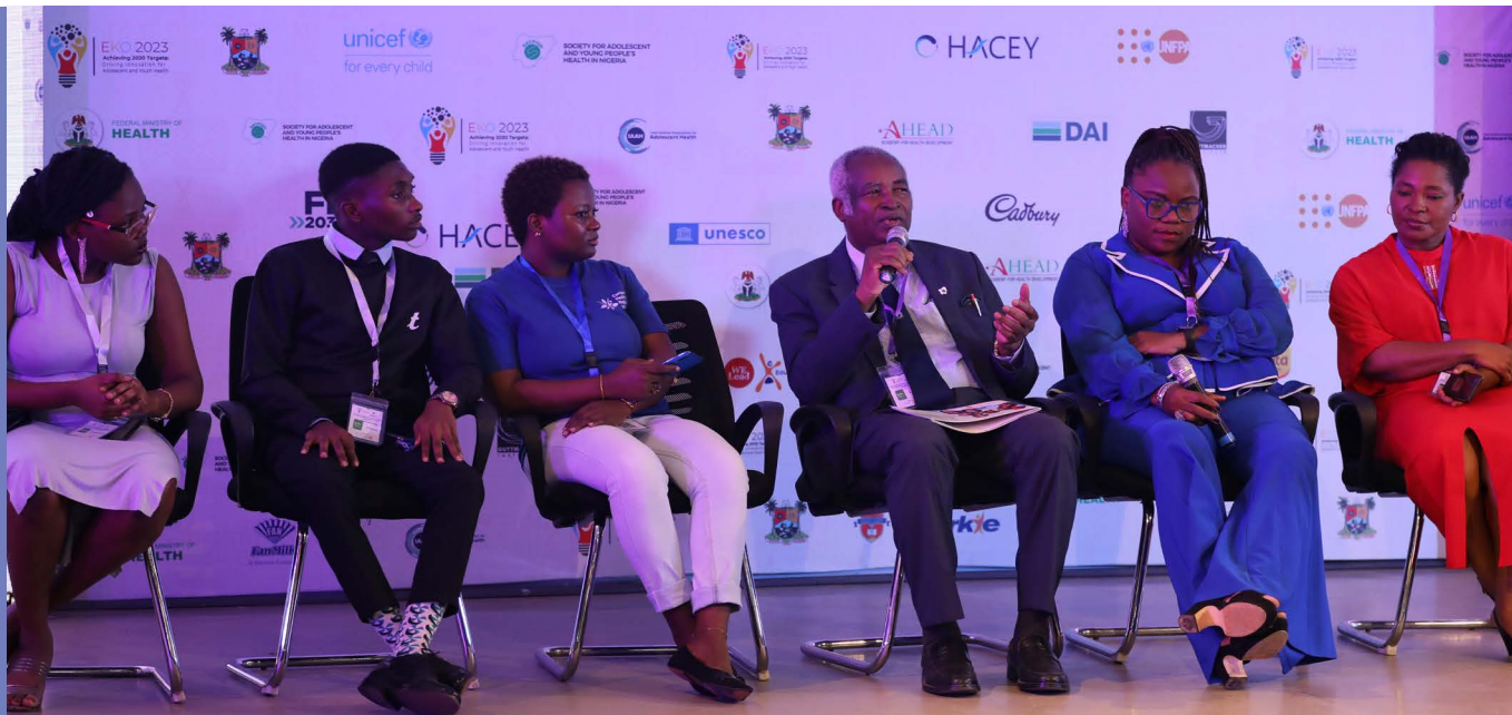
A cross-section of panelist at the conferece on Adolescent and Youth Health and Development

UN sister agencies composed of UNFPA, UNICEF and UNESCO have called for urgent youth investments and nurturing of the youth demographic via the provision of economic, social and health benefits that guarantee they have ample opportunities to attain their optimal potentials and contribute to the development of society.