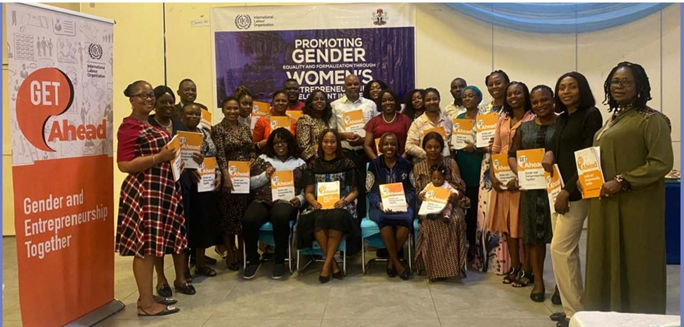
The Candidate Trainers with the Lead Trainer and ILO National Project Coordinator, Lagos Nigeria