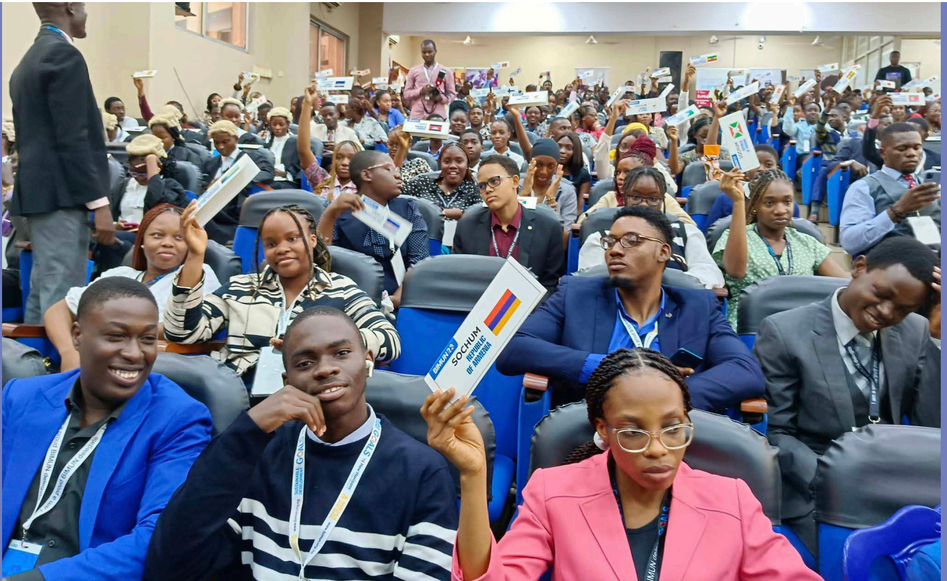
A cross-section of delegate at BIMUN