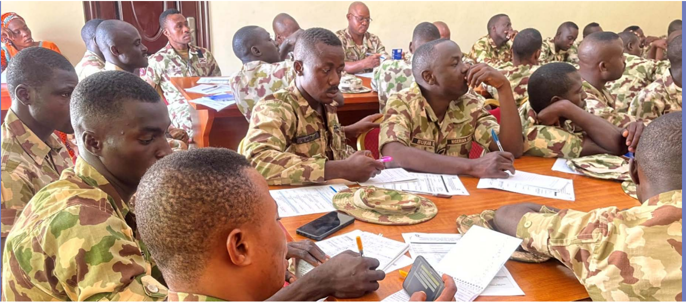
Government security forces receiving training on civilian protection and mainstreaming human rights in North-East Nigeria.

United Nations High Commissioner for Refugees (UNHCR) and the Nigerian National Human Rights Commission (NHRC) conducted a two-day training program in Maiduguri, the capital of Borno State, to develop the capacity of over forty Nigerian security personnel on the importance of integrating human rights and safeguarding the civilian population while combating Non-State Armed Groups (NSAGs) as part of their ongoing efforts to combat insurgency in North-East Nigeria. The training, which took place on August 23-24, 2023, aimed at ensuring that the participants were better equipped to protect the rights of civilians.