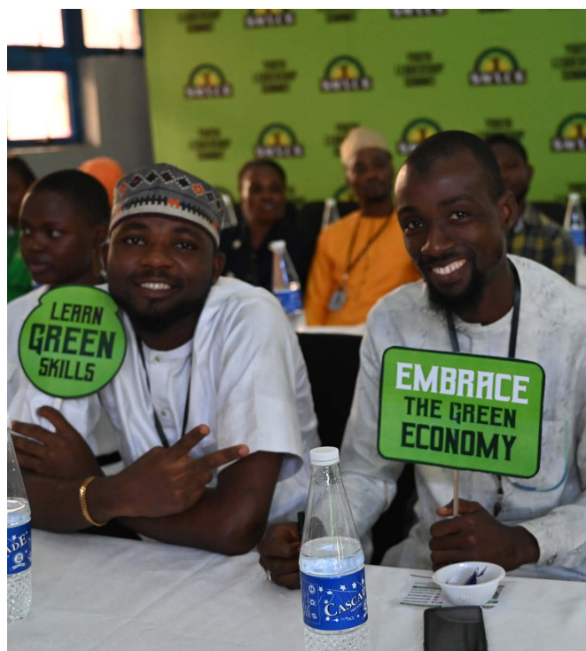
Participants at the observance of the 2023 International Youth Day in Lagos

He noted that the demand for those skills is exceeding the supply. "And the UN foresees a major skills gap with 60% of young people lacking the necessary green skills by 2030."