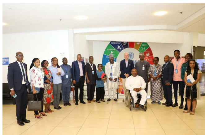
A group photograph of participants at the meeting