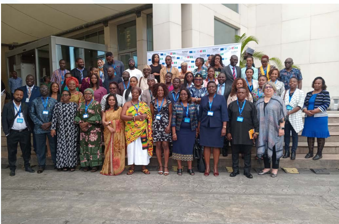
Group Photo of participants at the SI review meeting

Spotlight Initiative Overview: The Spotlight Initiative Africa Regional Programme (SIARP) is a collaboration between the UN, EU, and AU, aiming to counteract violence towards women and girls and harmful practices. The programme amplifies strategies like the African Union's Gender Strategy, the UN Agenda 2030, and the Maputo Action Plan. With interventions in countries such as Uganda, Malawi, and Nigeria, the initiative strives for impactful outreach across the continent.