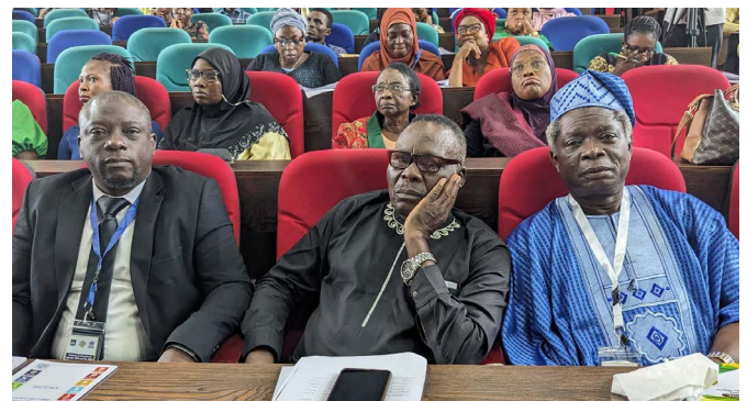
Cross-section of audience