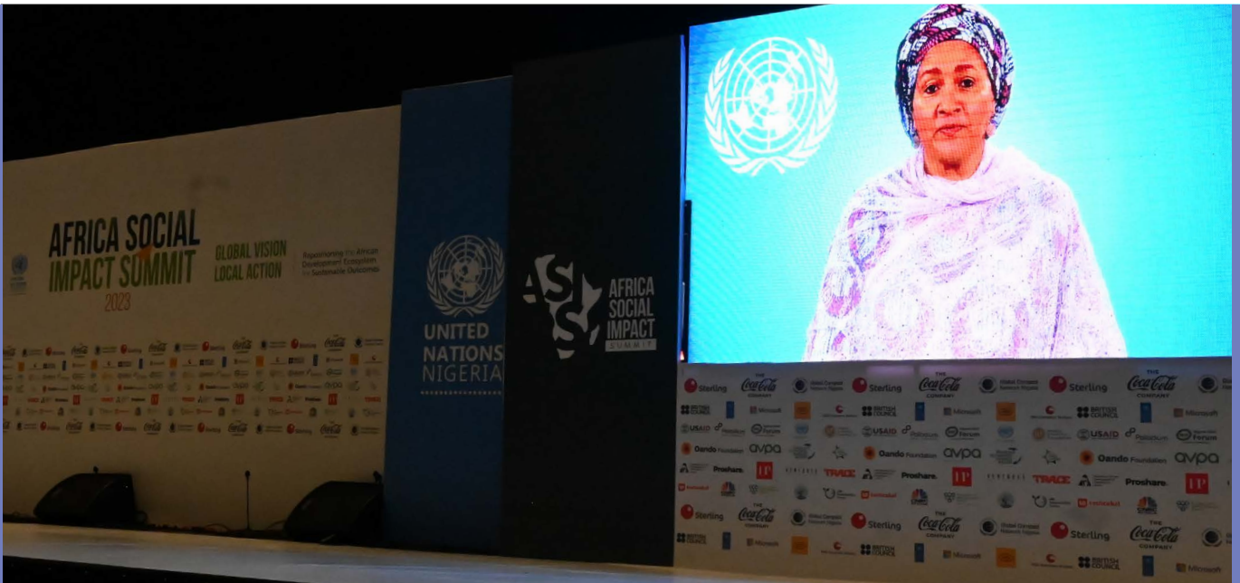
Video message by United Nations Deputy Secretary-General Amina J. Mohammed

United Nations Deputy Secretary-General Amina J. Mohammed has observed that Africa is the best investment proposition of the 21st century, in view of its natural resources, arable land and massive population.