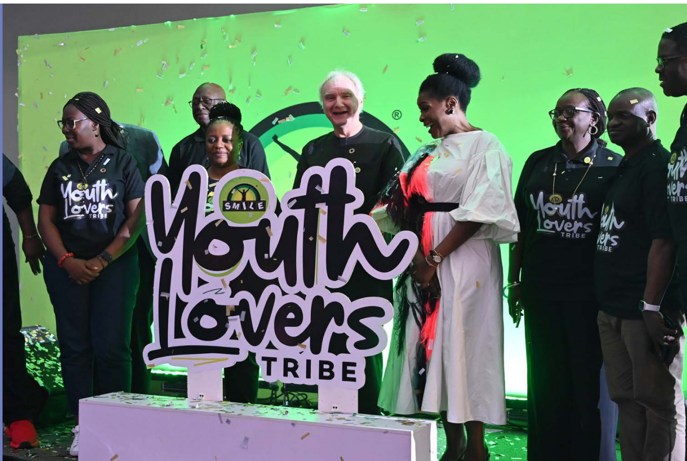
Launch of SMILE Youth Lovers Tribe