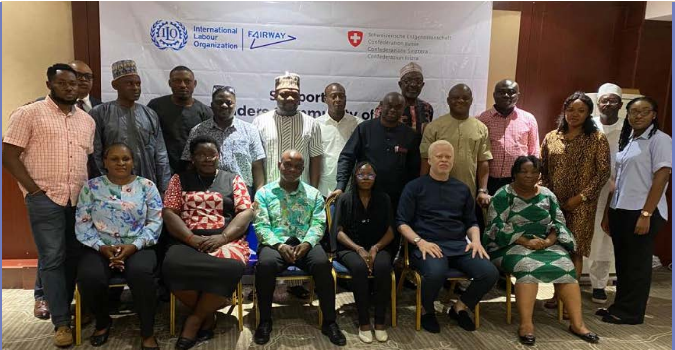
A group photo of facilitators and participants at the training

The ILO FAIRWAY project will wrap up by December of 2023, but journalists in Nigeria say the four-year project has been impactful.