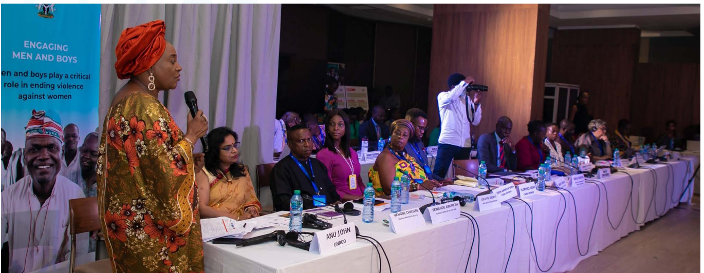
Panel discussions at the workshop