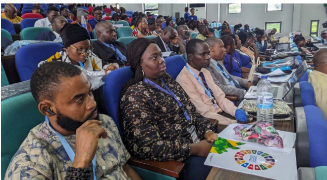
Cross-section of audience