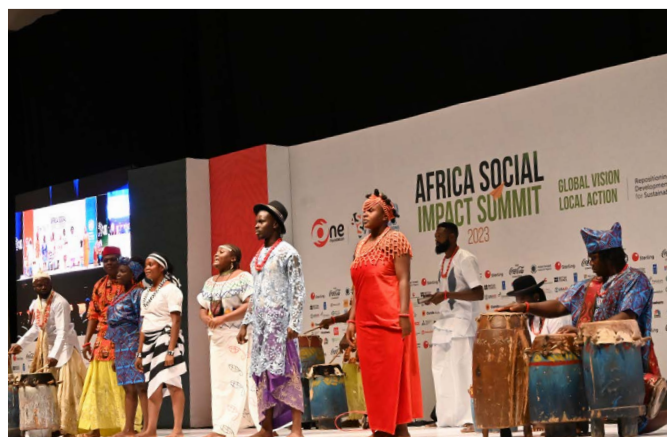
A cultural display at the event