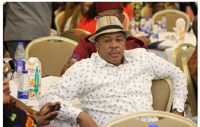
Nollywood actor, Francis Duru at the award ceremony