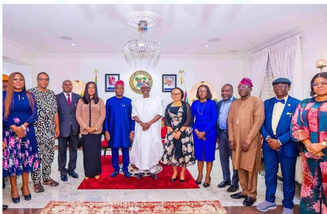
A group photo of the UNAIDS Team with the Governor and his team.

The city of Lagos excelled in moving the AIDS response forward and was awarded the distinguished "Circle of Excellence" Award by the Fast-track Cities Institute in October 2022, in Sevilla, Spain, during the 2022 Fast-track Cities Conference.