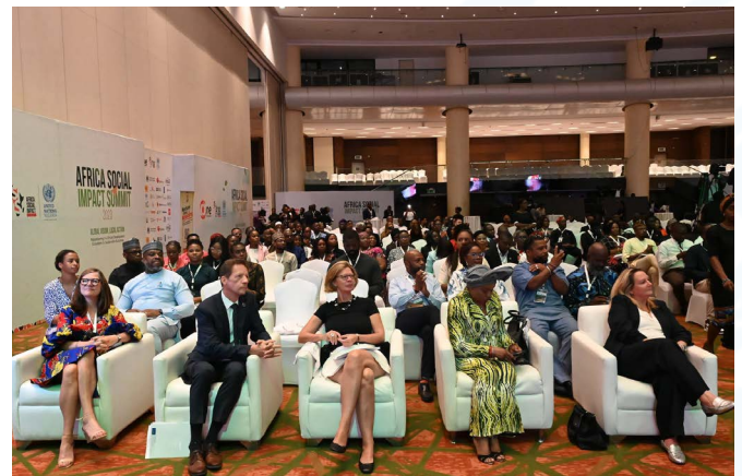
A cross-section of dignitaries and participants