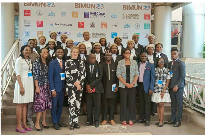
Dignitaries and members of the simulated International Court of Justice