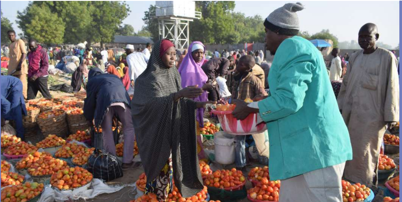
Tomato traders in Nigerian market

With a population estimated to hit 400 million by 2050, large food deficits remain a cardinal challenge to the food system, yet Nigeria has the potential to feed its growing population into the coming decades. This food self sufficiency can be attained, not only through production technologies but also by entrenching sustainable and inclusive food systems in the structure, governance and administration.