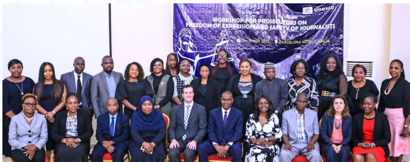
Group photo with the resource persons