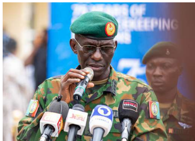
Nigeria’s Chief of Defence Staff, General L.E.O. Irabor

The dignitaries which included the representative of the Inspector General of Police; members of the diplomatic community; senior government officials; and UN staff members, later went to the exhibition ground featuring photographic exhibits of Nigeria’s involvement in UN peacekeeping missions over the decades.