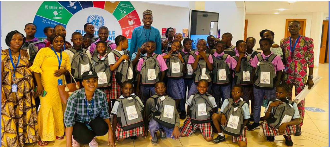
A cross section of children, teachers and WIPO Staff at the Children’s Day celebration.

To celebrate Children’s Day, May 27, the WIPO Nigeria Office (WNO) organized, in collaboration with the United Nations Information Centre (UNIC), a special intellectual property learning session for 40 children alongside their teachers, from primary and secondary schools in Abuja. The participating schools were KAPLEN International Community School and the Yuv Academy. The session took place at the United Nations House, Abuja.