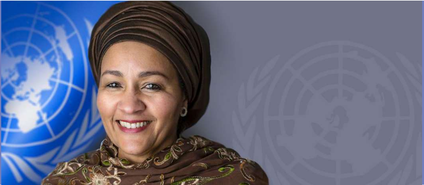
United Nations Deputy Secretary-General Amina J. Mohammed

In her overview of the task of nation building, the United Nations Deputy Secretary-General Amina J. Mohammed has charged State Governors in Nigeria to deliver on their campaign promises before leaving the office.