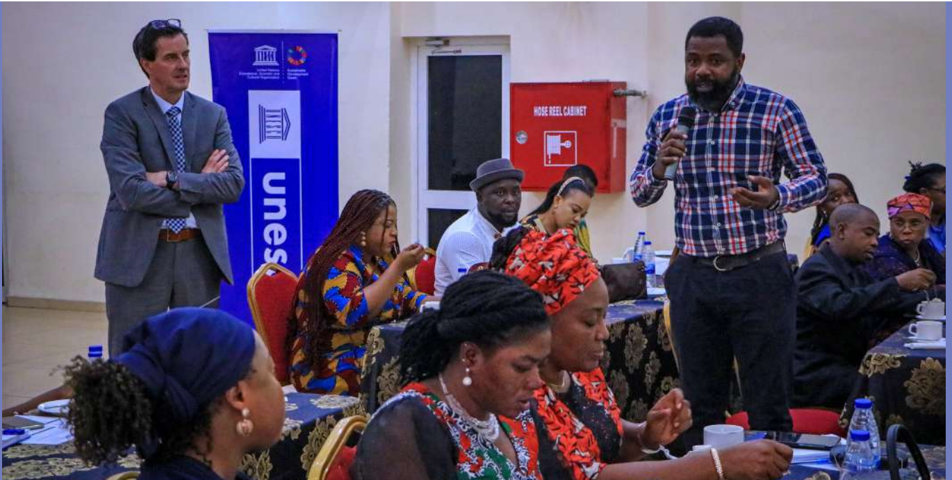
A participant makes an intervention during the workshop

In collaboration with the Office of the Attorney General Nigeria, UNESCO has concluded a national training course for prosecutors to strengthen knowledge and capacities on international and regional standards of freedom of expression, access to information and safety of journalists.