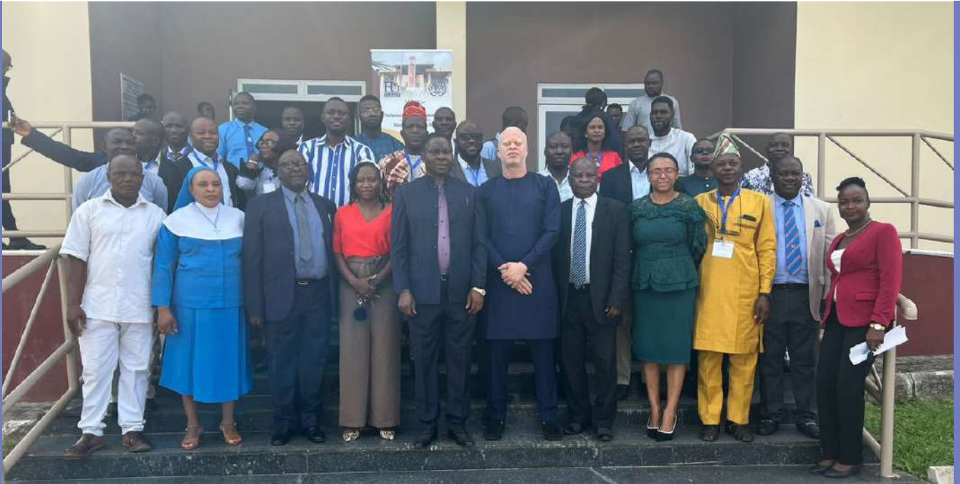
Dignitaries at a workshop that addresses knowledge gaps in the academia on reporting labour migration.

The International Labour Organisation (ILO) and Elizade University commenced a collaboration aimed at improving labour migration reporting in Nigeria. The collaboration was designed to include a training needs assessment (TNA), and a capacity building component through a workshop that addresses knowledge gaps in the academia, particularly in Southwest Nigeria on reporting labour migration.