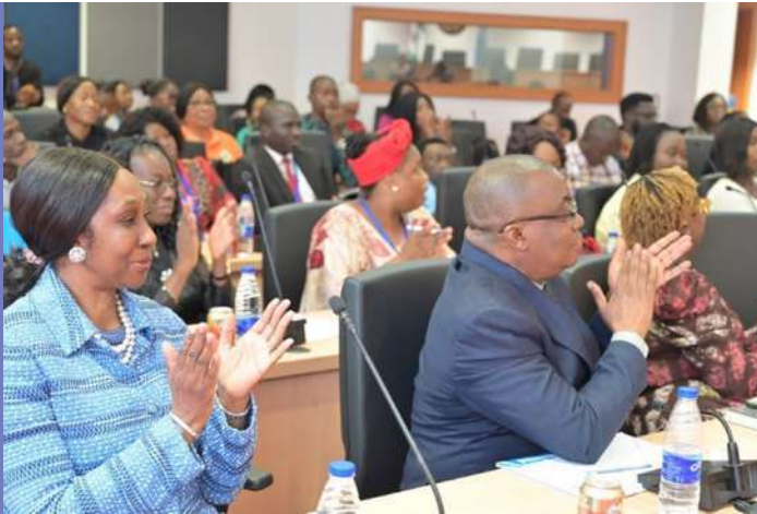
A cross section of audience