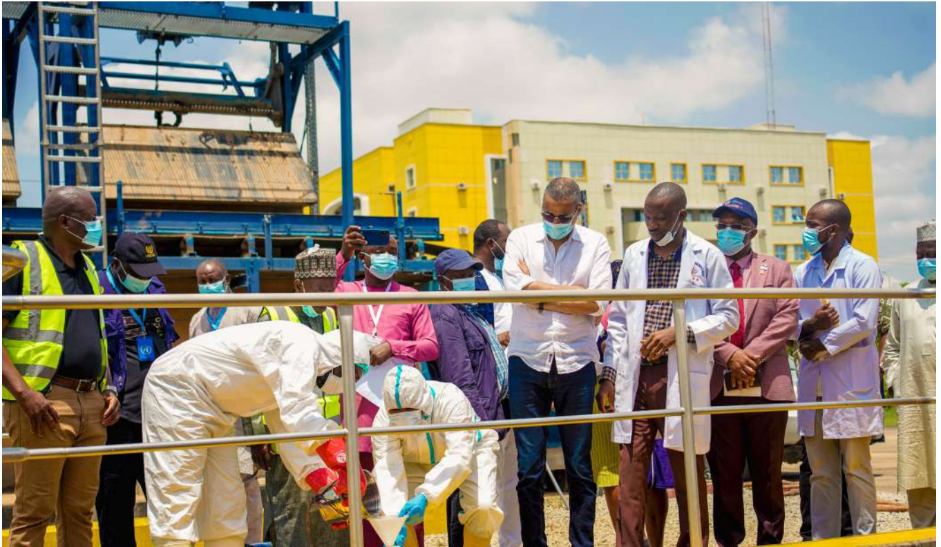
The surveillance team at the Wupa sewage treatment centre demonstrating to Mr Rattery the process of sewage sample collection for poliovirus testing.