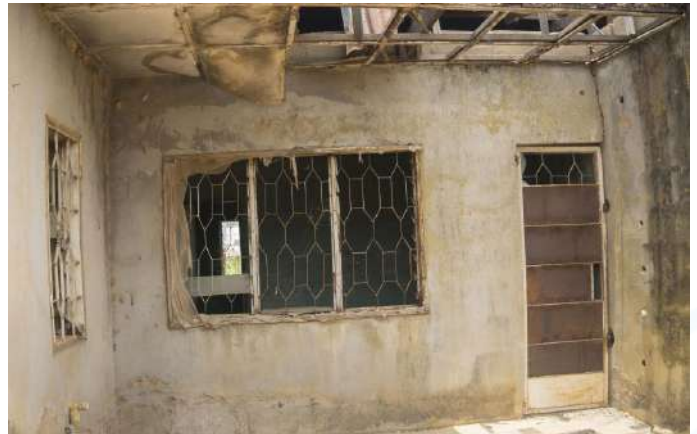
Flood ruins in Kabala West