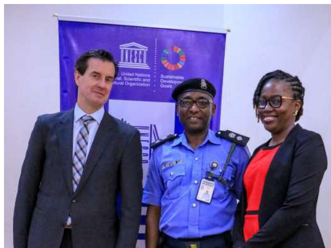
Communication/information program officer (R) with representative of Nigerian Police and a resource person