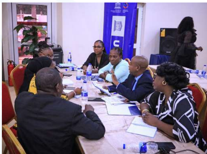
A cross section of participant during group work

The organization of this training was notably supported by the Multi-Donor Programme on Freedom of Expression and Safety of Journalists, thanks to the special support of the governments of Sweden, Norway and Japan.