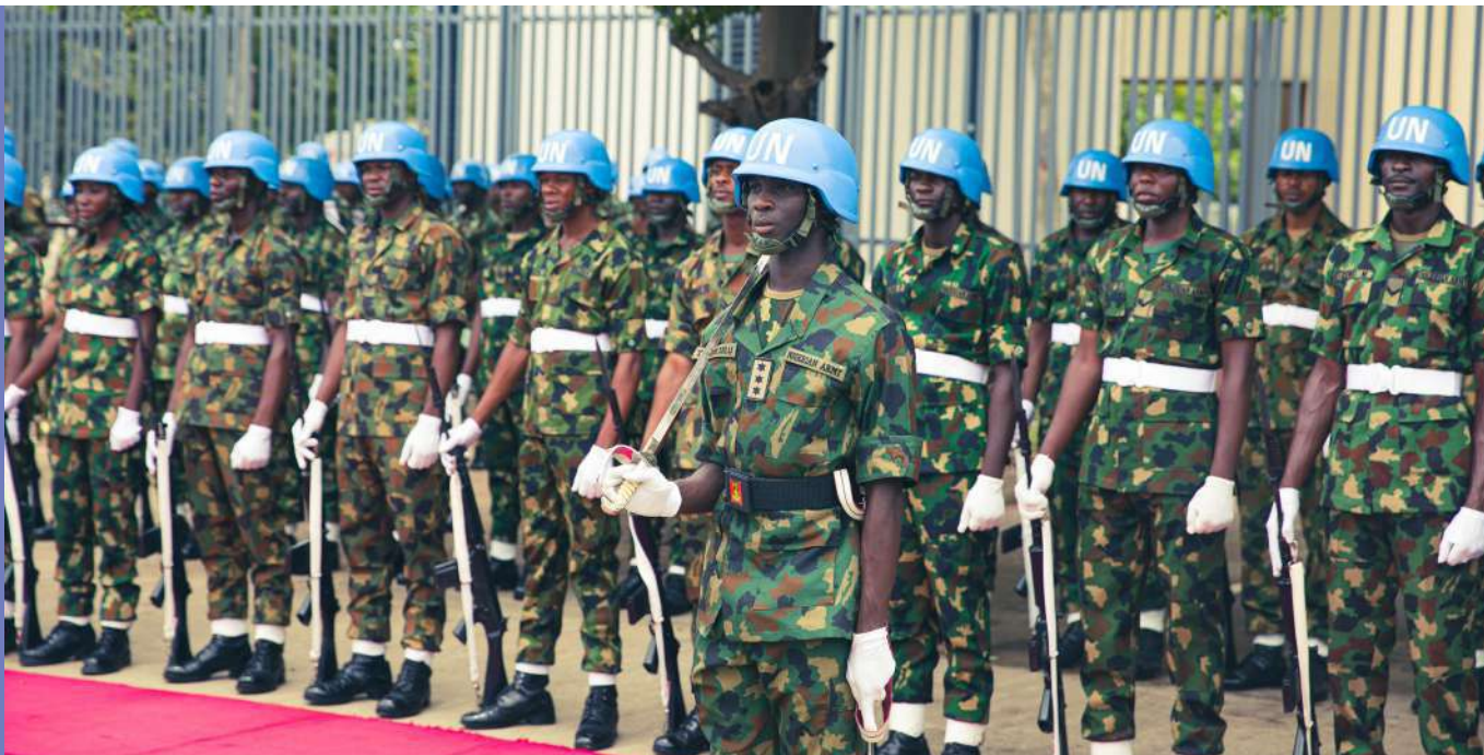
Nigeria Peacekeeping troops on parade during the 75 years anniversary commemoration at the UN House.