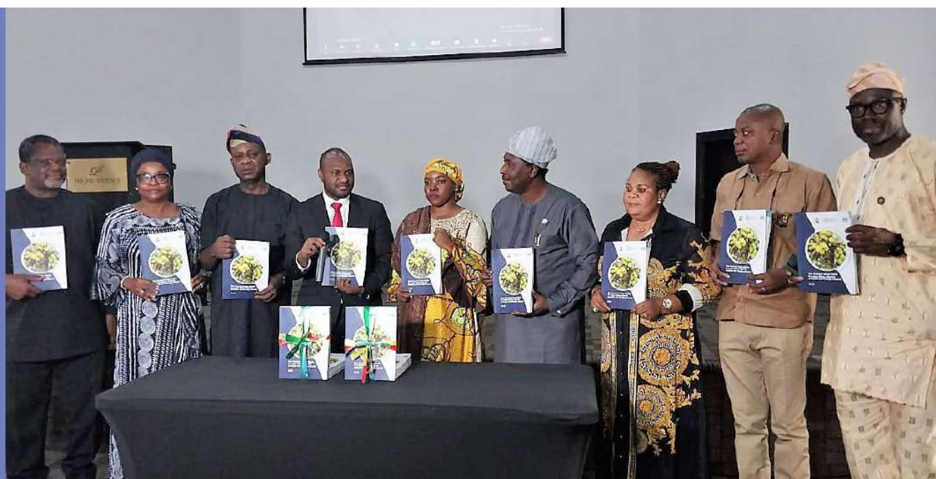
Dignitaries at the presentation of the coconut value-chain analysis and design report.

In a bid to ensure the sustainable development of the coconut value chain the Lagos state government has appealed to the Food and Agriculture Organization of the United Nations (FAO) and the United Nations Industrial Development Organization (UNIDO) to assist the state seek sustainable financing and strengthen relevant institutional capacities.