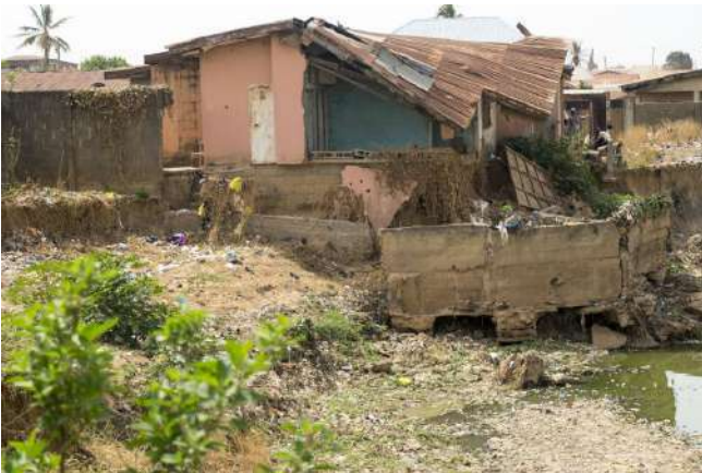
Flood ruins in Kabala West

Every aspect of her family's life had been impacted by the floods of 2021, including their home, their means of livelihood, and the schooling of their children.