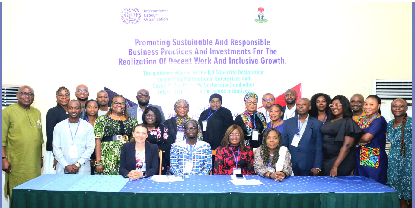
Group photograph of dignitaries and participant at the workshop

The workshop, which took place from November 7 – 9, 2023, brought together representatives from critical entities such as the Ministry of Labor and Employment, the National Human Rights Commission of Nigeria, the National Employers Consultative Association (NECA), the Nigeria Labour Congress (NLC), the Trade Union Congress (TUC), other crucial Government institutions. The central objective of this gathering was to establish a platform for collaborative dialogue and action in advancing sustainable business practices and investments, guided by the ILO Tripartite Declaration of Principles on Multinational Enterprises and Social Policy (MNE Declaration).