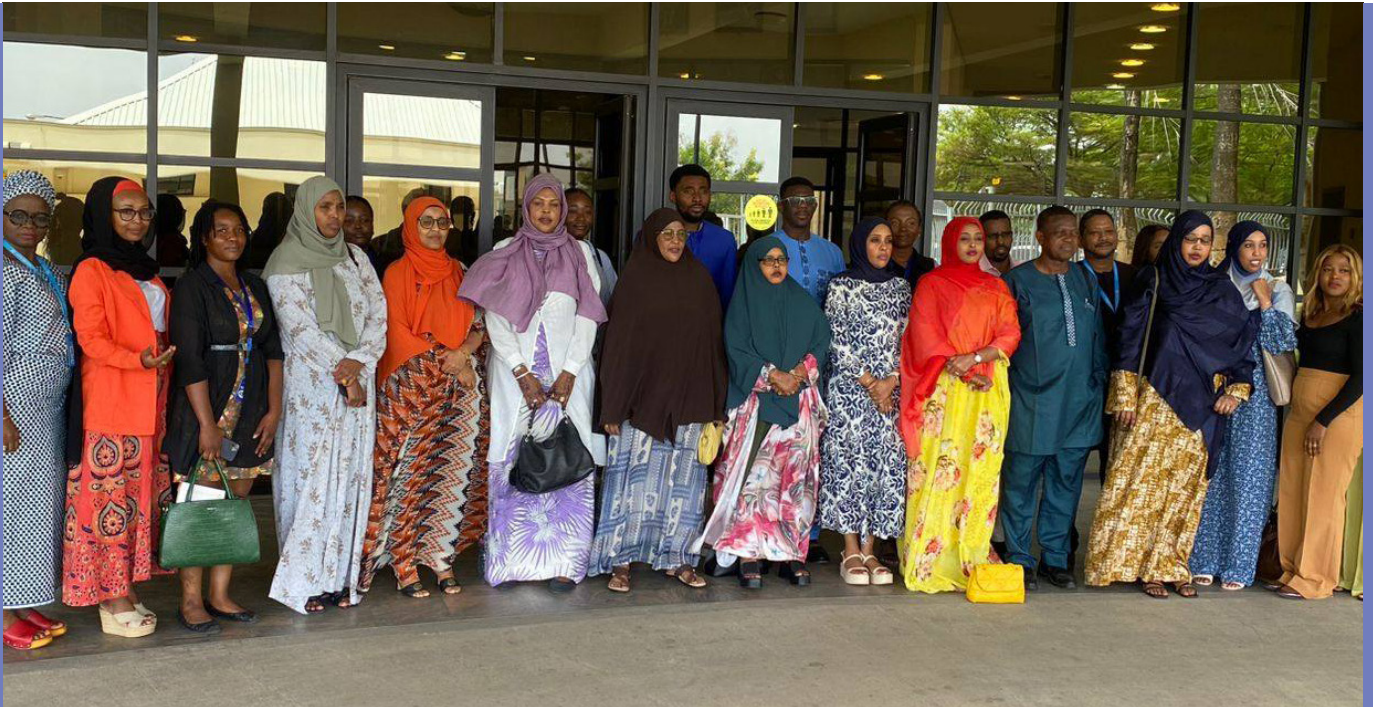
Group photograph of participants and dignitaries at the UN House Abuja

A delegation of Somali female parliamentarians with support from UNFPA Somalia are visiting Nigeria on a study tour. The purpose of the study tour is to empower female parliamentarians with capacities in gender sensitive legislative practices and parliamentary procedures through knowledge sharing/exchange.