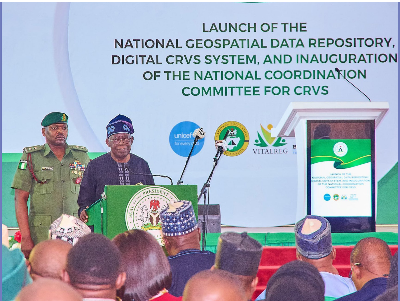
President of the Federal Republic of Nigeria, Bola Ahmed Tinubu during his speech at the launch

H is Excellency President Bola Ahmed Tinubu today, launched the Electronic Civil Registration and Vital Statistics System (e-CRVS).