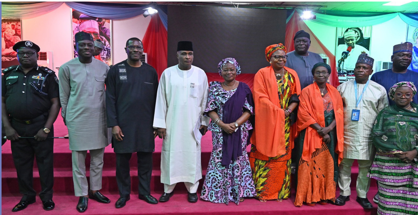
A group photograph of High level dignitaries in Sokoto State Spotlight Initiative handover ceremony