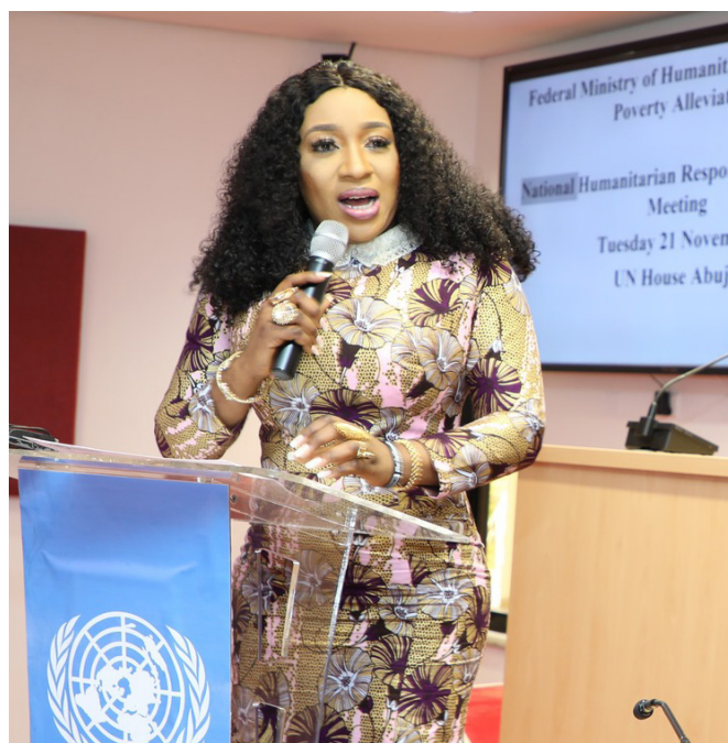
Dr. Beta Edu, Honorable Minister of Humanitarian Affairs and Poverty Alleviation

Federal Government of all humanitarian assistance to the country. The meeting was attended by heads of UN agencies, members of the diplomatic community, international NGOs and relevant agencies of the Federal Government. Participants agreed to hold quarterly meeting with all stakeholders as a coordination mechanism for transparency and accountability.