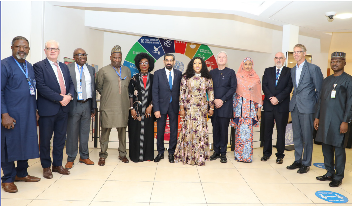
A group photograph of dignitaries

The Minister of Humanitarian Affairs and Poverty Alleviation, Dr. Beta Edu, has commended development partners for their support to Nigeria to address the humanitarian challenges facing the country. Speaking at the first National Humanitarian and Poverty Alleviation Coordination Meeting held at the UN House in Abuja on 21st November,