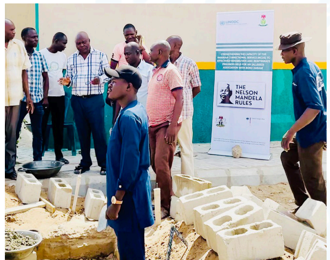
A group of men stand around a shallow hole in front of a line of cinderblocks, learning the professional skill of masonry