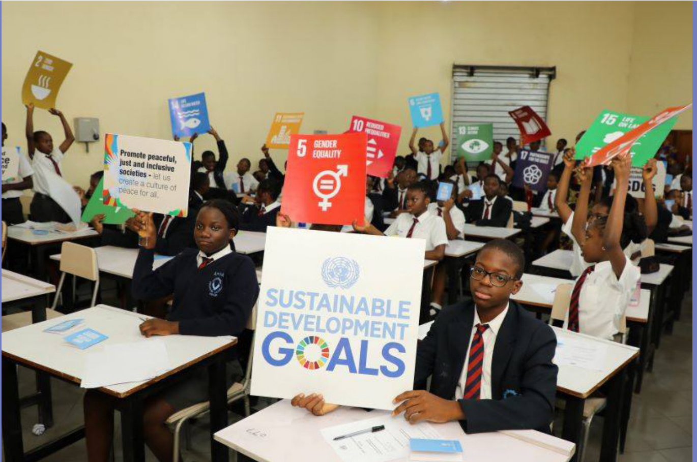
Students of Premiere Academy displaying the SDG goals

To sensitize and promote the aims and values of the United Nations amongst young people, students in the 7th and 8th grade of Premiere Academy Lugbe at an educational outreach were briefed about the History of the United Nations, Organs of the UN, the Sustainable Development Goals, Human Rights, Peace and Climate Change.