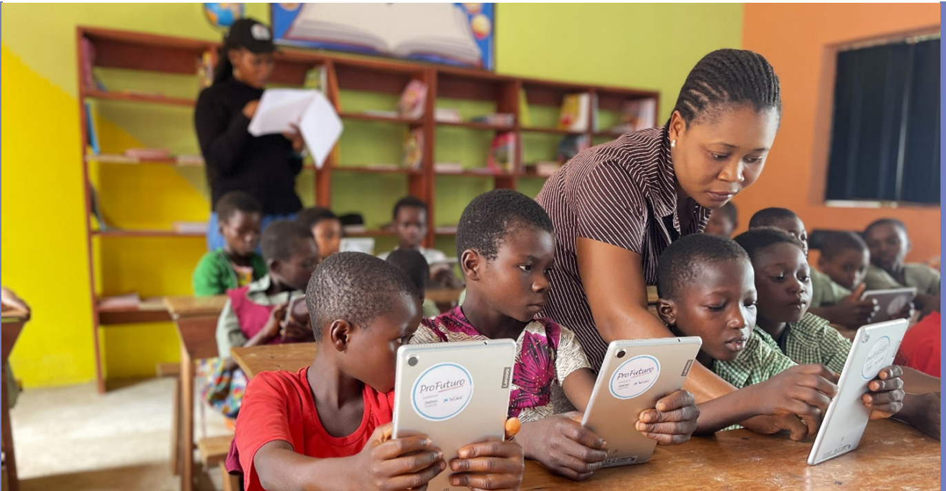
Cameroonian refugees and locals learn using digital methodologies in St. Eugene Primary School Ukende, Cross River State.

The pursuit of quality education for refugee children in Nigeria is a tale marked by both adversity and optimism. Nigeria is home to nearly 99,000 refugees, over half of whom are of school age and mostly come from Cameroon.