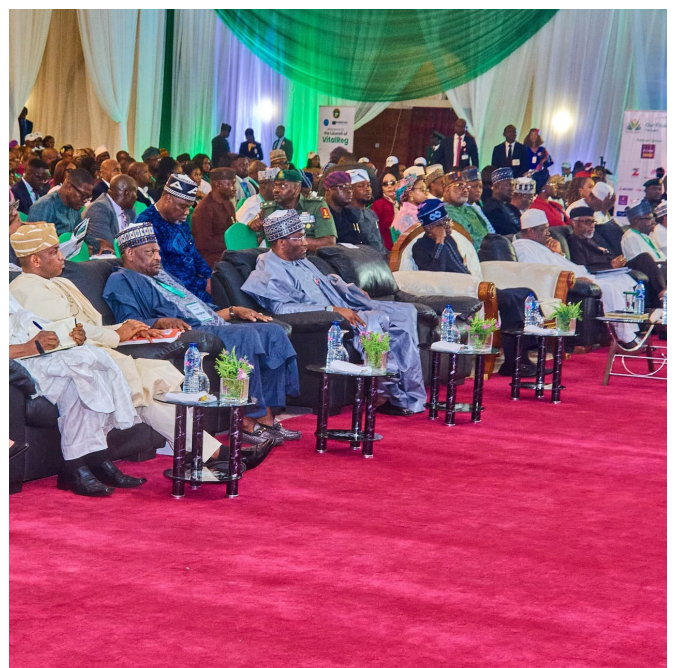
A group photograph high level dignitaries at the launch

This initiative aligns with the United Nations Legal Identity Agenda and the resolutions of the African Ministers' Conference in Addis Ababa, advocating for a technological shift in data generation.