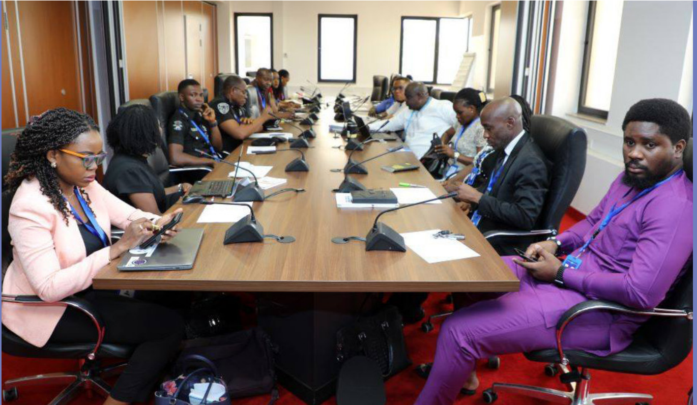
A cross section of participants at the training

The Office of the High Commissioner for Human Rights (UN Human Rights) in Nigeria and UNODC Nigeria under the PBF Project aimed at strengthening the oversight and accountability mechanisms of the Nigerian Police Force, hosted the POLICE-CSO SITUATION ROOM meeting today at the UN House.