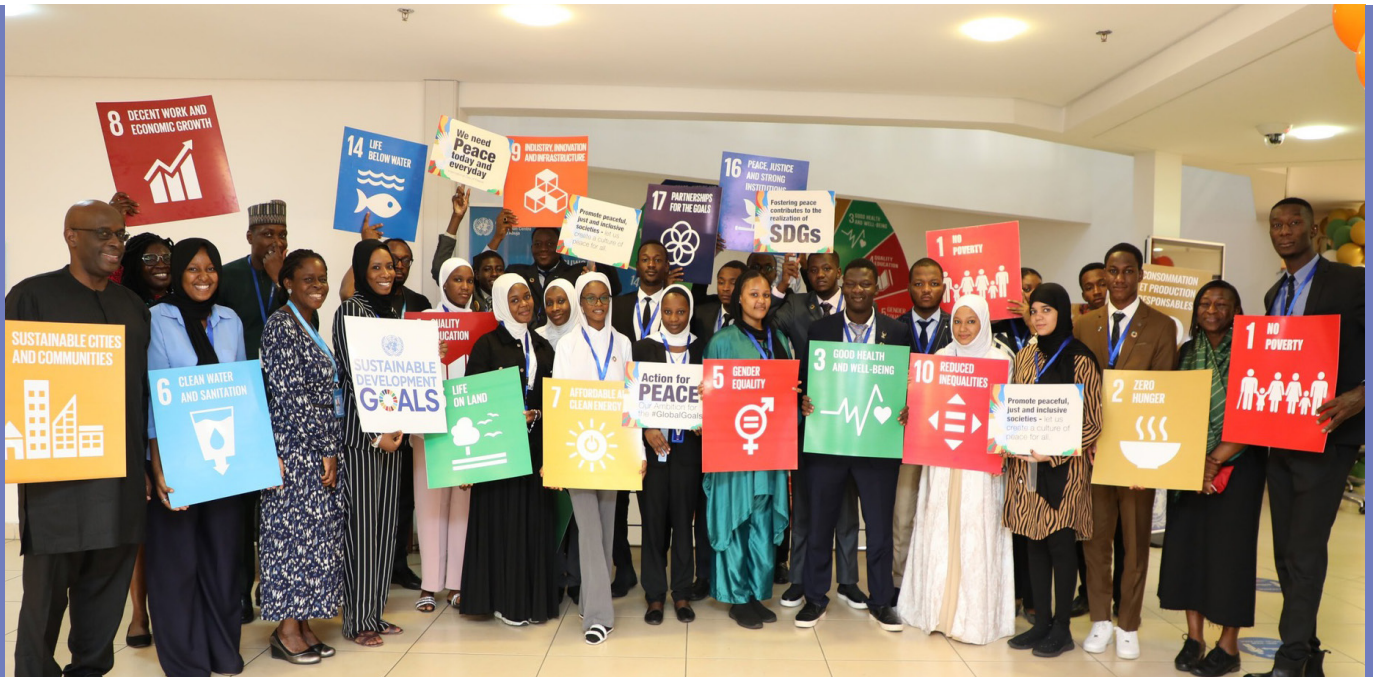
Group photo with Student from Skyline University, Kano State