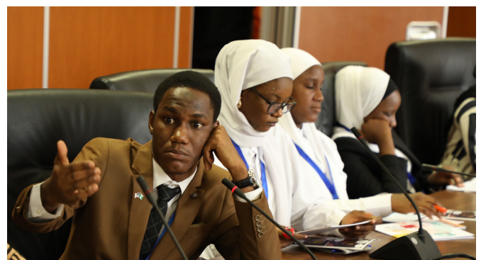
During a Q&A session.