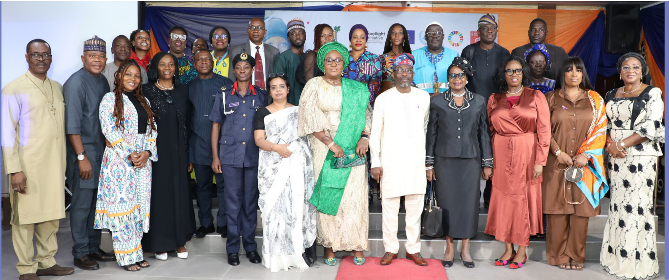
A group photo of High level Dignitaries at Spotlight Initiative the Lagos Handover/ Close-out ceremony

The First Lady of Lagos State, Dr Mrs Ibijoke Sanwo-Olu has acknowledged that with the support of the EU-UN Spotlight Initiative to end violence against women and girls, Lagos State had made significant progress in creating a society where every woman and girl in the state could live free from violence and discrimination.