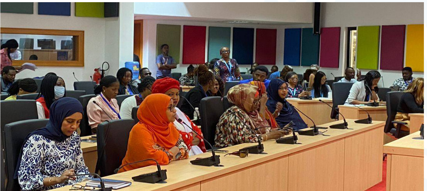
A cross section of audience

The choice of Nigeria for the tour is premised on its similarities with Somalia in terms of governance structures, bicameral legislature, cultural values, and religious systems.