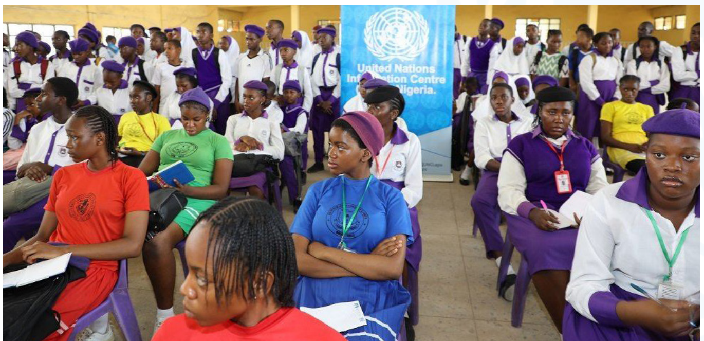
A cross-section of students of Government Secondary School Gwarinpa, Life Camp and Government Secondary School Wuse

The students were advised to be heroes for the environment and understand how the SDGs are aligned with the objective of fostering a more sustainable and improved future for all.