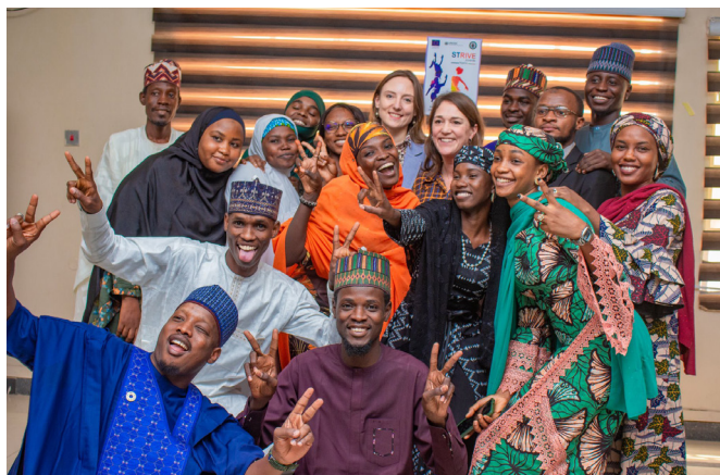
STRIVE Juvenile Youth Peace Champion strike a pose with the STRIVE Team at the launch of short documentary and handover of Community Dialogue Structures in Maiduguri, Borno State

“I have discovered the potential for positive change, one block at a time.”