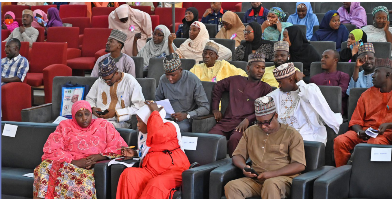
A group photograph of the audience at the Spotlight Initiative Sokoto handover ceremony