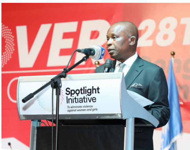
The Attorney General of the Federation Mr Lateef Fagbemi SAN during his remarks at the event