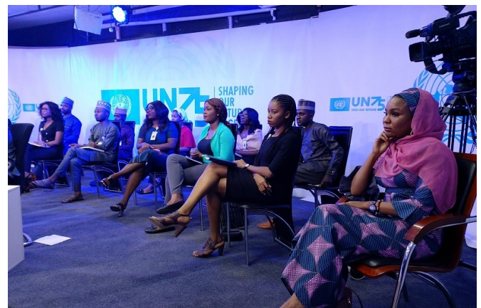
A cross-section of young people at the United Nations Deputy-Secretary General Amina J. Mohammed's UN75 Youth Dialogue in Abuja