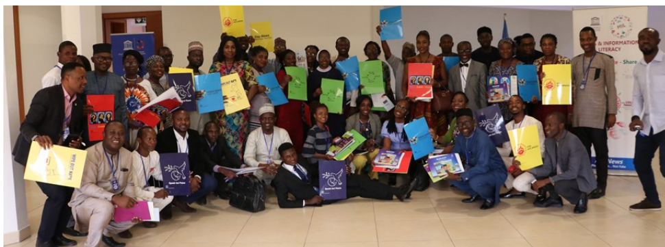
Participants at the Consultative meeting

With the increasingly important role of the media in the lives of people and society, as a result of the ever-increasing technology, more attention is being drawn and devoted to the relationship between the media and society. This has no doubt attracted more interest to the imperativeness of stakeholders to develop strategies aimed at educating citizens to learn and imbibe the skills of Media and Information Literacy (MIL).