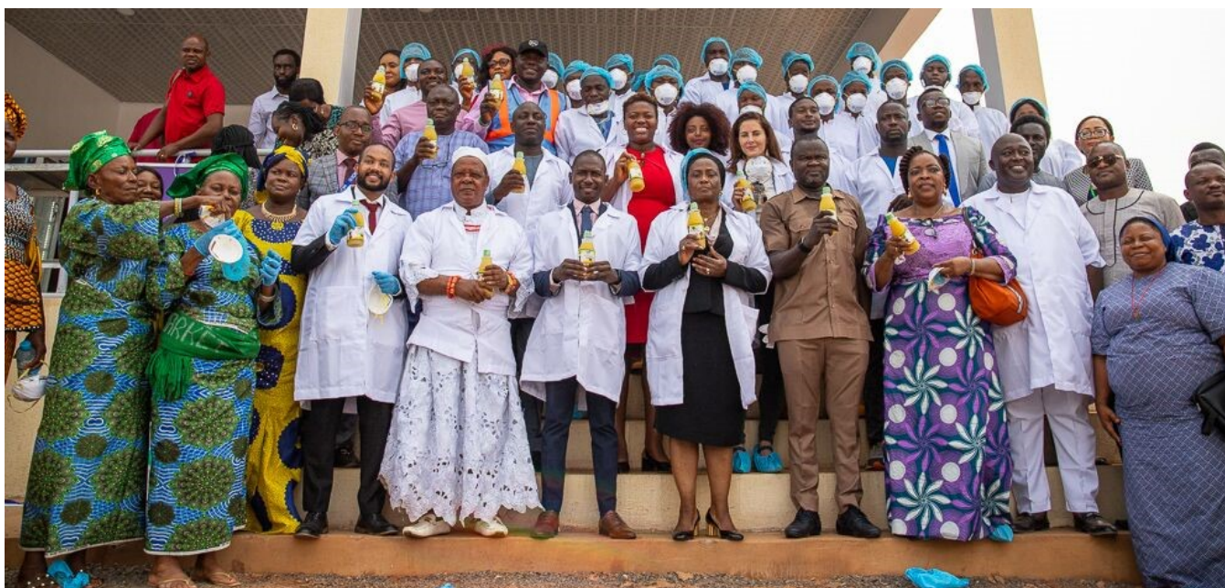
Farmers, private sector and migrant returnees have joined forces to open a pineapple processing factory in Nigeria.

For centuries, ever since the opening of Atlantic Ocean trade routes many now associate with the dawn of ‘globalism’, the pineapple has served as a symbol of welcome and safe haven. Replicas of the fruit, cut from wood or stone or sculpted in clay, have been a fixture in luxury homes across the Caribbean and the American South.