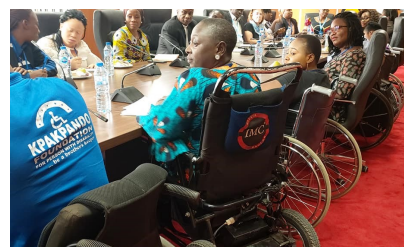
Members of a coalition of persons with disabilities at the UN House Abuja

He said this on 10 February 2020 while receiving a coalition of persons with disabilities at the UN House, Abuja. "As we begin a decade of action to accelerate the achievement of the Sustainable Development Goals (SDGs), we must ensure no one is left behind." He added.