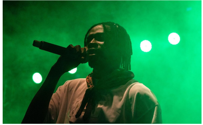
Nigerian superstar Fireboy, on stage at the first-ever concert for safe migration and social cohesion in Benin City.

Nigeria is synonymous with musical virtuosity and innovation. The legacy of the likes of Fela Kuti is still felt today with contemporary acts such as Burna Boy, Davido and Simi achieving wide acclaim all over Africa and beyond.