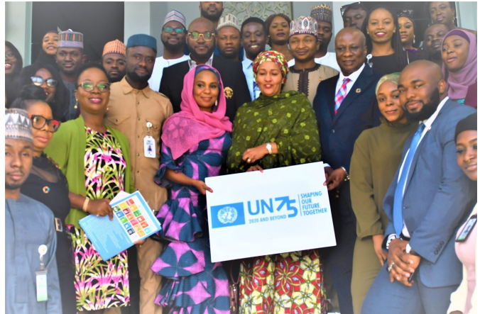
United Nations Deputy Secretary-General Amina J. Mohammed (middle) and young people after their UN75 dialogue in Abuja on 11 February 2020

All the youths took the UN75 the 1-minute survey before the dialogue started.