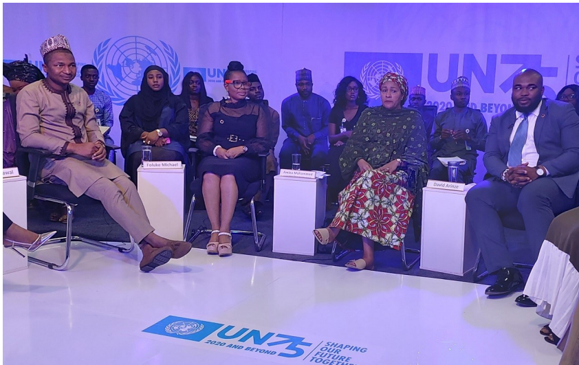
UN Deputy Secretary-General Amina J. Muhammed (2nd left) holds a UN75 dialogue with young people in Abuja Nigeria on 11 February 2020.

Following the global launch of the UN75 initiative – the world’s biggest conversation on the future we want, by the United Nations Secretary-General Antonio Guterres on 1 January 2020, the UN Deputy Secretary-General Amina J. Muhammed, on 11 February 2020, held a UN75 dialogue with young people in Abuja Nigeria.