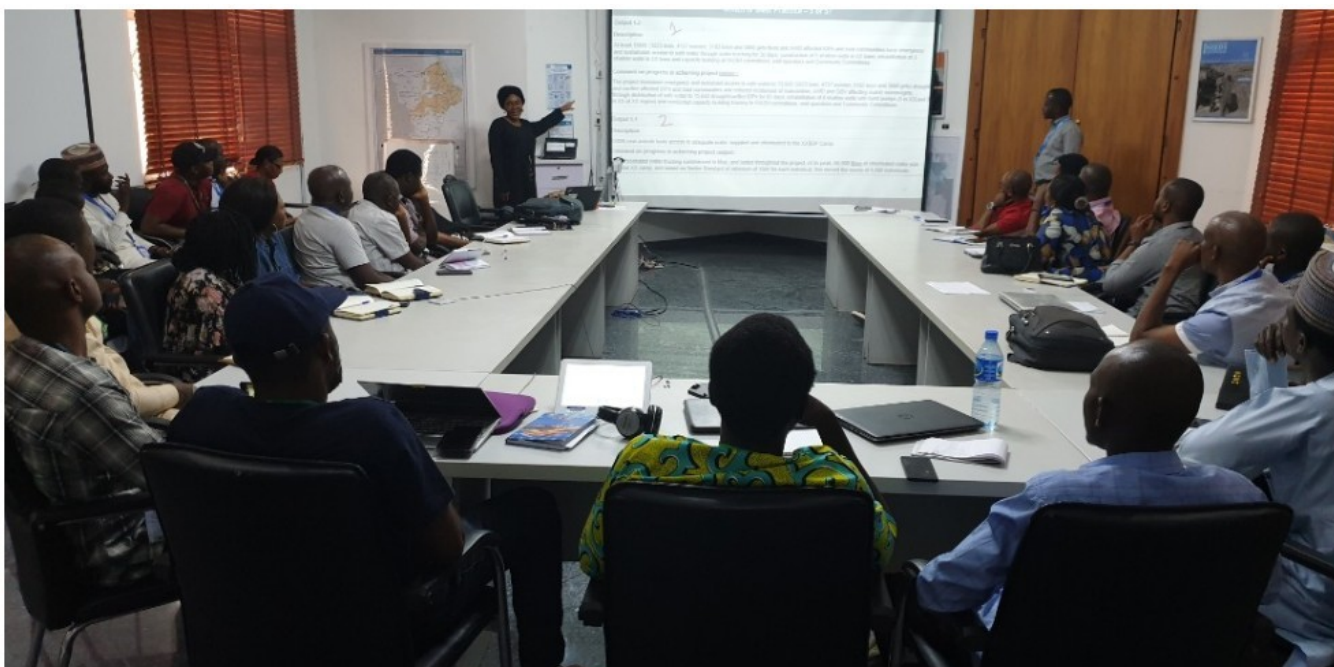
Training on Project monitoring and reporting for the Nigeria Humanitarian Fund (NHF), for Nigerian CSOs providing life-saving assistance in crisis-affected Borno, Adamawa and Yobe states, held on 26 February 2020.

Thirty staff members of Nigerian CSOs providing life-saving assistance in crisis-affected Borno, Adamawa and Yobe states were trained on 26 February by the UN Office for the Coordination of Humanitarian Affairs (OCHA) in project monitoring and reporting for the Nigeria Humanitarian Fund (NHF). The workshop aimed to build the skills of Nigerian organisations that play a vital role in responding to the needs of some of the most vulnerable people in the country.