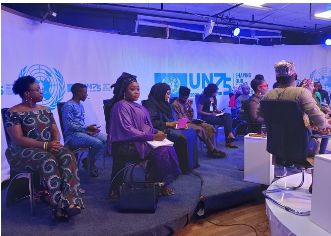
A cross-section of young people at the United Nations Deputy-Secretary General Amina J. Mohammed's UN75 Youth Dialogue in Abuja