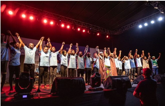
At the first-ever concert for safe migration and social cohesion in Benin City