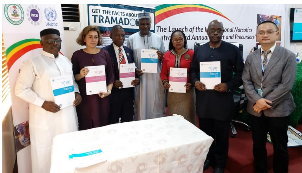
Dignitaries display the Int'l Narcotics Control Board (INCB) Annual Report 2019 and Precursors Report 2019.

Nigeria, on 27 February 2020, joined the rest of the world to launch the International Narcotics Control Board (INCB) Annual Report 2019 and Precursors Report 2019.