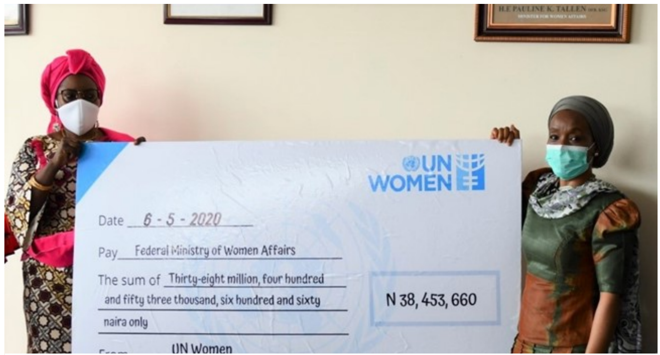
UN Women Representative to Nigeria and ECOWAS, Ms. Comfort Lamptey (Right), presents a cheque to the Honourable Minister of Women Affairs, Dame Pauline Tallen (Left).

he COVID-19 crisis has had devastating impacts on the lives of women and girls in Nigeria. The UN Secretary General's policy brief on the impact of COVID-19 on women shines a light on the harsh economic realities. "Compounded economic impacts are felt especially by women and girls who are generally earning less, saving less, and holding insecure jobs or living close to poverty." Women in Nigeria make up 47.8 % of sole owners of microenterprises and 22 % of SMEs, with a high concentration in specific economic sectors, such as wholesale, manufacturing, accommodation, food services and agriculture. These women-led enterprises will be heavily impacted by disruptions in supply chains and closure of markets; impacting on their ability to feed their families and be independent.