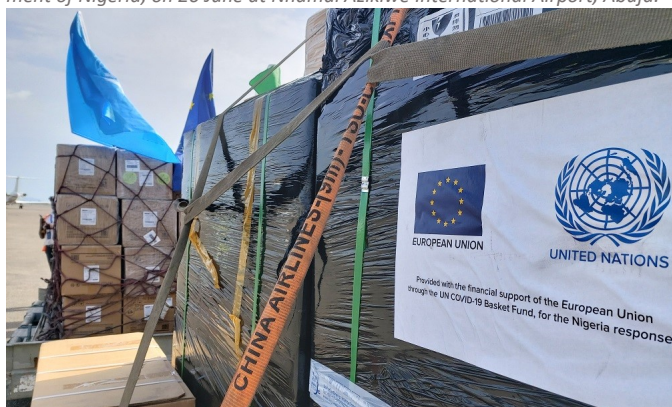
A cross-section of essential medical supplies landed by the United Nations system in Nigeria and the European Union, and handed over to the Government of Nigeria, on 20 June at Nnamdi Azikiwe International Airport, Abuja.