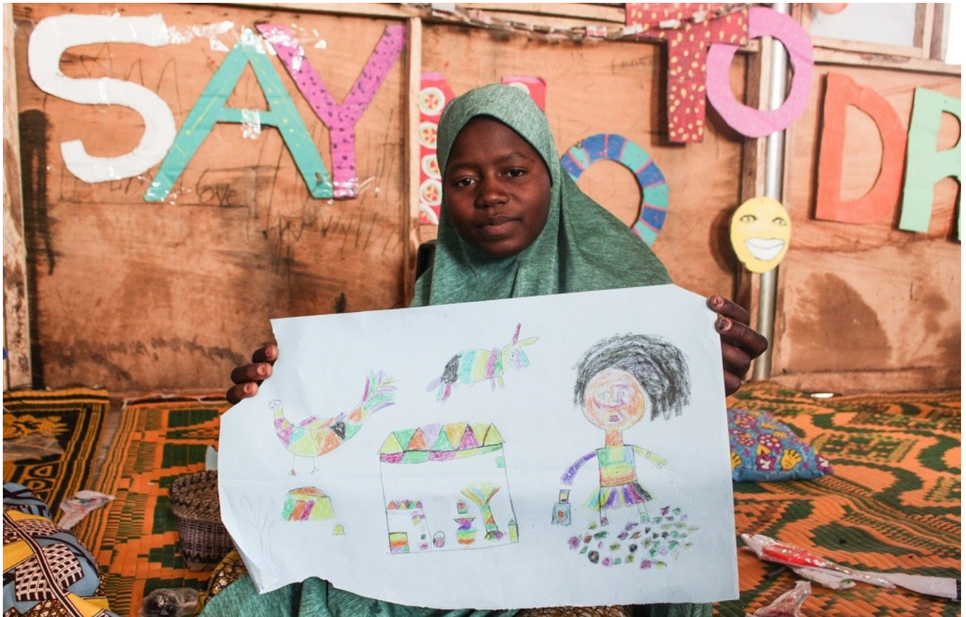
Artistic workshops allow displaced children in north-east Nigeria to express themselves.

On Thursday, 11 June, the world's leading stationary brand BIC donated 28,000 writing and coloring items to the International Organization for Migration (IOM). The donation—color pencils, pens and whiteboard markers—will support IOM's mental health and psychosocial support (MHPSS) to internally displaced people (IDPs).