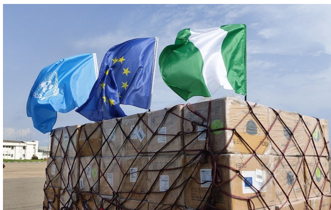
A consignment of essential medical supplies landed by the United Nations system in Nigeria and the European Union, and handed over to the Government of Nigeria, on 20 June at Nnamdi Azikiwe International Airport, Abuja.

from UN agencies; $US4 million from the private sector (Dangote US$ 3.8 million and AP Maersk US$ 0.2 million); and US$0.4 million from the Government of Switzerland.