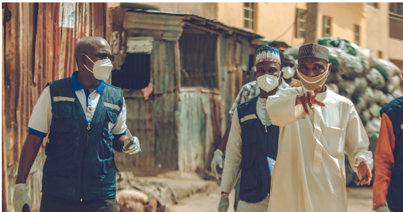
Kano Officials including WHO personnel in the field at a community in Kano.

When health officials in Kano State noted that turnouts for Covid-19 testing were consistently low across communities, they grew worried. Many residents were unaware of how serious the Covid-19 disease was, and despite sensitization messages on the pandemic, some did not believe COVID-19 was real. How then, officials worried, would health workers be able to convince residents to submit themselves for testing so infected persons could be isolated and treated?