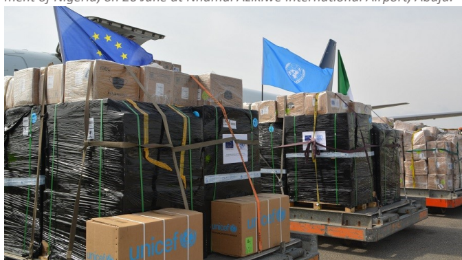
A cross-section of essential medical supplies handed over to the Government of Nigeria, by the UN and the EU on 20 June .