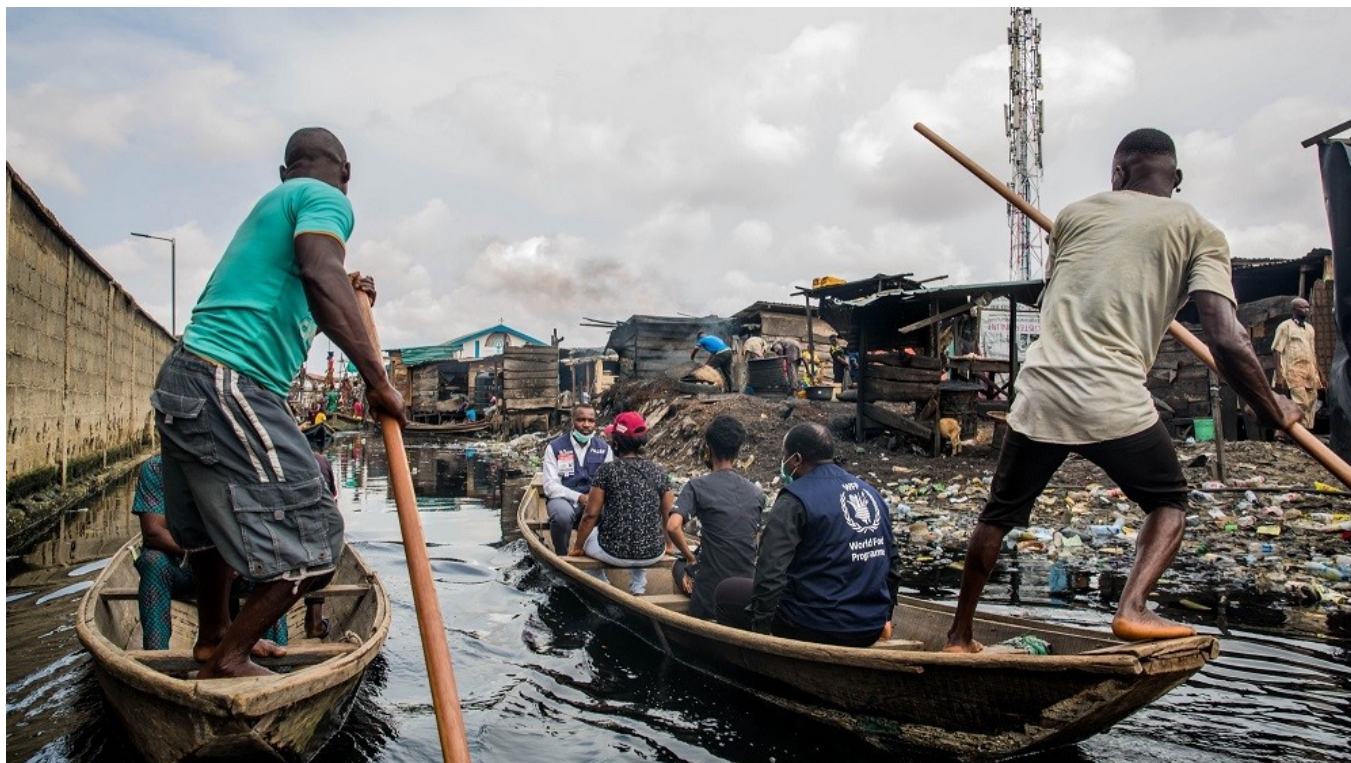
With the shortage of boats, getting a ride is difficult at the best of times.

Residents of the world’s largest floating slum are keeping their hopes up as lockdown sinks their livelihoods