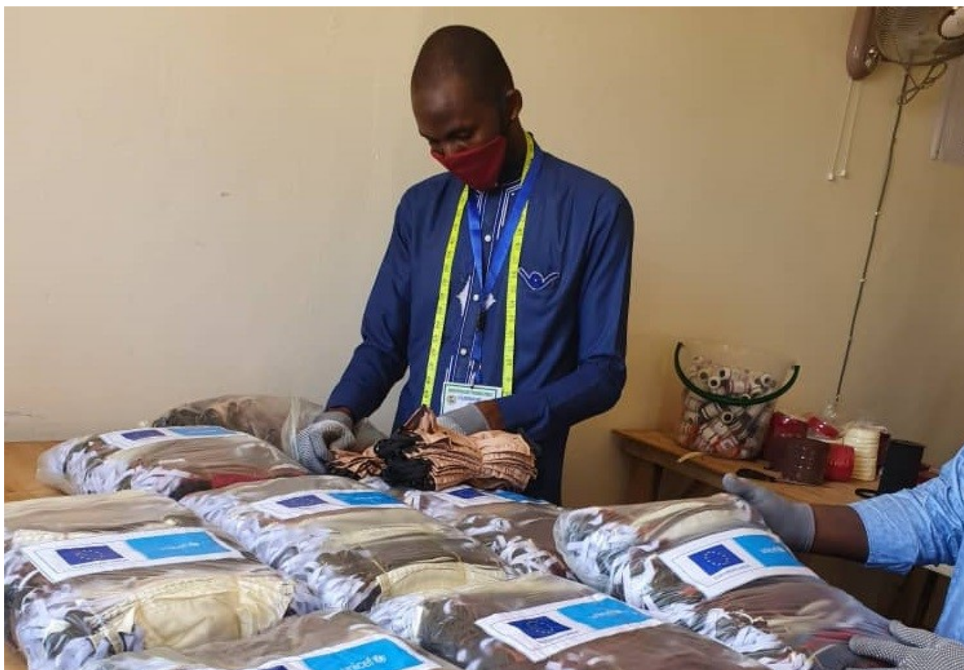
Face masks ready for distribution: To prevent the spread of COVID-19 in Borno State, young people are producing face masks and soap in vocational centres supported by UNICEF and the European Union.

There is a busy whirl and clatter of sewing machines in a UNICEF-supported vocational centre in Maiduguri, north-east Nigeria. Inside the expansive hall, 18 young people sit at a distance from one another, their noses and mouths protected with cotton face masks.