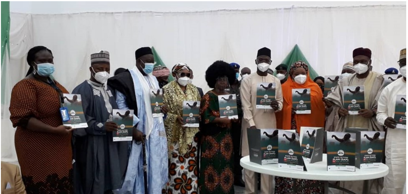
The launch by the Governor, supported by the Deputy Governor, the First Lady, Secretary to the State Government, Emir of Lafia, Chair House Committee on Women Affairs, Programme Analyst, UN Women and the Action Aid Country Director.

On 6 August 2020, UN Women supported the launch of the State Action Plan (SAP) on the implementation of UNSCR1325 on Women Peace and Security by the Nasarawa State government, and the inauguration of the Steering Committee of Nasarawa State Network of Women in Peacebuilding.