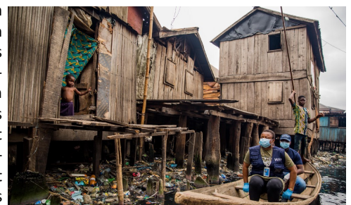
WFP staff in Makoko, Lagos.

WFP food and cash distribution in August will focus on assisting vulnerable people in urban hotspots that are hardest hit by the socio-economic impact of the coronavirus pandemic.