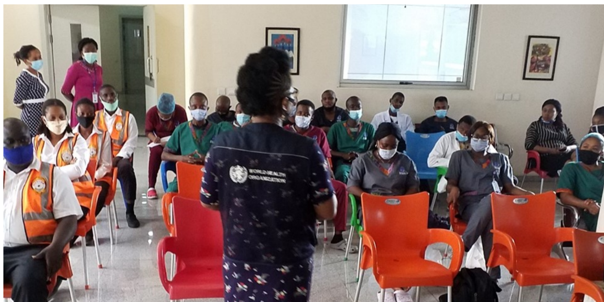
A WHO facilitator at the training of health workers in Kaduna