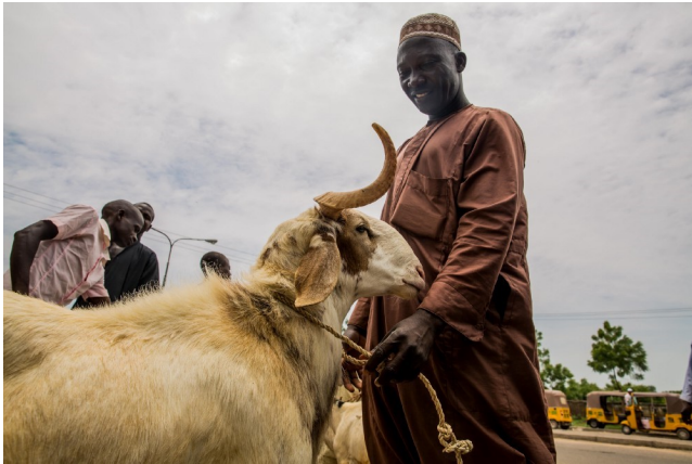
Many Muslim families were unable to buy a ram to celebrate the Eid al-Adha festival in Nigeria this year.

In Nigeria when Eid (or Sallah as it is called locally) comes around, it is usually marked by the scent of cooking wafting through narrow streets, coming from blackened pots perched atop smouldering firewood brimming with jollof rice and meat. There's often excitement in the air — from the murmurs of excited children showing off their best clothes, and the jolly chatter of extended families and neighbours visiting each other to share food. This year, the four-day festival, which ended on 3 August, was different.