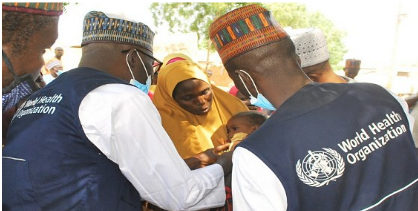
WHO personnel supervising polio campaign at Layin Kuka of Yindiski, of Potiskum, Local Government Area, Yobe State

To buoy up the immunity of eligible children, the Federal Government of Nigeria supported by the World Health Organization (WHO) and other partners vaccinated over 23 million children in October as part of the Sub-National Immunization Plus Days (SNIPDs) campaign.