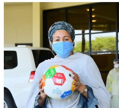
UN Deputy Secretary-General Amina J. Mohammed takes the SDGs-branded ball

The United Nations Deputy Secretary-General, Amina J. Mohammed, on Monday 9 November 2020, emphasized that there was the need for an engaged youth as well as an engaged government to bridge the communication gap between young people and the government.