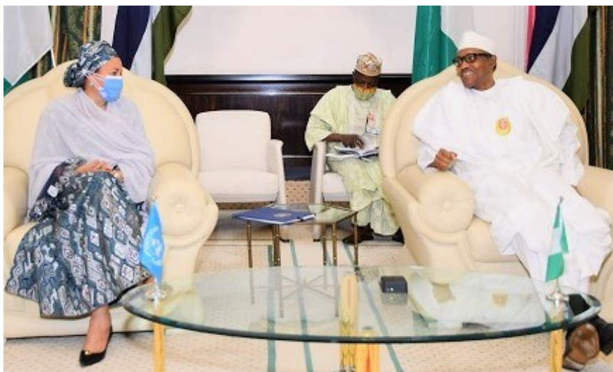
UN Deputy Secretary-General Amina J. Mohammed's (Left) discusses with President Muhammadu Buhari (Right) at the State House, Abuja Nigeria