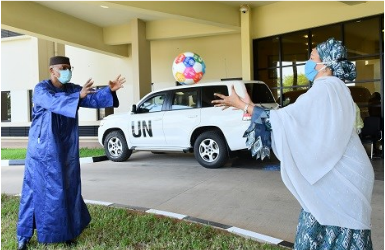
Special Representative of Secretary General (SRSG)/ Head, United Nations Office for West Africa and the Sahel - UNOWAS, Mr. Mohamed Ibn Chambas, throws the ball and UN Deputy Secretary-General Amina J. Mohammed gets ready to #TakeTheBall at the launch in Abuja.

In his commitment, Mr Chambas took the ball and said that he would work to deliver peace, justice and strong institution—SDG 16.