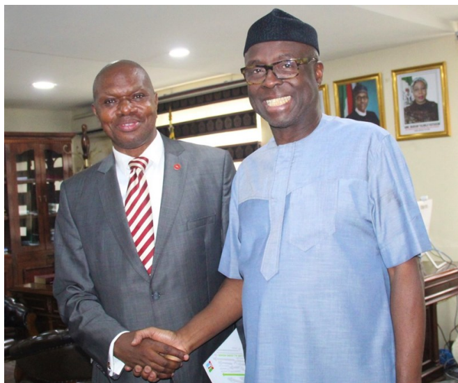
(L-R) UNIDO Representative to ECOWAS & Regional Director, Nigeria Regional Office Hub, Jean Bakole, and Minister of Industry, Trade & Investment, Otunba Niyi Adebayo, at the Minister's Office, in Abuja.

"Among the strategic partners industrialization and its contribution to the structural transformation of economies are top priorities of our respective institutional programming activities. While previous approaches for supporting industrialization were done in silos, the AID has been instrumental in building up a noticeable shift towards collaborative and less of institutional-