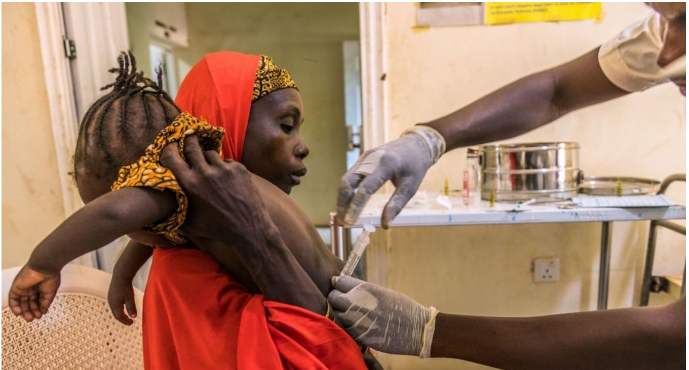
A volunteer gets a child attended to by a medical practitioner in Kebbi State

Thanks to support from the EU, there is now a corps of 900 trained volunteer drivers transporting children who need urgent medical attention to hospitals in Kebbi State