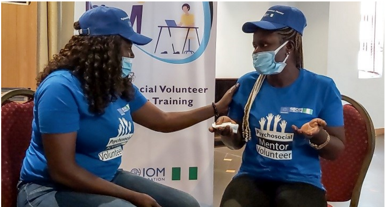
Returnees during the mentoring activity in Benin City, Edo State, the main place of origin of Nigerians returning from Libya.

COVID-19 continues to put a strain on public health systems, as well as on the livelihoods and purchasing power of people around the world. But as the pandemic shows no signs of abating, the impact on the mental health of the most vulnerable—including migrants returned to their communities—becomes more visible. As part of the response to address this challenge, from 16 to 19 November, the International Organization for Migration (IOM) hosted in Benin City, Edo State, a series of modules to train 20 returnees in a community-based approach to psychosocial reintegration.