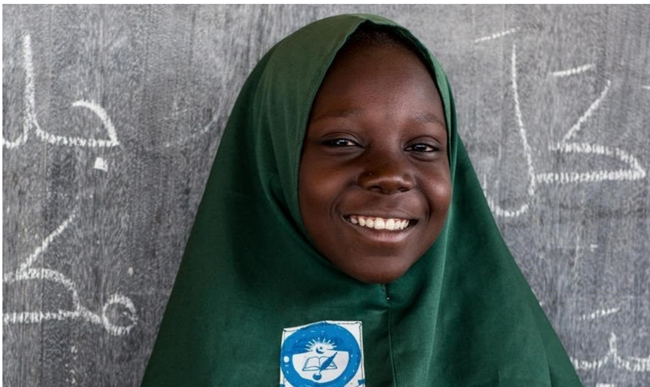
A schoolgirl in a classroom

UNICEF, in partnership with Educate a Child (EAC) – Education Above All (EAA), is helping to drive children's enrolment in school through a cash transfer programme for families