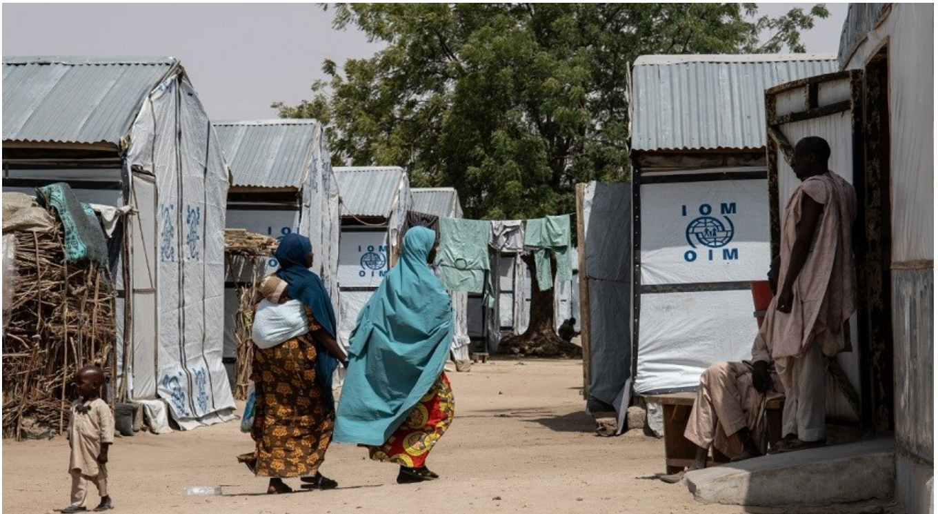
Gubio camp hosts more than 30,000 internally displaced persons in north-east Nigeria, where humanitarian needs have significantly grown in 2020.

Unrelenting violence in north-east Nigeria has prompted new waves of displacement to congested camps in 2020. The International Organization for Migration (IOM) has begun rolling out a new decongestion strategy in collaboration with humanitarian partners that aims to reduce overcrowding in over 55 per cent of the camps in Borno State – where four out of five internally displaced persons (IDPs) currently live in overcrowded sites.