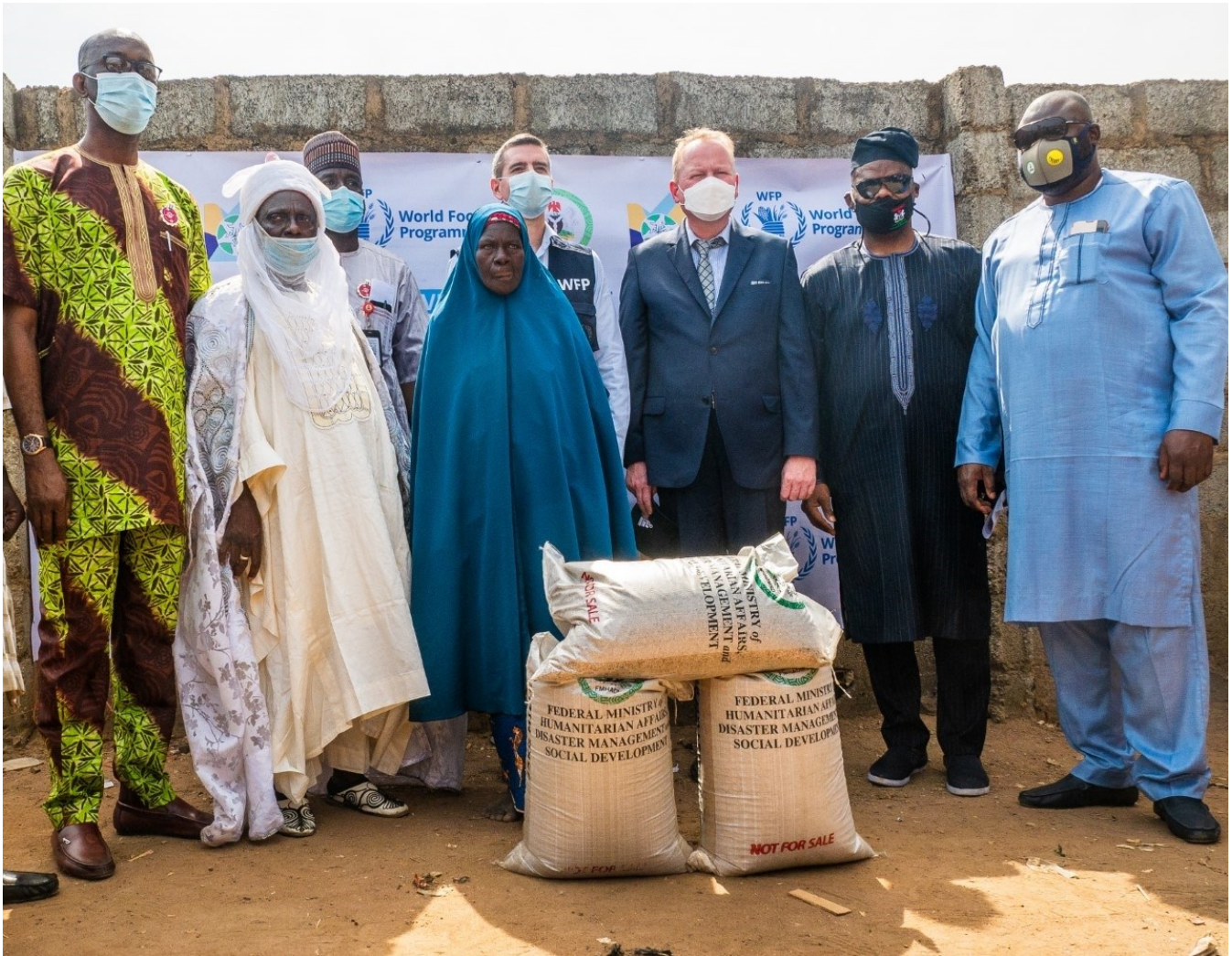
A group photograph of officials and representatives of the beneficiary communities

The United Nations World Food Programme (WFP) and the Federal Ministry of Humanitarian Affairs, Disaster Management and Social Development (FMHADMSD) to provide cash and food assistance to vulnerable people living in the Federal Capital Territory, Abuja (FCTA).