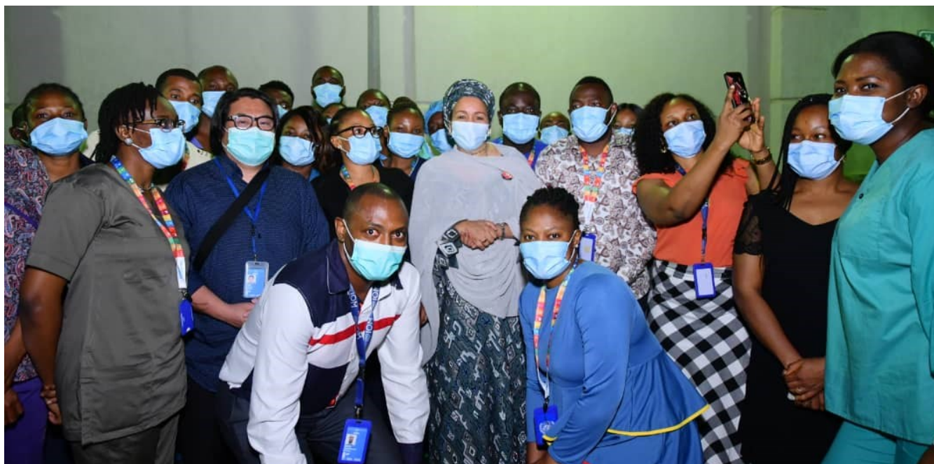
UN Deputy Secretary-General Amina Mohammed with women health workers and a few of their male colleagues at the UN Severe Acute Respiratory Isolation (SARI) Treatment Centre, Abuja.

A key feature of the COVID-19 pandemic is the paradox that although women make up most of the global health workforce they are too often, visibly absent from leadership positions in the sector. In Nigeria, women comprise an estimated 60% of health-workers yet women's representation in leadership in the health sector is low. Within the UN System, women make up the majority of workers in the newly established UN Severe Acute Respiratory Isolation (SARI) Treatment Centre, working day and night to ensure the health and well-being of UN Staff throughout the pandemic.