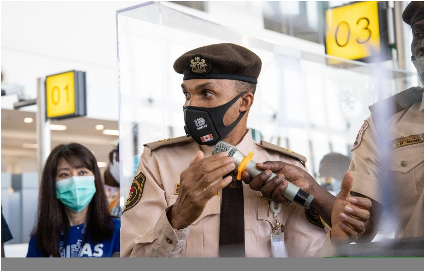
56 processing points will be supplied with MIDAS equipment in the two international airports, which will allow authorities to process travelers more rapidly and professionally.

On 4 December, the International Organization for Migration (IOM) with support from the Government of Canada, handed over equipment to the Nigeria Immigration Service (NIS) to strengthen migration and border management capacity in the country.