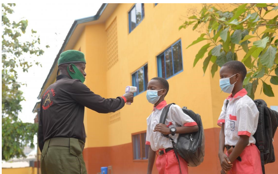
Temperature check at the entrance of Oregun Junior High School in Ikeja, Lagos

"Reminding my students to properly wash their hands as I have learned here and to do it repeatedly will help keep the virus at bay - and ultimately ensure all children can learn," he said.