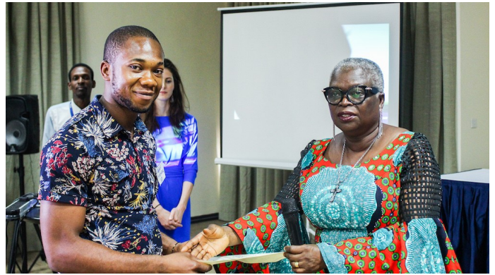
A returnee receives his business training diploma.