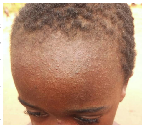
A little boy suffering from Measles

Measles campaigns were conducted in the Northern States during November 2017 and in the Southern States in March 2018. The LGAs currently affected by the outbreak were also covered by these campaigns with a total of 942,164 (95%) children vaccinated out of a target of 1,008,970 under five children targeted in these LGAs.