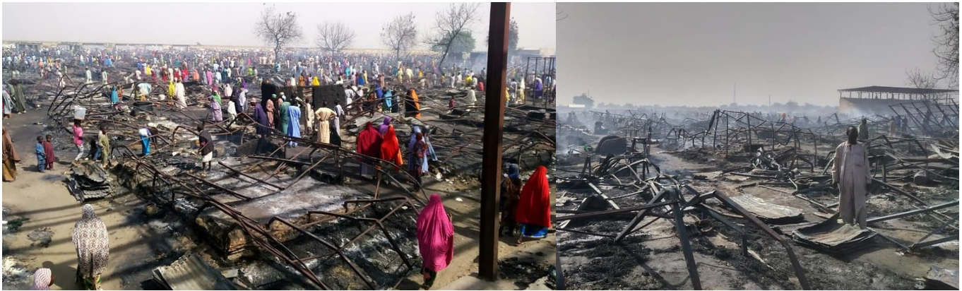
Left: Affected families walk through the ruins of their shelters. Right: Ruins of shelters destroyed by the fire incident in IDPs camp in Monguno town.