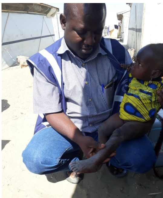
DSNO investigating 1st AFP case detected from inaccessible area of Borno

Engaged local informants have also been very helpful in monitoring other IDSR diseases such as measles, whooping cough, Tuberculosis (TB) and meningitis. The community informant initiative was made possible with active support of the Bill and Melinda Gates Foundation (BMGF).