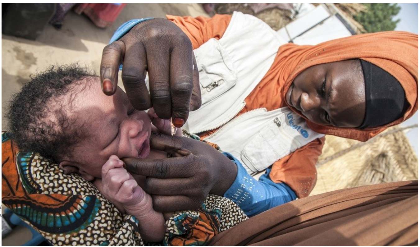
A child receives a vaccine against polio in Borno State.

UNICEF Nigeria is working with volunteers to pioneer new models of community infrastructure that are delivering remarkable results.