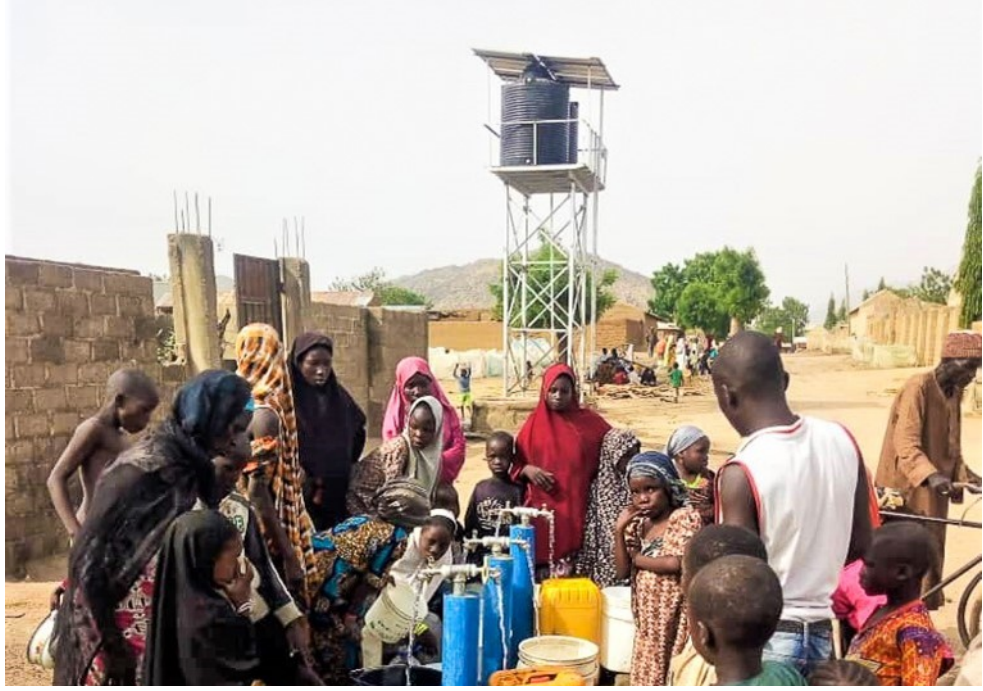
Before the rehabilitation was completed, women and children in Gwoza had to travel long distances to fetch water

ngoing hostilities in north-east Nigeria has caused the displacement of 1.8 million women, men and children, hampering their access to vital resources including water.