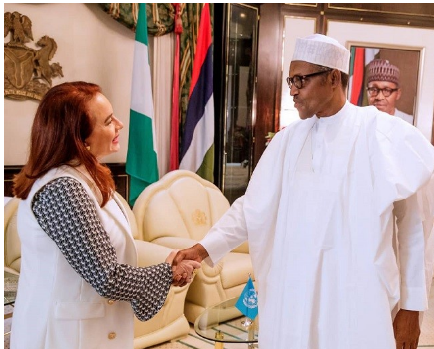
President Muhammadu Buhari of Nigeria (Right) welcomes the Presidential Villa Abuja, the President of the UN General Assembly, H.E. Ms Maria Fernanda Espinosa Garces, on 7 May 2019.

President Muhammadu Buhari of Nigeria, on 7 May 2019, solicited the assistance of United Nations and the international community in addressing the security and humanitarian challenges in the North-East as well as the drying up of Lake Chad.