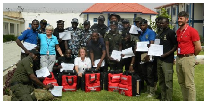
Participants at the UNMAS-organised First Responder training for the Nigerian Police Force (NPF) and the Nigerian Security and Civil Defence Corps (NSCDC)

The course provided the participants with basic and advanced skills to attend to victims of incidents, particularly explosive-