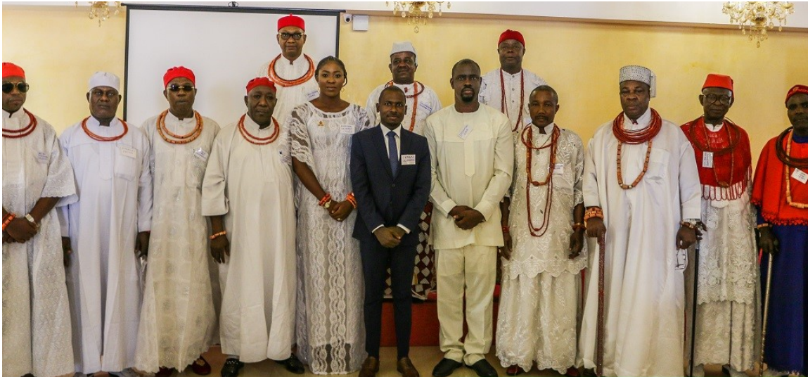
Participants including traditional and faith leaders, at the training on how to combat human trafficking and support the social and psychosocial reintegration of Nigerian returnees.

On 7-8 May 2019, 29 traditional leaders, imams and priests from Edo and Delta States in southern Nigeria gathered in Abuja to exchange best practices on addressing irregular migration and combatting human trafficking.