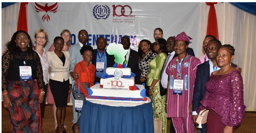
A group photograph of ILO Partners

The year 2019 is observed across the world as the Centenary year of the ILO. The year also marks the 60 th Anniversary of the establishment of the ILO in Africa, with its first African Office in Lagos, Nigeria. Celebrating the ILO in Nigeria was characterized by pouring of encomiums on the ILO for its contributions to the development of the Nigeria and humanity.