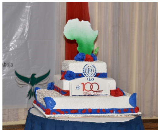
ILO Centenary cake

The tripartite Partners of the International Labour Organization (ILO) in Nigeria have commended the organization for all its support in the development of Nigeria. In their speeches at the celebration of the ILO centenary across the world and 60 years of ILO in Africa, the speakers alluded to the various supports of the ILO over the years that have contributed to the progress made so far by Nigeria.