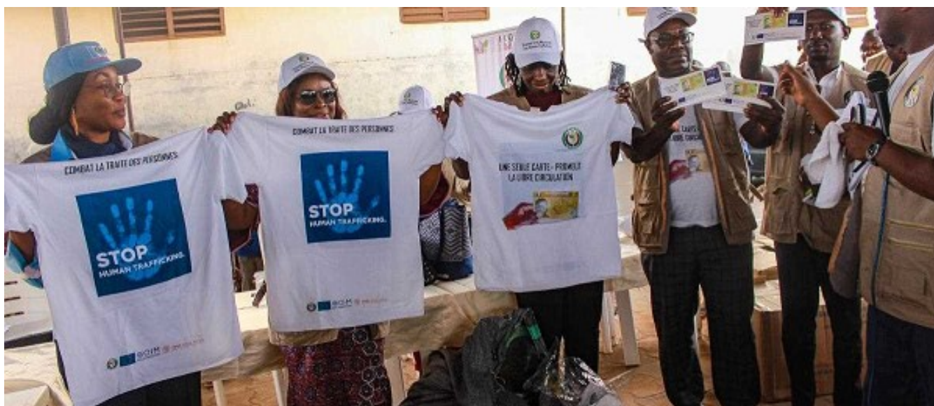
Some participants in the itinerant campaign, organized by the ECOWAS Commission and the International Organization for Migration (IOM) in Nigeria, which started at the Mile 2 motor park in Lagos, through Benin Republic and Togo.

From 23 to 26 April, communities, law enforcement officers and transporters along the Nigeria-Benin and Benin-Togo borders joined an awareness raising campaign aimed at addressing the need for better border controls and security.