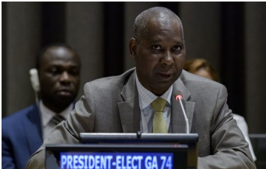
Newly-elected Nigerian UN General Assembly President, Tijani Muhammad-Bande.

T ijani Muhammad-Bande, Nigeria's current UN Permanent Representative, was elected to head the world body by acclamation on 4 June 2019, in the General Assembly Hall in New York and will succeed Ecuador's Maria Fernanda Espinosa. "Peace and security, poverty eradication, zero hunger, quality education, climate action and inclusion will constitute a major priority of my presidency", said the Nigerian ambassador.