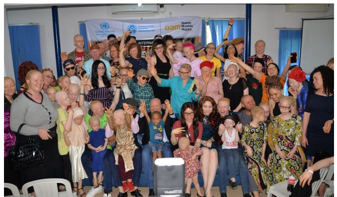
A group photograph of some of the participants.