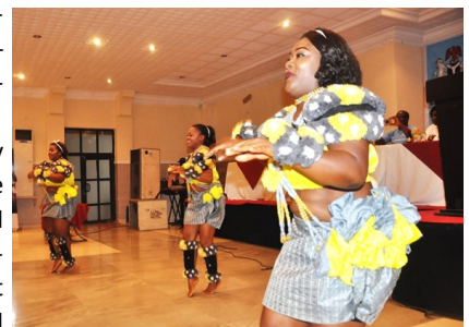
Beautiful dance in Calabar

In Calabar, the day started with the #stepwithrefugees road walk, attended by refugees, host, government officials, partners and UNHCR. Participants