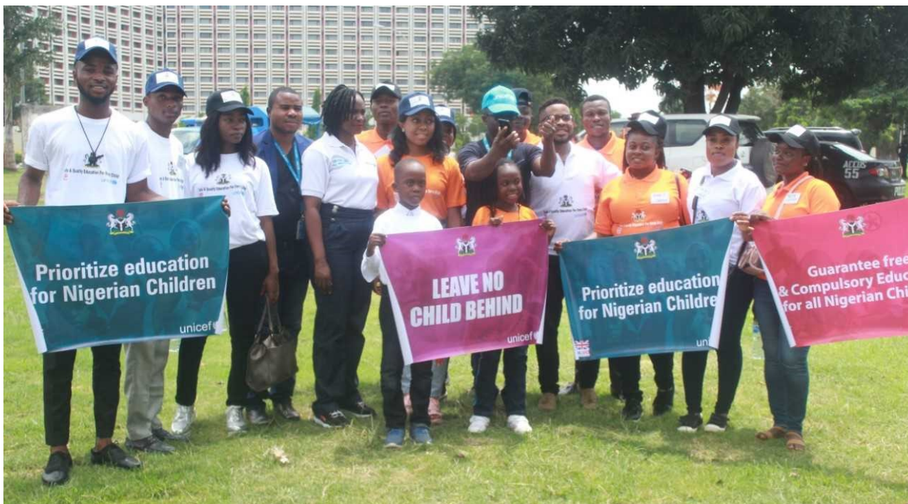
Young people in Abuja join their peers across States in northern Nigeria to advocate for quality education for all children, especially girls.

On the 2019 Day of the African Child (celebrated on 16 June every year), about 2000 youth across 10 Nigerian states - including the Federal Capital Territory (FCT), Abuja - presented petitions to their governors, parliamentarians, policymakers and other influential persons in a mass effort to draw attention to the need to act on commitments to increasing access to safe, quality education for all children, especially girls.