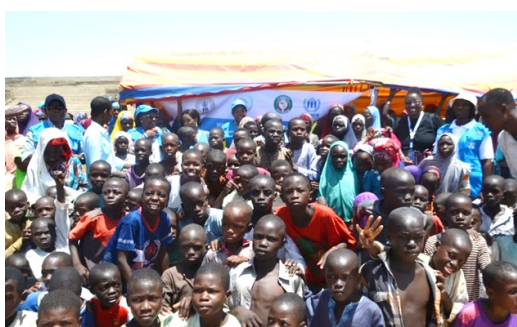
Activities including the internally displaced children in Maiduguri

In Maiduguri, the WRD activities started on 17 June, at the Mohamed Goni Internally Displaced Persons (IDP) camp (Stadium Camp) with traditional dance, theatre and music. The WRD week here featured thought-provoking discussions and debates with members of the academia, media and humanitarian actors including professors of the University of Maiduguri, the Nigerian Human Rights Commission and UNHCR, at the NTA TV station, on Peace FM Radio Station and local radio stations. These discussions were complemented by community dialogue and awareness activities to engage the IDPs in the camps in Banki, Monguno, Damasak and Ngala, Bama and Pulka, organized by UNHCR