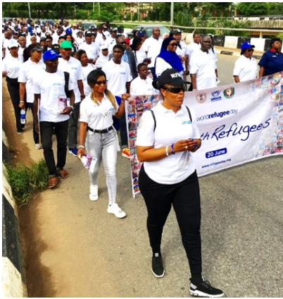
Road walk in Abuja

The UN Refugee Agency (UNHCR) observed the World Refugee Day (WRD) on 20 June 2019 with a week-long commemoration in collaboration with the National Commission for Refugees, Migrants and Internally Displaced (NCFRMI), the Economic Community of West African States (ECOWAS) and other key partners.