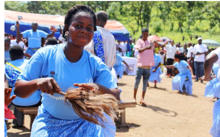
Colourful activities in Adikpo

In her remarks, the HOLGA reminded refugees that they are welcome and the UNHCR Head of Office appreciated the support so far from stakeholders responding to the situation. In their messages, the refugees reminded that they have mixed feelings of joy and sadness, as they have found protection in asylum, but the crisis continues in Cameroon.