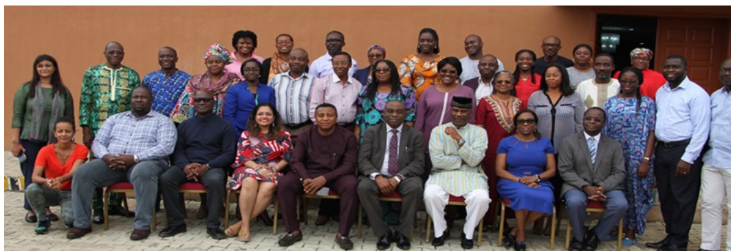
Joint UN team on AIDS retreat, Lagos, 11-14 June 2019

The annual mid-year retreat for the UN Joint team on AIDS (UNJTA) in Nigeria took place in Lagos from 11-14 June 2019. The meeting brought together some 40 participants from the UN agencies, the government (NACA and MOH) and major donors (PEPFAR and Global Fund) to reposition the HIV response and maximise impact in Nigeria, in the aftermath of the historical Nigeria AIDS Indicator and Impact Survey (NAIIS). The retreat was framed within the broader context of the 2018-2022 United Nations Sustainable Development Partnership Framework (UNSDPF), along with the ongoing UN reform agenda at the country level emphasizing new generation country teams fixated on strategic collective actions, results and accountability.