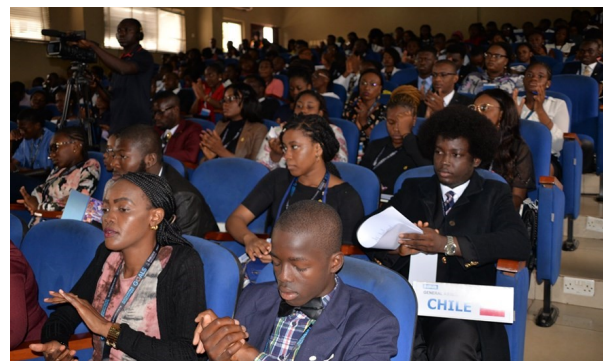
A cross-section of delegates at the BIMUN 2019 at Babcock University, Ilishan Ogun State.