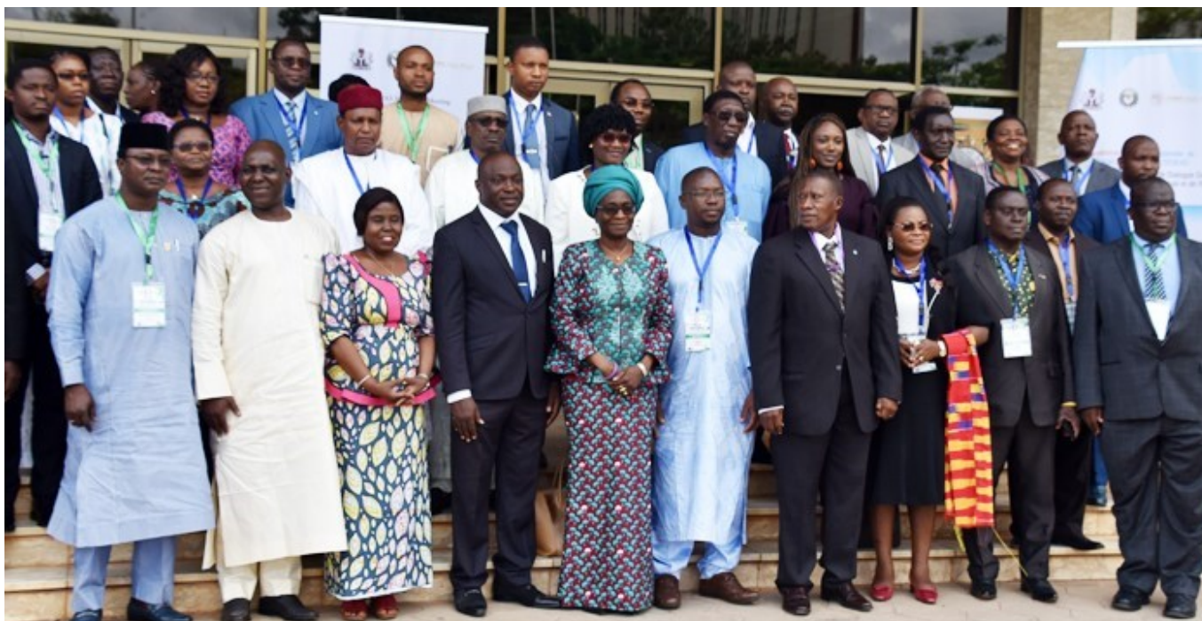
A group photograph of dignitaries at the 3-day General Assembly of the ECOWAS Tripartite Social Dialogue Forum in Abuja.

In order to strengthen dialogue, coordination and collaboration among Member States in the Labour and Employment fields within the region, the ECOWAS Commission organised a 3-day General Assembly of the ECOWAS Tripartite Social Dialogue Forum in Abuja.