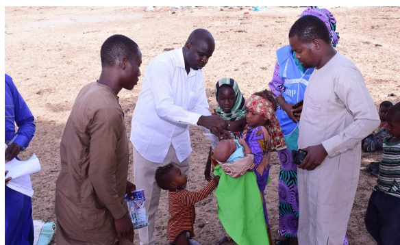
WHO-supported immunisation services to nomadic populations in border communities of Katsina and Jigawa States.

In Katsina state, 1,645 eligible nomadic children were reached during nomadic vaccinations in Ingawa and Maiadua LGAs between April and June 2019 from the conduct of Outbreak Response (OBR) and in between rounds, respectively.