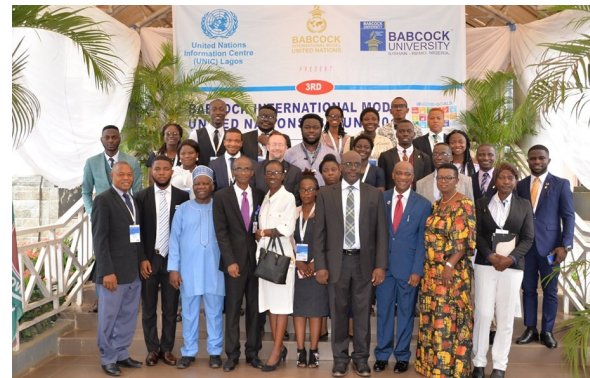
A group photograph of conference speakers and officials at BIMUN 2019 held on 9 July