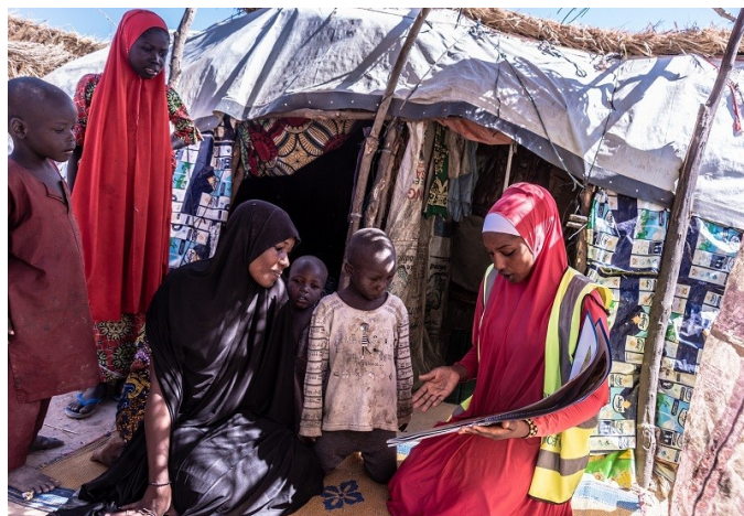
With support from the Italian Government, nutrition community volunteers go door-to-door to ensure mothers practice exclusive breastfeeding, and also teach them about good infant and young child feeding practices.

In Borno and Yobe States, UNICEF supports the State Primary Health Care Development Agencies to accelerate the reduction of child mortality and improvement of maternal health and nutrition. This is done through improved access to essential and quality maternal, newborn, child health and nutrition services.