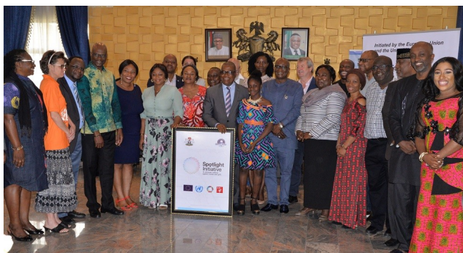
A group photograph of the Spotlight launch held at the Government House Calabar, Cross River State.

The initiative, a partnership of European Union in Nigeria and United Nations Nigeria, was jointly launched by the Deputy Gov-