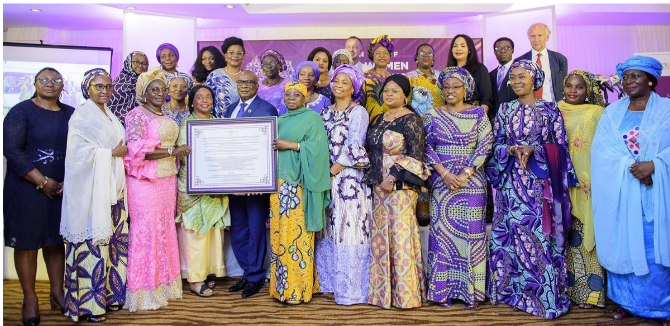
The AWLN Nigeria Chapter Steering Committee presenting the “CALL TO ACTION” during the Official Launch of the AWLN Nigeria Chapter on 01 July 2019.