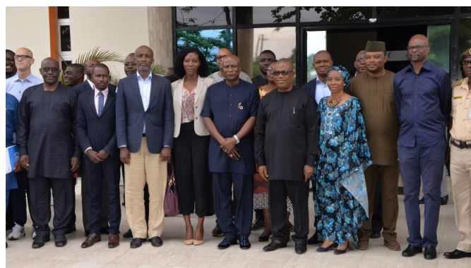
Members of the UNCT and Cross River State Deputy Governor, Prof Ivvara Esu (5th from the right)

Welcoming the Heads of UN Agencies to Calabar, the Deputy Governor thanked the United Nations for selecting Cross River