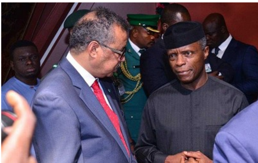
Director General of World Health Organization (WHO), Dr Tedros Ghebreyesus (Left), discusses with Nigeria's Vice President His Excellency, Professor Yemi Osinbajo (Right).

Health security and emergency preparedness was on the front burner of discussion as the Director General of World Health Organization (WHO), Dr Tedros Ghebreyesus, met with Nigeria's Vice President His Excellency, Professor Yemi Osinbajo in Abuja.