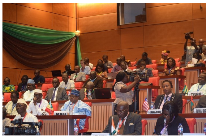
A group photograph of some of the participants.

The 3-day (16 – 18 July 2019) forum was organised by Economic Community of West African States (ECOWAS) with technical and financial support from the International Labour Organization (ILO). Over 70 participants including representatives from the 15 ECOWAS Member States were in attendance. These participants were also drawn from Government institutions, Ministries, Trade Unions, Employer groups, ECOWAS Parliament, ECOWAS Commission and the Media.