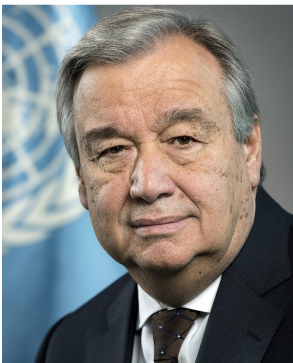
United Nations Secretary-General Antonio Guterres

The Secretary-General reiterates the solidarity of the United Nations with the Government and people of Nigeria in their efforts to counter terrorism and violent extremism.