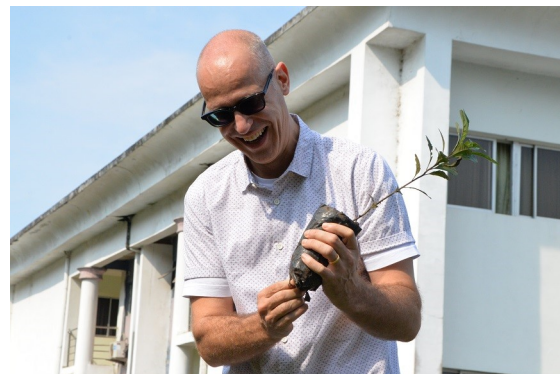
The Country Representative of UNODC in Nigeria, Mr Oliver Stolpe, prepares to plant a tree on 13 July 2019 in Calabar