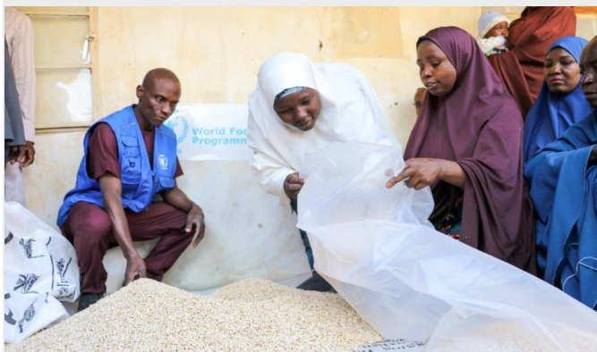
A staff of WFP and some beneficiaries of hermetic storage training in Yobe

Training carried out by the United Nations World Food Programme (WFP) in Yobe State, North East Nigeria, has improved methods of food storage after the harvest season.