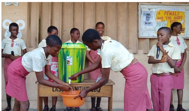
Ambassadors demonstrating handwashing

With financial support of Global Affairs Canada, and in partnership with the Dr Ameyo Stella Adadevoh Health Trust (DRASA), the World Health Organization (WHO) is empowering students to become effective agents on antimicrobial resistance and health hygiene.