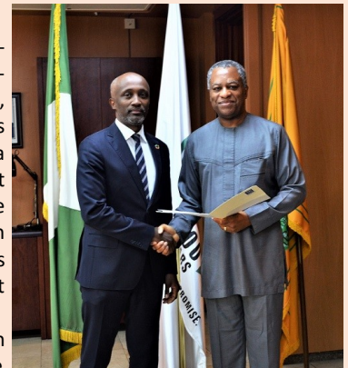
UNDP Resident Representative, Mohamed Yahya, (Left) and Honourable Minister of Foreign Affairs, Geoffrey Onyeama,

During the presentation of the credentials to the Honourable Minister of Foreign Affairs, Geoffrey Onyeama, Mr. Yahya explained that "Our activities