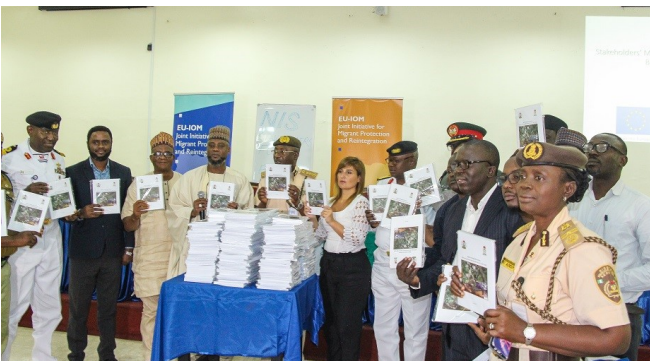
Dignitaries present the National Border Management Strategy and Action Plan in Abuja

The International Organization for Migration (IOM) and the Nigerian Immigration Service (NIS) presented the National Border Management Strategy and Action Plan in Abuja, Nigeria.