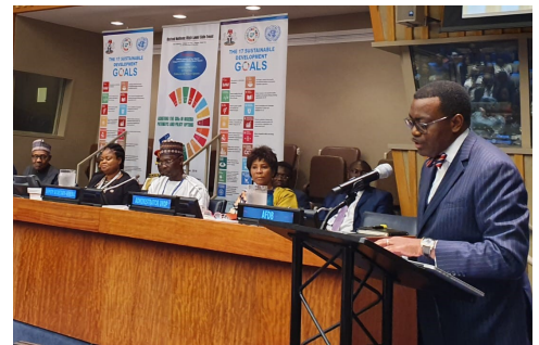
President of the African Development Bank (ADB), Dr Akinwunmi Adesina, addresses the audience

The Federal Government of Nigeria, in collaboration with the United Nations Development Programme (UNDP), on 24 September, launched its recently developed integrated SDGs simulation model (iSDG Nigeria), at the Nigeria High Level Side Event on the margins of the 74th UNGA in New York.