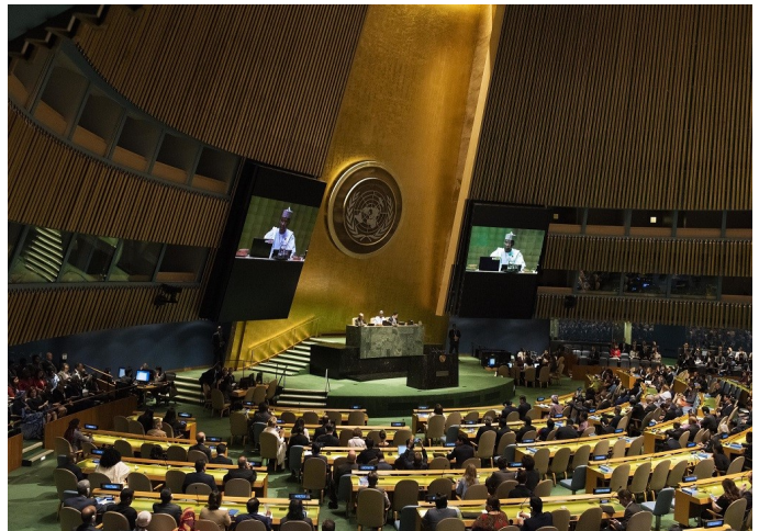
First Meeting of the 74th Session of the UN General Assembly..

He cited the president-elect’s tenure as Nigeria’s UN Ambassador; his expertise in political science and public administration; and the “invaluable insights” he has into Africa’s challenges and world affairs in general, particularly regarding the Organization’s peace and security work, sustainable development and human rights.