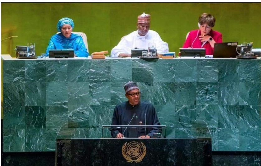
Nigeria's President Muhammadu Buhari addresses the 74th Session of the UN General Assembly (UNGA) on 24 September. Seated on the Dias L-R: UN Deputy Secretary General, Ms Amina Muhammed; President of the UNGA, Prof Tijjani Muhammad-Bande and another senior UN Official.

It was a glorious seven-day period for Nigeria at the UN Headquarters in New York as Nigeria's Prof Tijjani Muhammad-Bande took over the reins of leadership of the 74th Session of the UN General Assembly (UNGA) on the 17 September while the President of Nigeria, H. E. Muhammadu Buhari, on 24 September, took his turn to address world leaders at the Assembly, wherein also seated on the Dias, Nigeria's Amina Muhammed, the UN Deputy Secretary General.