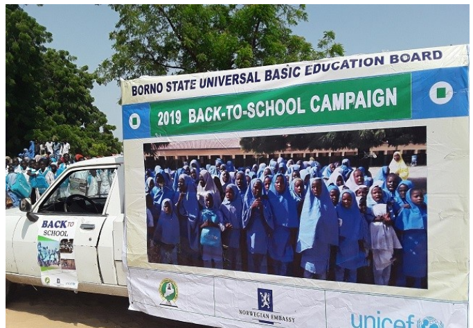
Enrolment Drive Campaign in Borno State targets bringing 1 million children back to school.