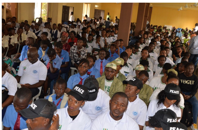
A cross-section of participants at the observance of the International Day of Peace in Lagos.

The United Nations Secretary-General Antonio Guterres has stated that today's world was faced with a 'Climate Emergency' and global crisis, which he described as a new threat to security and lives.